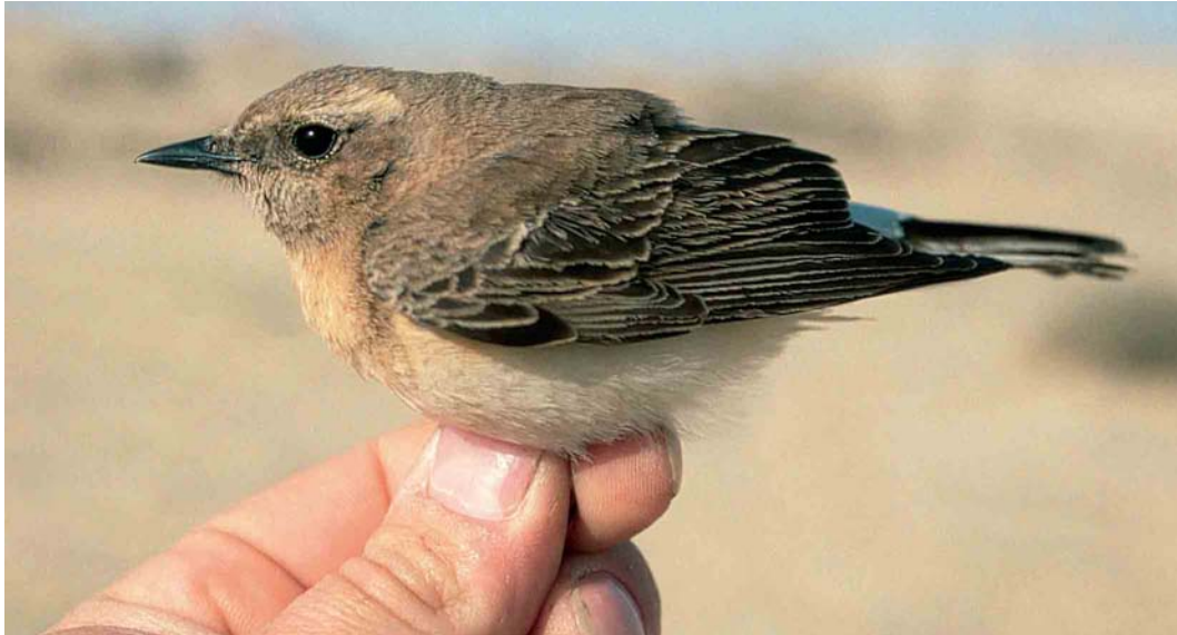
86 'Black-eared wheatear' / 'blonde tapuit' Oenanthe hispanica/melanoleuca , female, Egypt, March 1997 (Johan Vanautgaerden). Since this bird is photographed on migration in Egypt, it is most likely an Eastern Black-eared Wheatear O melanoleuca but as a vagrant elsewhere it would be impossible to identify with certainty. A little paler on the upperparts than typical melanoleuca and a little greyer, less ochre than typical Western Black-eared Wheatear O hispanica , the bird is intermediate and could be any of the two. Also, note the lack of a grey or brown tinge in the breast-band, which would have been a pointer towards melanoleuca . Fairly long primary projection indeed indicates melanoleuca .