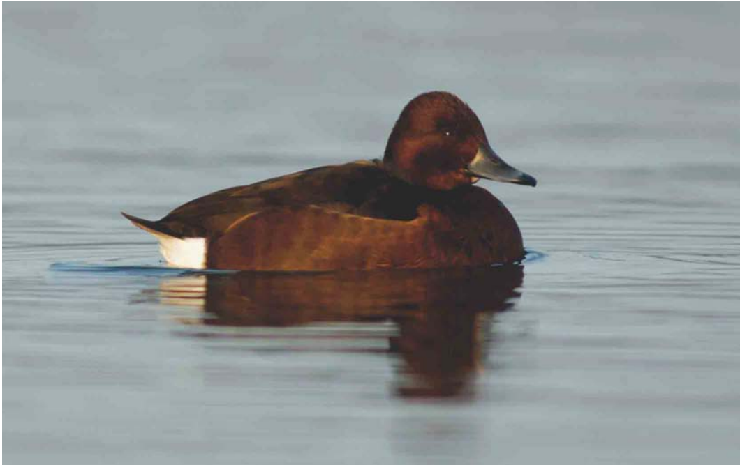
135 Witoogeend / Ferruginous Duck Aythya nyroca , vrouwtje, Heel, Limburg, 10 februari 2003