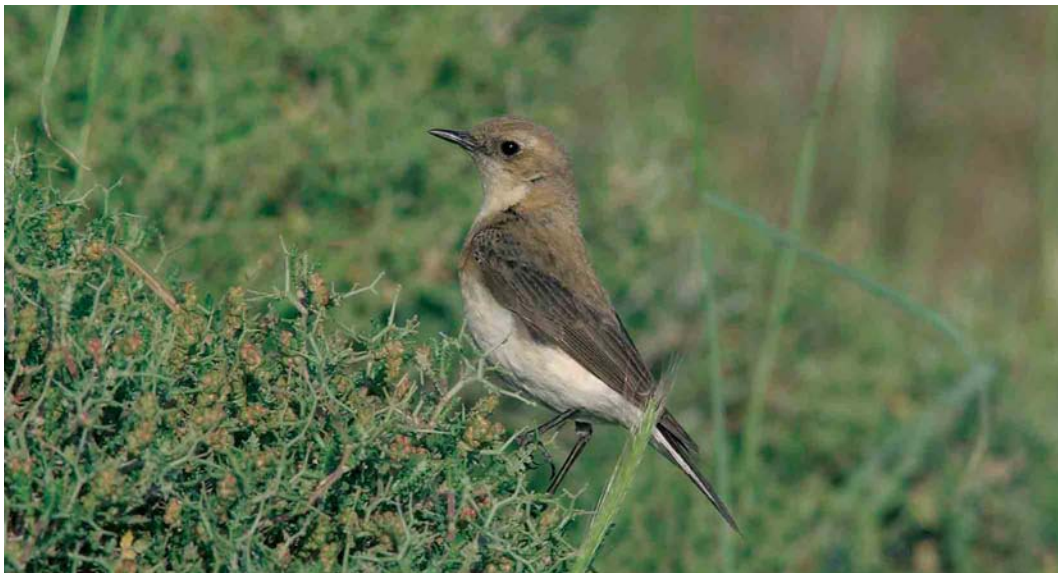
87 'Black-eared wheatear' / 'blonde tapuit' Oenanthe hispanica/melanoleuca , female, Lesvos, Greece, April 2002. Lack of any obvious black tones to ear-coverts or wings shows this to be a female rather than an immature male. While some hispanica have an ochre or russet tone to the upperparts and some melanoleuca are darker, more obviously deep brown, birds like this one occur in both taxa. Since the photograph is taken on Lesvos, it is most likely melanoleuca but it is not possible to identify a vagrant displaying a similar appearance.