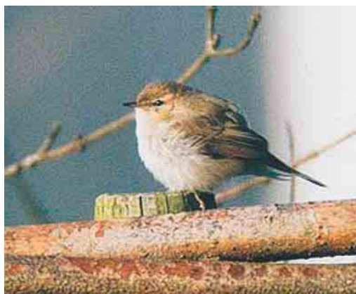
147 Witbandkruisbek / Two-barred Crossbill Loxia leucoptera bifasciata , mannetje, IJzeren Veld, Huizen, Noord-Holland, 3 november 2002 ( Wim Heylen ) 148 Rode Wouw / Red Kite Milvus milvus , Oosterland, Zeeland, 14 februari 2003 ( Marten van Dijl ) 149 Kleine Alk / Little Auk Alle alle , Zoetermeer, Zuid-Holland, 16 februari 2003 ( Edwin Winkel ) 150 Siberische Tjiftjaf / Siberian Chiffchaff Phylloscopus collybita tristis , Hoogkerk, Groningen, Groningen, 24 januari 2003 ( Huub Lanfers )

de Brabantsche Biesbosch, Noord-Brabant, 12 begin januari in de omgeving van 's-Hertogenbosch, Noord-Brabant, 17 op 1 februari bij de visvijvers van Valkenswaard, Noord-Brabant, 10 op 2 februari in De Banen, Limburg, 18 op 17 februari in Polder Groot-Mijdrecht, Utrecht, en 12 op 16 februari bij Doornspijk, Gelderland. Vroege Lepelaars Platalea leucorodia werden opgemerkt op 9 februari in de Beemster, Noord-Holland (vier), en op 10 februari een uitzonderlijke groep van 72 vliegend over het Veerse Meer, Zeeland. Een Zwarte Wouw Milvus migrans werd gemeld op 17 januari bij Leusden, Utrecht. Behalve zeven losse Rode Wouwen M. milvus , verbleven er twee vanaf 8 januari in de omgeving van Ouwerkerk en Oosterland, Zeeland. Niet minder dan 17 Zeearenden Haliaeetus albicilla verbleven in Nederland, waaronder adulte (nog) op 1 januari langs het Drontermeer, Gelderland, en op 21 februari