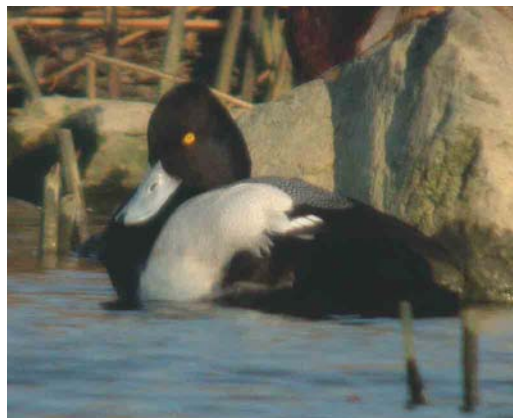
138 Witbuijkrotganzen / Pale-bellied Brent Geese Branta hrota, Camperduin, Noord-Holland, 24 februari 2003 139 Groenlandse Kolgans / Greenland White-fronted Goose Anser albifrons flavirostris, Slochteren, Groningen, 9 februari 2003 140 Zwarte Rotgans / Black Brant Branta nigricans, adult, Grevenbicht, Limburg, 24 november 2002 cf Dutch Birding 25: 64, 71, 2003. 141 Witooggeend / Ferruginous Duck Aythya nyroca, mannetje, Schipbeek, Diepenheim, Overijssel, 17 februari 2003 142 Kleine Topper / Lesser Scaup Aythya affinis, adult mannetje, Scheelhoek, Zuid-Holland, 19 februari 2003