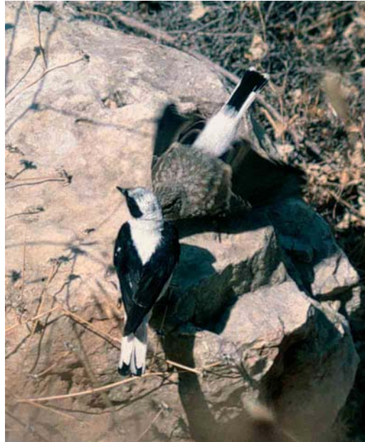
75 Eastern Black-eared Wheatears / Oostelijke Blonde Tapuiten Oenanthe melanoleuca , adult male (lower left) and juvenile, Crete, Greece, July 1984 (René Pop). Typical bird with obvious grey suffusion to crown and nape, and all-white triangular, rather narrow mantle, giving bi-coloured character to upperparts. By July, adult melanoleuca males rarely display any obvious ochre. Moulting has started and the middle, black, rectrices are missing.

males point towards melanoleuca , while bright, deep ochre upperparts point towards hispanica . In spring, whitish crown and nape with pale brownish/greyish tinge and only a slight ochre/orange touch on the mantle, as well as whitish breast and belly indicate melanoleuca , while deep ochre, uniform upperparts indicate hispanica . The most reliable of these plumages is the typical autumn melanoleuca plumage. The others are not conclusive and will need supportive characters for identification. Melanoleuca has more black on the scapulars, leaving a narrower pale mantle section than on hispanica – a good additional field mark for typical birds, mainly in spring. There is more black on the head in melanoleuca than in hispanica , thus covering a larger area of the lores, the forehead, the ear-coverts and – in black-throated males – the throat. This is the most reliable single field character in autumn as well as spring, and safe identification normally requires trustworthy assessment of