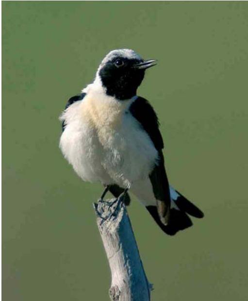
74 Eastern Black-eared Wheatear / Oostelijke Blonde Tapuit Oenanthe melanoleuca , adult male, Lesvos, Greece, April 2002 (René Pop). Rather typical bird with much black on lores, forehead and throat, too much for hispanica . The ochre tone on the breast is very weak (and will probably have disappeared within a month or so), leaving a narrow whitish fringe below the black throat-bib, more typical for hispanica .