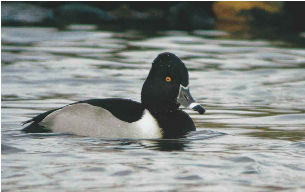
134 Ringsnaveleend / Ring-necked Duck Aythya collaris , adult mannetje, Hardenberg, Overijssel, 19 januari 2003