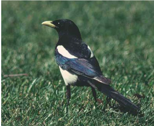
96 Yellow-billed Magpie / Geelsnavelekster Pica nuttalli , Nojoqui Park, California, USA, 12 March 1982 (Arnoud B van den Berg)