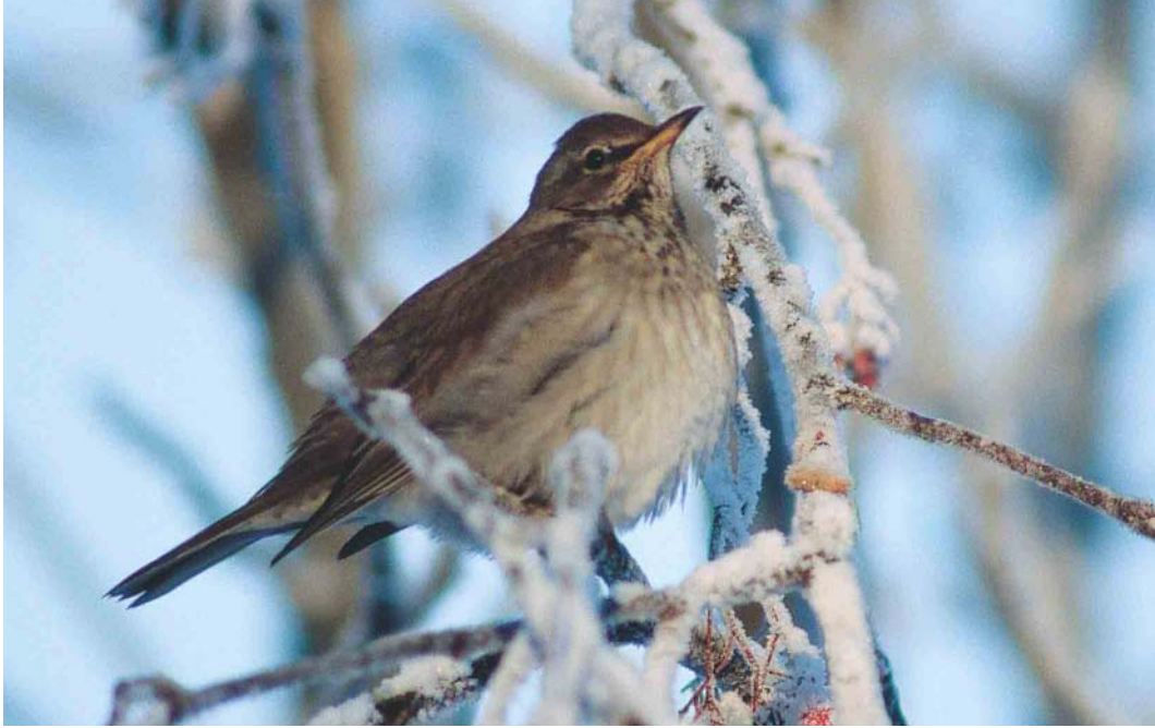
127 Black-throated Thrush / Zwartkeellijster Turdus ruficollis atrogularis , Rautjärvi, Finland, January 2003 (Pekka Komi)