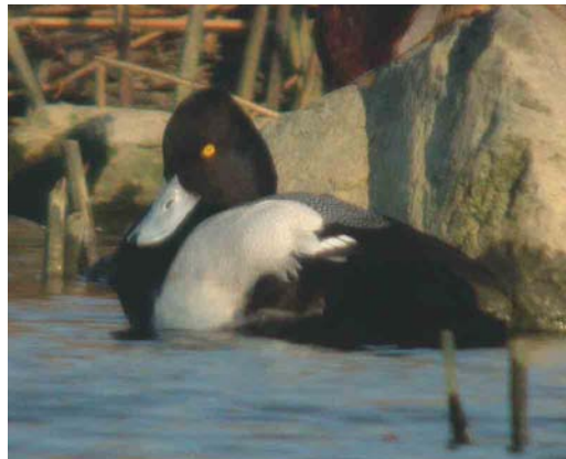
138 Witbuikrotganzen / Pale-bellied Brent Geese Branta hrota, Camperduin, Noord-Holland, 24 februari 2003 139 Groenlandse Kolgans / Greenland White-fronted Goose Anser albifrons flavirostris, Slochteren, Groningen, 9 februari 2003 140 Zwarte Rotgans / Black Brant Branta nigricans, adult, Grevenbicht, Limburg, 24 november 2002 cf Dutch Birding 25: 64, 71, 2003. 141 Witooggeend / Ferruginous Duck Aythya nyroca, mannetje, Schipbeek, Diepenheim, Overijssel, 17 februari 2003 142 Kleine Topper / Lesser Scaup Aythya affinis, adult mannetje, Scheelhoek, Zuid-Holland, 19 februari 2003