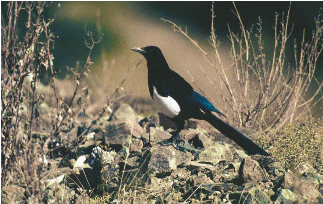
102 Asir Magpie / Asirekster Pica (pica) asirensis , Raydah, Asir Province, Saudi Arabia