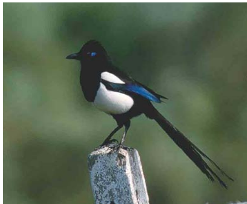
105 Maghreb Magpie / Maghrebekster Pica (pica) mauritanica , Sidi Bou Rhaba, Morocco, 24 March 2002 (Arnoud B van den Berg)

This taxon may prove to be the basal taxon within the Pica group (see above). It is widespread in eastern Asia, occurring from Amurland, Russia, through China, Korea and (introduced) on Kyushu, Japan, south to Vietnam and Laos. It looks much like nominate pica but is characterized by a relatively small and short bill, relatively long wings and short tail and a more purple blue gloss on wings and tail. Its chatter call is much slower than the same call of nominate pica and therefore closely resembles the chatter call of both Nearctic taxa. The strong similarities between the Nearctic taxon hudsonia and the Palearctic taxon sericea (including anderssoni ) were already noted in the mid-1900s by the German/Hungarian ornithologist Endre Kleiner (who changed his name after World War II to Anders Keve) (Kees Roselaar in litt). Sound recordings from Japan can be found in Ueda (1998). Behaviourally, it appears to be more