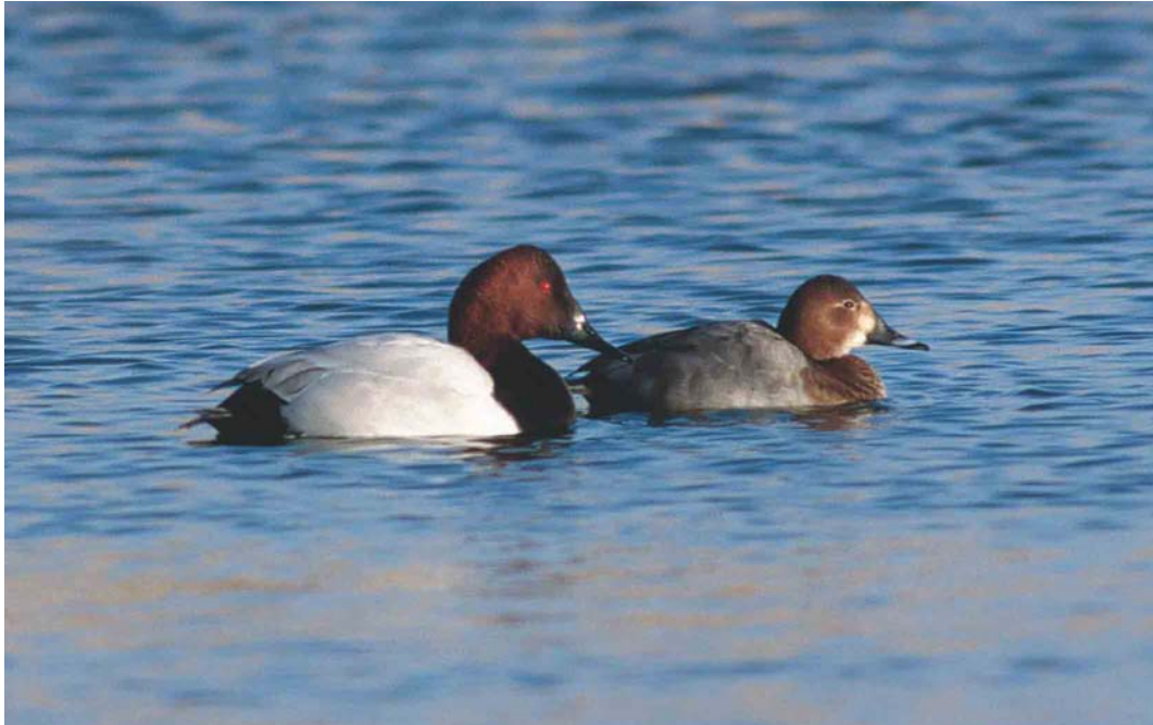
133 Grote Tafeleend / Canvasback Aythya valisineria , adult mannetje, met Tafeleend / Common Pochard A ferina , vrouwtje, Castricum, Noord-Holland, januari 2003