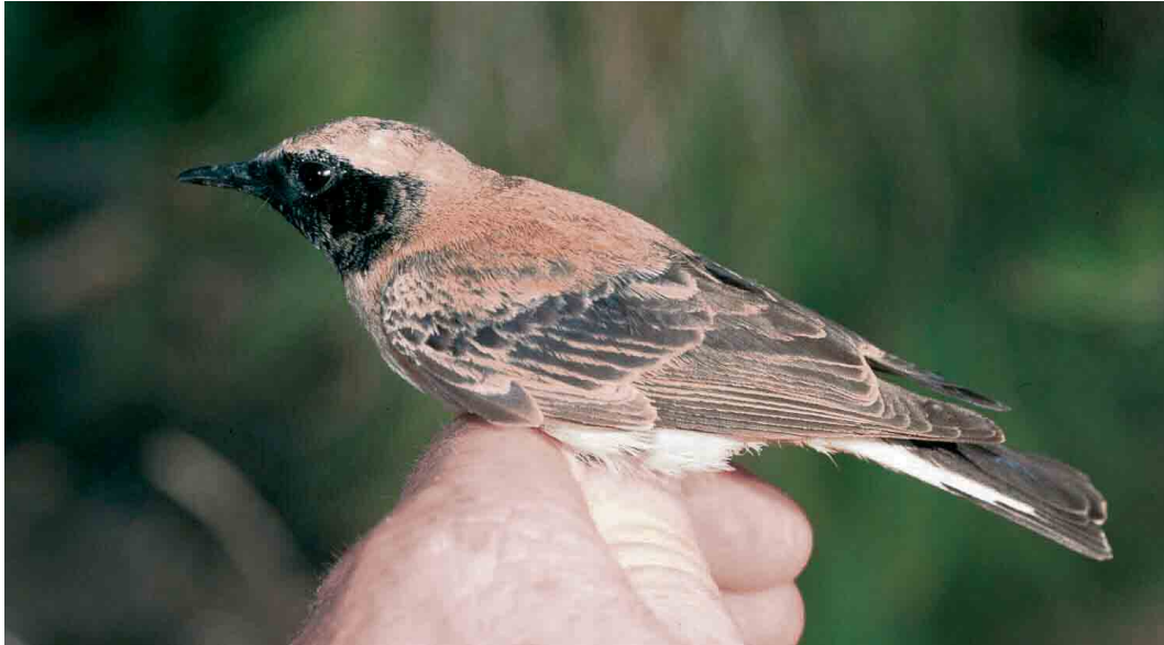
76 Eastern Black-eared Wheatear / Oostelijke Blonde Tapuit Oenanthe melanoleuca , immature male, Israel, March 2001 (Arend Wassink). Traces of pale fringes on the black throat and ear-coverts, as well as newly moulted black median coverts and most greater coverts in contrast with brownish wing show this male to be an immature. New coverts are black with slight brownish tinge, not jet-black as in Western Black-eared Wheatear O. hispanica . Although the rather bright ochre upperparts are more typical for hispanica , the large throat-bib and extensive black above the lores and the base of the bill verify that this is a melanoleuca .

narrower pale mantle section than in hispanica , which is a good supportive field mark for typical birds in spring. Moreover, the same difference in the extent of the black on the head (lores, forehead, ear-coverts and throat) as in adult males applies to immature spring males of melanoleuca and hispanica . However, there is one exception, since immature melanoleuca may have a small hispanica -type black face-mask. Thus, much black on the lores indicates melanoleuca , while little black on the lores not necessarily indicates hispanica .