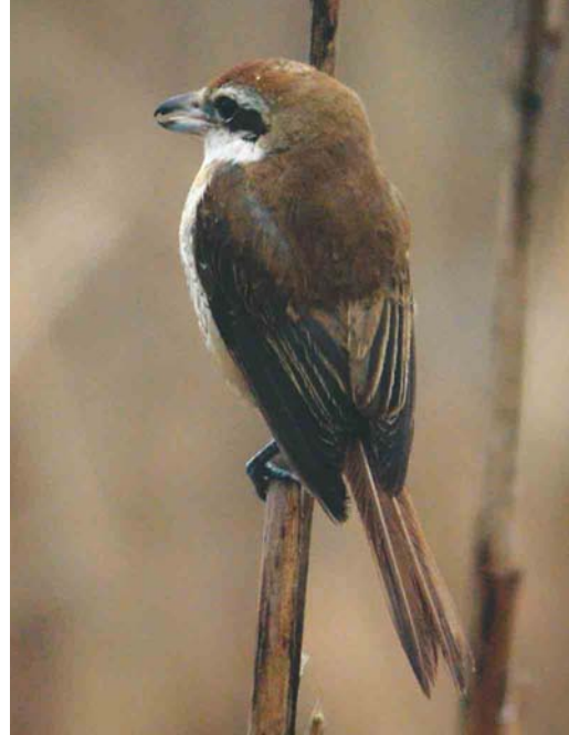
112 Dwergaalscholver / Pygmy Cormorant Microcarbo pygmeus , adult, Eijsder Beemden, Limburg, maart 2003 113 Brown Shrike / Bruine Klauwier Lanius cristatus , La Tomina, Modena, Italy, 18 January 2003 114 Northern Gannet / Jan-van-gent Morus bassanus , adult, Lac Léman, Switzerland, February 2003