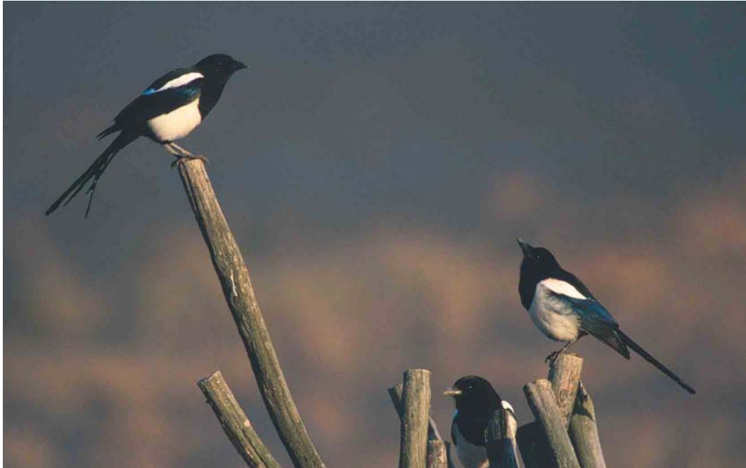
99 Oriental Magpies / Oosterse Eksters Pica (pica) sericea , Ganghwa-do, South Korea, 26 October 2002