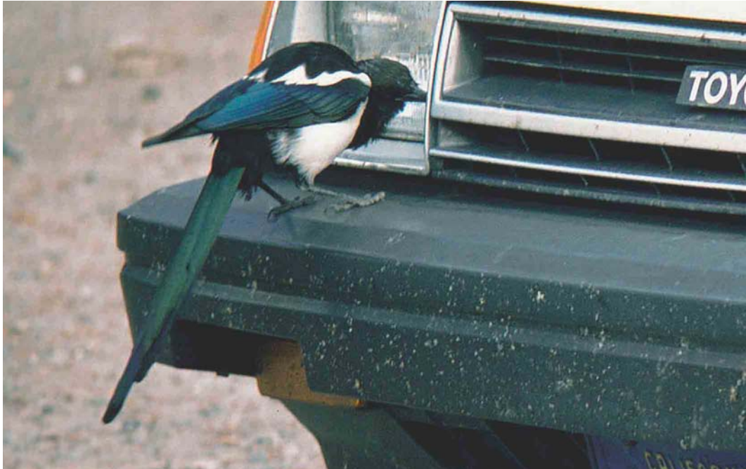
103 Black-billed Magpie / Amerikaanse Ekster Pica hudsonia , Glacier NP, Montana, USA, 19 September 1988