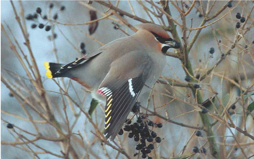
145 Pestvogel / Bohemian Waxwing Bombycilla garrulus , Noordwijk, Zuid-Holland, januari 2003