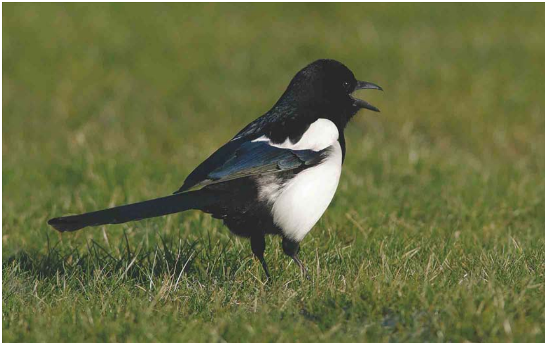
100 Eurasian Magpie / Ekster Pica pica pica , Julianadorp, Noord-Holland, Netherlands, 14 February 2003