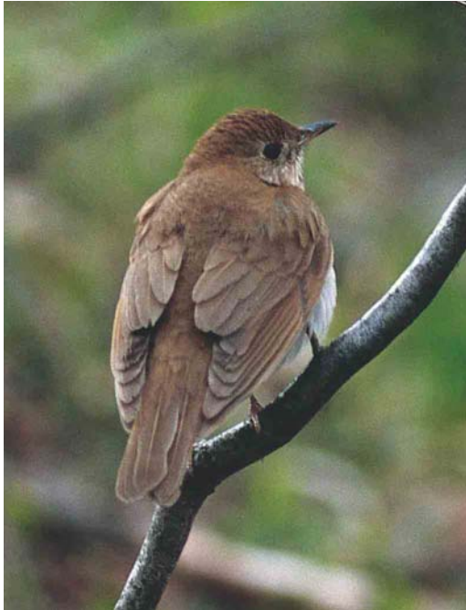
Mystery photograph III (May)

until October. Hence, vagrant juveniles of both species cannot be expected in early September in northern Europe.