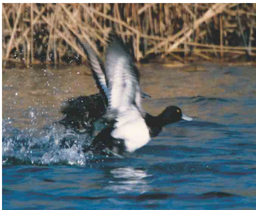
152 Kleine Topper / Lesser Scaup Aythya affinis , adult mannetje, Scheelhoek, Zuid-Holland, 20 februari 2003

Dwergaalscholver in Limburgs grensgebied Op 1 maart 2003 besloot Paul van Engelshoven zijn zojuist aangeschafte digitale camera uit te proberen bij de Eijsder Beemden ten zuiden van Maastricht, Limburg. De eerste drie foto's die hij door zijn telescoop maakte waren van een kleine aalscholver die op een paar stronken in het water zat. Hij dacht aan een Kuifaalscholver Stictocarbo aristotelis en belde 's middags een kennis die ook naar vogels keek met deze mededeling; dit leidde echter niet tot vervolgacties. Op 2 maart besloot Ben Gaxiola de Eijsder Beemden – zijn voormalige 'local patch' – te bezoeken omdat hij vanwege familieverplichtingen het weekend in Limburg vertoefde. Op weg terug naar zijn auto werd rond 16:30 zijn aandacht getrokken door een kleine aalscholver en hij dacht onmiddellijk met een Dwergaalscholver Microcarbo pygmeus van doen te hebben. Hij zag de vogel zonder telescoop en was door het slechte weer nog niet 100% zeker van de determinatie. De volgende ochtend bleek de Dwergaalscholver vroeg aanwezig op zijn visplek en kon Ben de determinatie definitief afronden. De vogel was in zomerkleed, met een donkere keel, iets lichtere buik en witte pluimveertjes op met name oorstreek en achterkop. Om c 07:40 vloog de vogel op in zuidelijke richting en verdween richting België. Rond 17:00 verscheen hij weer in de Eijsder Beemden, blijkbaar zijn vaste slaapplek.