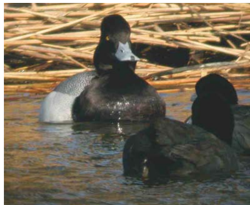
153 Kleine Topper / Lesser Scaup Aythya affinis , adult mannetje, Scheelhoek, Zuid-Holland, 19 februari 2003 (Max Berlijn)

De volgende dagen bleek de vogel het beste vroeg in de ochtend of in de late middag waargenomen te kunnen worden bij het uit- of invliegen van zijn slaapplek. Op 4 maart werd hij door twee doortastende Belgische vogelaars midden op de dag teruggevonden op een met wilgen begroeide plas bij Hermalle-sous-Argenteau bij Visé, Liège, België, c 8 km ten zuiden van de Eijsder Beemden, en kon daar door verschillende Belgische twitchers worden bewonderd. Op 5 maart herhaalde dit patroon zich; gedurende de dag ontstond er nog enige tijd twijfel omtrent de determinatie en