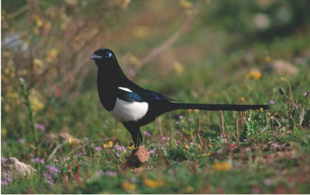
101 Maghreb Magpie / Maghrebekster Pica (pica) mauritanica , Sidi Bou Rhaba, Morocco, 24 March 2002