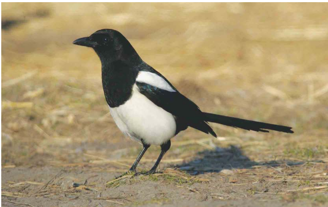
104 Eurasian Magpie / Ekster Pica pica pica , Julianadorp, Noord-Holland, Netherlands, 14 February 2003