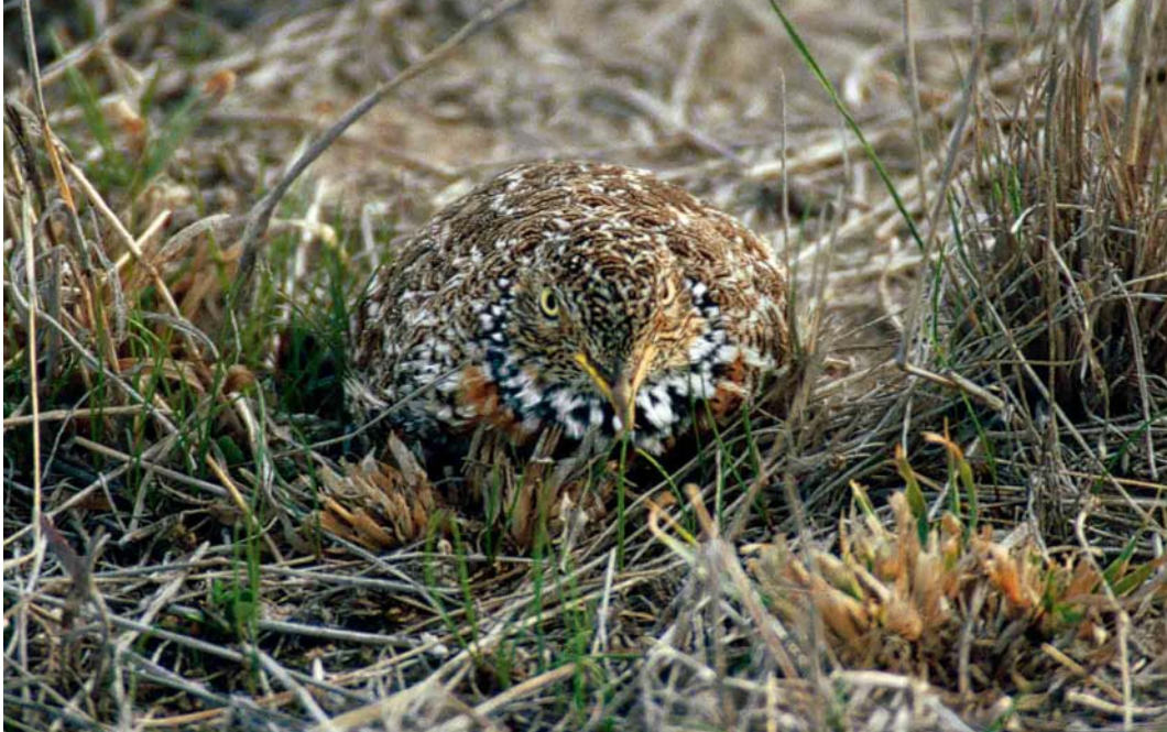
93-94 Plains-wanderer / Trapvechtkwartel Pedionomus torquatus , adult female, near Deniliquin, New South Wales, Australia, 20 June 2002 (Pieter van der Luit)