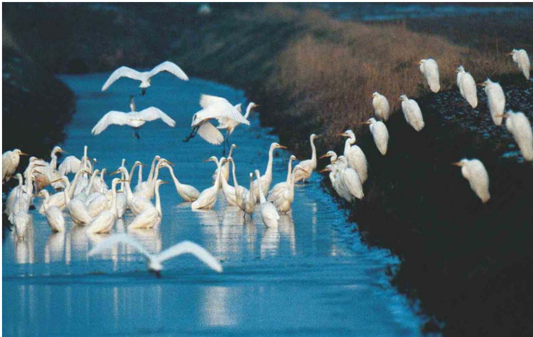
137 Grote Zilverreigers / Great Egrets Casmerodius albus , Brabantsche Biesbosch, Noord-Brabant, januari 2003 (Marco de Pauw)