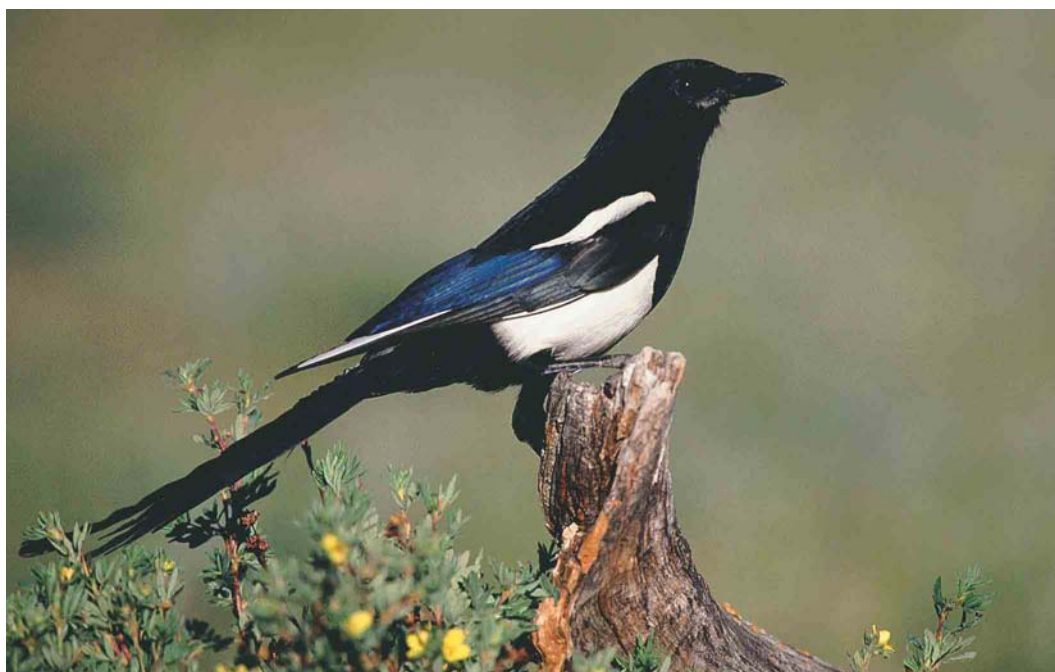
95 Black-billed Magpie / Amerikaanse Ekster Pica hudsonia , Rocky Mountains NP, Colorado, USA, June 2001 (Brian E Small)

Black-billed Magpie was described as Corvus hudsonius by Sabine in 1823 from Cumberland House, Saskatchewan, Canada. It is resident from southern coastal Alaska, USA, through western Canada and northern Minnesota, USA, south to California, Nevada, Utah, Arizona, western Oklahoma, Kansas and Nebraska, USA. Wan-