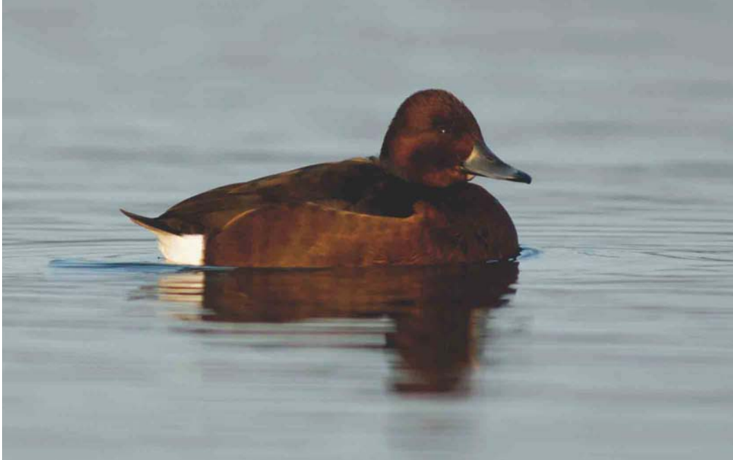
135 Witoogeend / Ferruginous Duck Aythya nyroca , vrouwtje, Heel, Limburg, 10 februari 2003