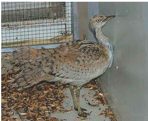
[Dutch Birding 25: 149-151, 2003]

151 Oostelijke Kraagtrap / Macqueen's Bustard Chlamydotis macqueenii , eerste-winter (gevangen bij Lombardsijde, West-Vlaanderen, op 20 januari 2003), Oostende, West-Vlaanderen, 22 januari 2003 (François Roland)