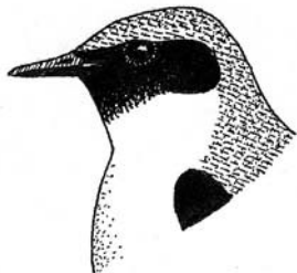
FIGURE 3 Adult 'half-bib' spring male Western Black-eared Wheatear / Westelijke Blonde Tapuit Oenanthe hispanica (Magnus Ullman). While most black-throated male hispanica have slightly smaller throat-bib than Eastern Black-eared Wheatear O melanoleuca , a minority has noticeably restricted throat-bib, so small that the silhouette of the black ear-coverts becomes clearly visible (the 'rear-end-shape' of the ear-coverts tends to be suggested in many normal hispanica as well). In most 'half-bib' males, the lower border of the bib is diffusely marked.

above the culmen, while in others the area of contact is 1 mm, occasionally more (see figure 4). Although the difference is normally obvious on birds which are seen well, there may be problematic individuals. Thus, this is a good character in most birds, while some birds seem intermediate.