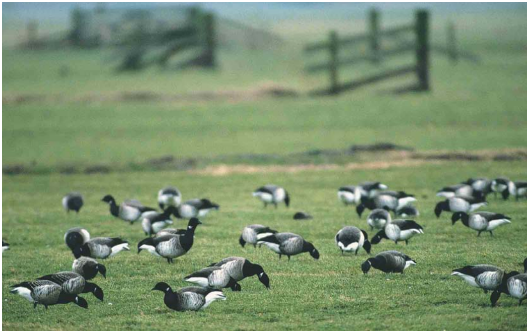
130 Witbuikrotganzen / Pale-bellied Brent Geese Branta hrota , met Rotgans / Dark-bellied Brent Goose B bernicla , Camperduin, Noord-Holland, 6 februari 2003