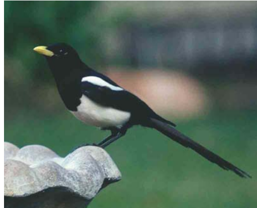
97 Yellow-billed Magpie / Geelsnavelekster Pica nuttalli , Nojoqui Park, California, USA, 12 March 1982

derers have been recorded in most eastern states of North America and vagrants have reached the Atlantic coast of all eastern states from Newfoundland, Canada, south to North Carolina, USA (cf Sibley 2000). Magpies are reluctant to cross large stretches of water (cf Cramp & Perrins 1994) and the chances for a Black-billed Magpie to cross the Atlantic Ocean to Europe must be considered zero. However, the possibility of ship-assisted vagrancy to Europe should perhaps not be entirely ruled out and this would lead to a serious identification challenge. The same would be true for the hypothetical (ship-assisted) Eurasian Magpie turning up on the Atlantic coast of North America.