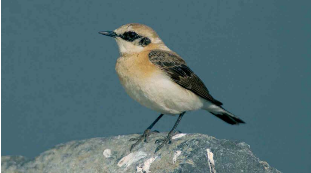
77 Eastern Black-eared Wheatear / Oostelijke Blonde Tapuit Oenanthe melanoleuca , immature male, Lesvos, Greece, April 2002 (René Pop). Typical bird with obvious 'immature impression' produced by black coverts with slight brownish tinge (and with obvious pale fringes) and grey-brown touch to crown, nape and lower mantle. 'Immature impression' in itself is a character for melanoleuca . Extensive fringes to black on lores and ear-coverts as well as blackish greater coverts in contrast with brownish primary coverts and remiges are all signs of immaturity. 78 Eastern Black-eared Wheatear / Oostelijke Blonde Tapuit Oenanthe melanoleuca , immature male, Eilat, Israel, March 1990 (René Pop). New blackish coverts in contrast with brownish remiges and primary coverts indicate immature bird. Typical melanoleuca with obvious 'immature impression' produced by the fact that the coverts are not the jet-black coverts immature Western Black-eared Wheatear O. hispanica usually displays. The rather dull buffish-brown crown, nape and mantle are more reminiscent of a female than of an adult male and are incompatible with a spring male hispanica . Restricted black in the region of the upper eye, lores and forehead is more typical for hispanica , but is regularly found in immature melanoleuca . However, the black ear-coverts patch is too 'deep' for hispanica . The non-black scapulars may suggest a female, but the face-mask is too black to support that suspicion, while the somewhat diffuse borders and pale fringing emphasize that this male is an immature.