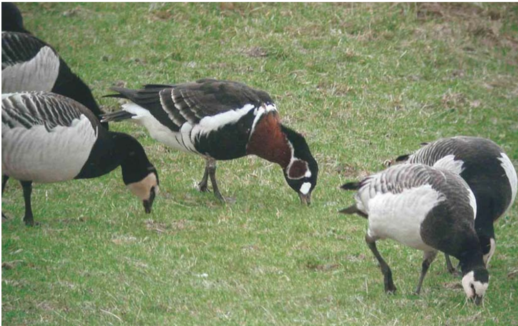
132 Roodhalsgans / Red-breasted Goose Branta ruficollis , eerstejaars, met Brandganzen / Barnacle Geese B leucopsis , Korendijkse Slikken, Zuid-Holland, 5 januari 2003 (Koen Verbanck)