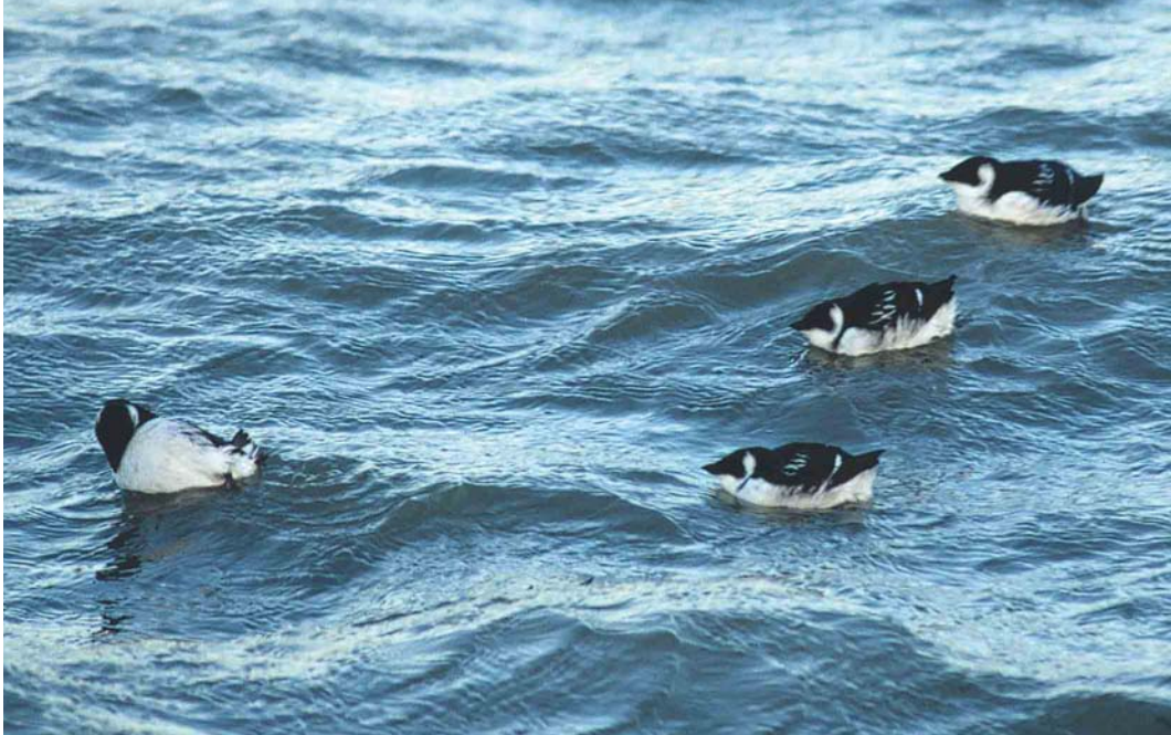
143 Kleine Alken / Little Auks Alle alle , Scheveningen, Zuid-Holland, 5 februari 2003 ( Vincent van der Spek )