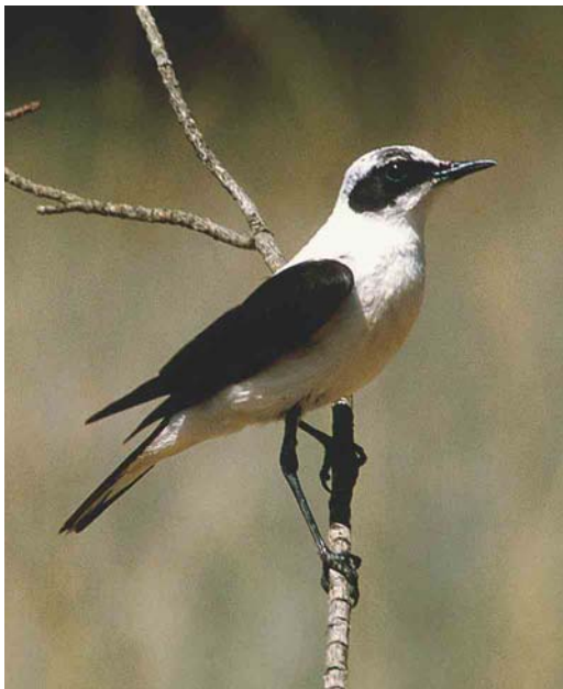
68 Western Black-eared Wheatear / Westelijke Blonde Tapuit Oenanthe hispanica , adult male, Valladolid, Spain, July 1999 ( Alejandro Torés Sánchez ). A very white hispanica , although this is partly due to the late date (early July). It certainly recalls a melanoleuca with a rather 'deep' ear-coverts patch and greyish crown and nape contrasting with the white mantle. Note, however, the untypical distribution of grey – which in melanoleuca normally is concentrated to the centre of the crown and nape, leaving a broad, white 'supercilium'. Small amount of black on lores and particularly forehead confirms that this is a hispanica . 69 Western Black-eared Wheatear / Westelijke Blonde Tapuit Oenanthe hispanica , immature male, Spain, May 1988 ( Luis Gustamante ). Fresh black wing-coverts in contrast with worn, brownish remiges show this bird to be a second-year male. Restricted amount of black above bill and lores typical for hispanica but not impossible for immature melanoleuca . However, throat-bib very small (nearly 'half-bib' type) and uniform pale ochre upperparts typical for male hispanica (of any age) but not good for immature melanoleuca . Also note that the new coverts are jet black, typical for hispanica .