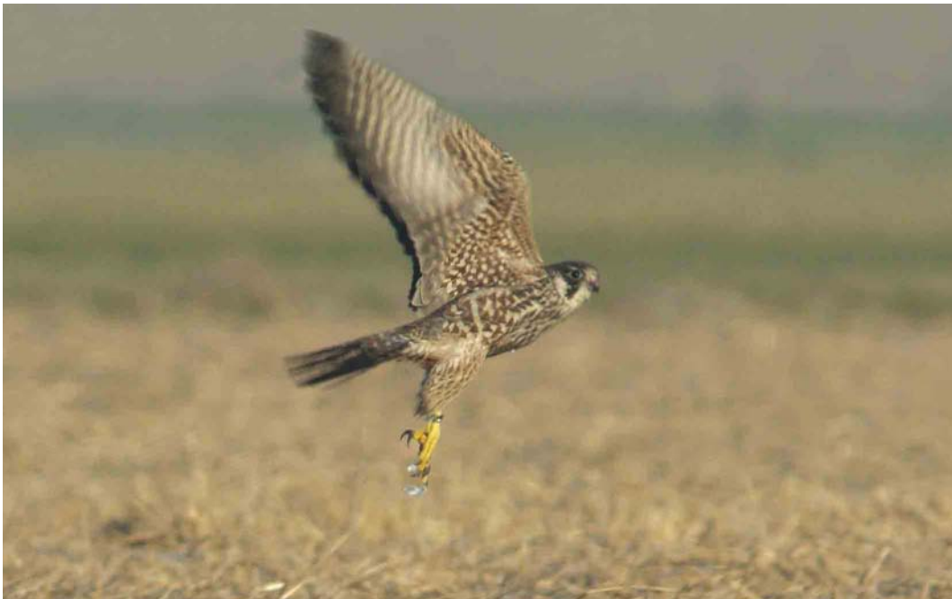
144 Slechtvalk / Peregrine Falcon Falco peregrinus , Julianadorp, Noord-Holland, 18 februari 2003