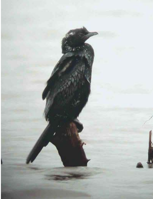
154 Dwergaalscholver / Pygmy Cormorant Microcarbo pygmeus , adult, Eijsder Beemden, Limburg, maart 2003 (Jeroen van der Zwan)