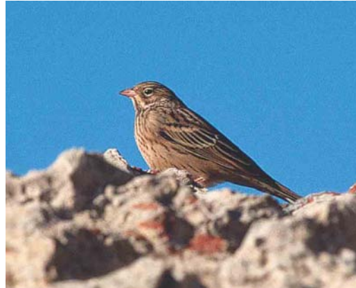
Mystery photograph IV (August)