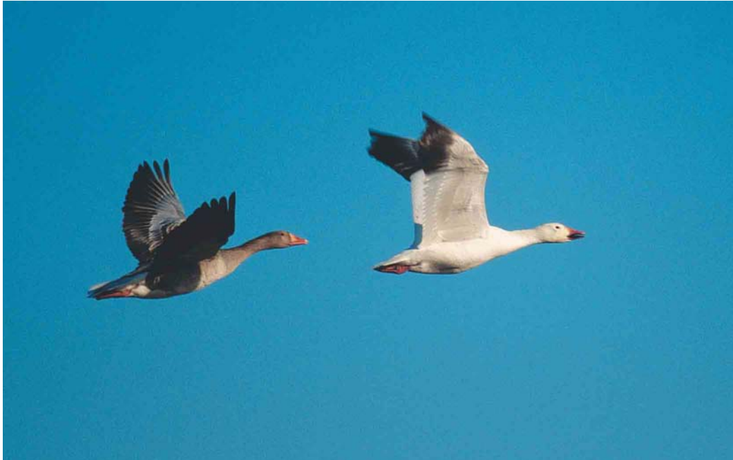
129 Sneeuwgans / Snow Goose Anser caerulescens , met Grauwe Gans / Greylag Goose A anser , Stellendam, Zuid-Holland, 25 februari 2003 (Marten van Dijk)