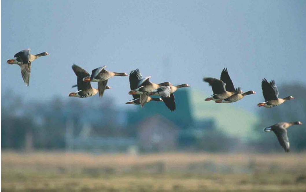
131 Dwergganzen / Lesser White-fronted Geese Anser erythropus , Oude Land van Strijen, Zuid-Holland, 6 februari 2003