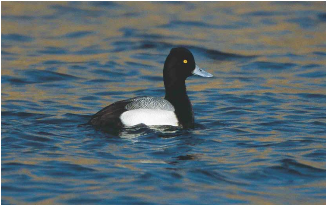
136 Kleine Topper / Lesser Scaup Aythya affinis , adult mannetje, Scheelhoek, Zuid-Holland, 21 februari 2003 (Jan van Holten)