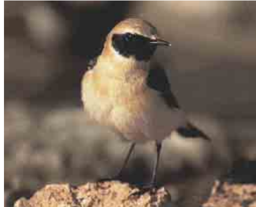
66 Western Black-eared Wheatear / Westelijke Blonde Tapuit Oenanthe hispanica , adult male, Spain, April 1988 ( Ola Bondesson ). Typical male with uniform, warm upperparts, small amount of black above bill and small throat-bib. 67 Western Black-eared Wheatear / Westelijke Blonde Tapuit Oenanthe hispanica , immature male, Spain, April 2001 ( Vicente Moreno ). Deep ochre/orange crown and nape (and apparently uniform with what is glimpsed of the mantle) typical for male hispanica and suggesting an adult bird. However, pale fringes to the coverts as well as over much of the centre of the throat-bib reveal that it is an immature bird. Small amount of black on lores/forehead typical for hispanica but not impossible for immature melanoleuca . Note, however, throat-bib which is too small for melanoleuca , and a diffuse whitish/pale ochre zone between the breast and the black throat, more consistent with hispanica .