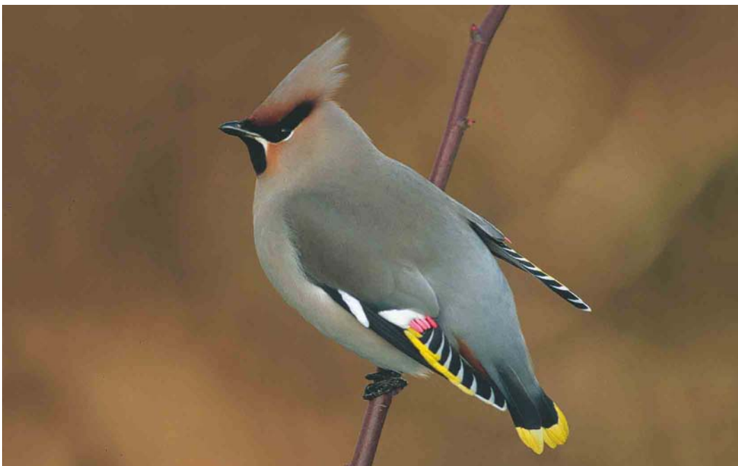
146 Pestvogel / Bohemian Waxwing Bombycilla garrulus , Noordwijk, Zuid-Holland, 10 januari 2003 (René van Rossum)