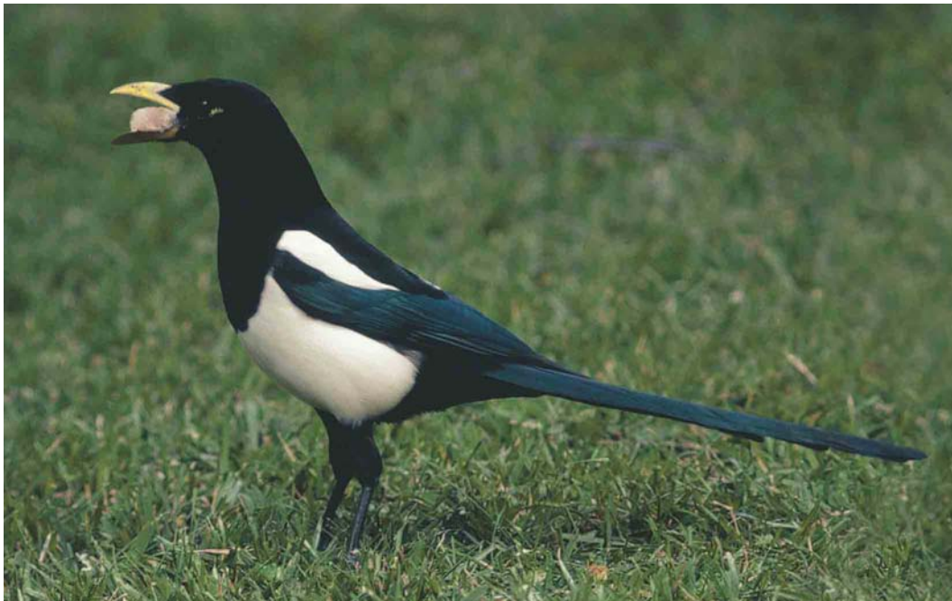
98 Yellow-billed Magpie / Geelsnavelekster Pica nuttalli , Nojoqui Park, California, USA, 12 March 1982

The close affinities of hudsonia and nuttalli are illustrated by the fact that southern hudsonia are, on average, smaller and smaller billed than northern birds and tend to show a small patch of bare skin around the eye, thus approaching nuttalli in appearance (cf Sibley 2000). This patch of bare skin is also present in juvenile birds in the Old World and is prominent in adult mauritanica from north-western Africa and, to a lesser extent, in adult melanotos of Iberia (see below). This may well indicate that this patch of bare skin is a vestigial character that was once present in all Pica ancestors but is now retained in adult plumage by just a few taxa.