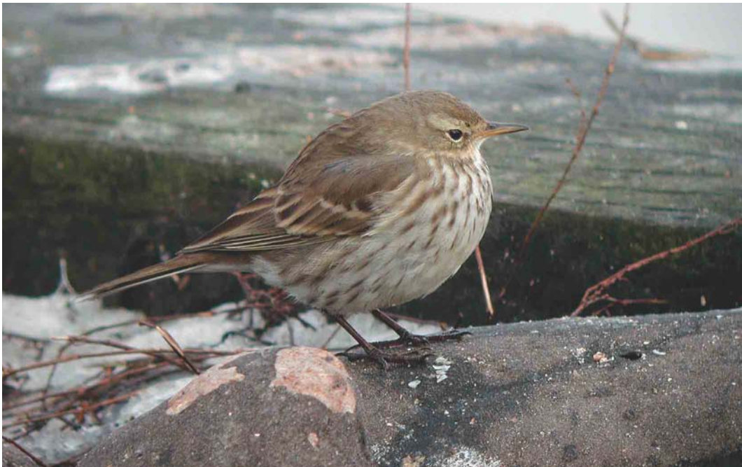
128 Water Pipit / Waterpieper Anthus spinoletta , Hals, Nordjylland, Denmark, 3 February 2003 (Ohle Krogh)