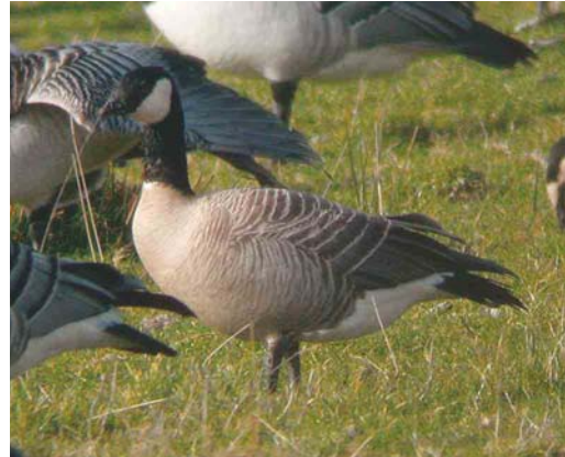
119 Yellow-billed Loon / Geelsnavelduiker Gavia adamsii , juvenile, Augsburg, Bayern, Germany, February 2003 (Markus Roemhild) 120 Green-winged Teal / Amerikaanse Wintertaling Anas carolinensis , male, Aiguamolls de l'Empordá, Girona, Spain, 12 January 2003 (Rafael Armada) 121 Canvasback / Grote Tafeleend Aythya valisineria , adult male, Castricum, Noord-Holland, Netherlands, 11 January 2003 (Bas van den Boogaard) 122 Hutchins's Canada Goose / Hutchins' Canadese Gans Branta hutchinsii hutchinsii , Lissadell, Sligo, Ireland, 24 February 2003 (Chris Batty)

up in Aisne on 5 March and one in Somme on 9 March. On 28 February, 11 Great Knots Calidris tenuirostris were seen at Khor al-Beidah, UAE. The long-staying Long-billed Dowitcher Limnodromus scolopaceus at Sohar, Oman, was still present on 21 February (first noted in 1997; cf Dutch Birding 23: 158, plate 177, 161, 2001, 25: 57-58, plate 33, 2003). The one in Cheshire, England, was still seen in early February. Other long-stayers at Inver Bay, Highland, Scotland, from 8 November 2002 and at Clonakilty, Cork, Ireland, from 30 November 2002 were still present in March (although the latter was lost for many weeks). The second Spotted Sandpiper Actitis macularia for Italy at Saline di Augusta, Siracusa, Sicily, from 9 December 2002 was still present in late February. A Red Phalarope Phalaropus fulicarius on Lac Léman near Lausanne, Valais, from December 2002 to at least