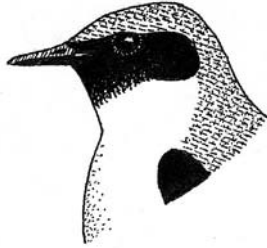
FIGURE 3 Adult 'half-bib' spring male Western Black-eared Wheatear / Westelijke Blonde Tapuit Oenanthe hispanica (Magnus Ullman). While most black-throated male hispanica have slightly smaller throat-bib than Eastern Black-eared Wheatear O melanoleuca , a minority has noticeably restricted throat-bib, so small that the silhouette of the black ear-coverts becomes clearly visible (the 'rear-end-shape' of the ear-coverts tends to be suggested in many normal hispanica as well). In most 'half-bib' males, the lower border of the bib is diffusely marked.

above the culmen, while in others the area of contact is 1 mm, occasionally more (see figure 4). Although the difference is normally obvious on birds which are seen well, there may be problematic individuals. Thus, this is a good character in most birds, while some birds seem intermediate.