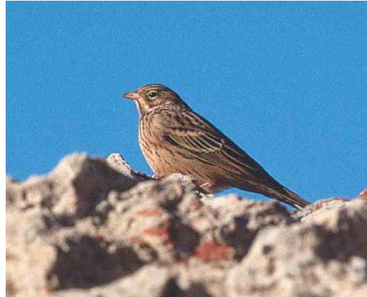
Mystery photograph IV (August)