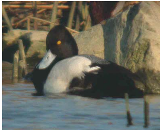
138 Witbuijkrotganzen / Pale-bellied Brent Geese Branta hrota, Camperduin, Noord-Holland, 24 februari 2003 139 Groenlandse Kolgans / Greenland White-fronted Goose Anser albifrons flavirostris, Slochteren, Groningen, 9 februari 2003 140 Zwarte Rotgans / Black Brant Branta nigricans, adult, Grevenbicht, Limburg, 24 november 2002 cf Dutch Birding 25: 64, 71, 2003. 141 Witooggeend / Ferruginous Duck Aythya nyroca, mannetje, Schipbeek, Diepenheim, Overijssel, 17 februari 2003 142 Kleine Topper / Lesser Scaup Aythya affinis, adult mannetje, Scheelhoek, Zuid-Holland, 19 februari 2003