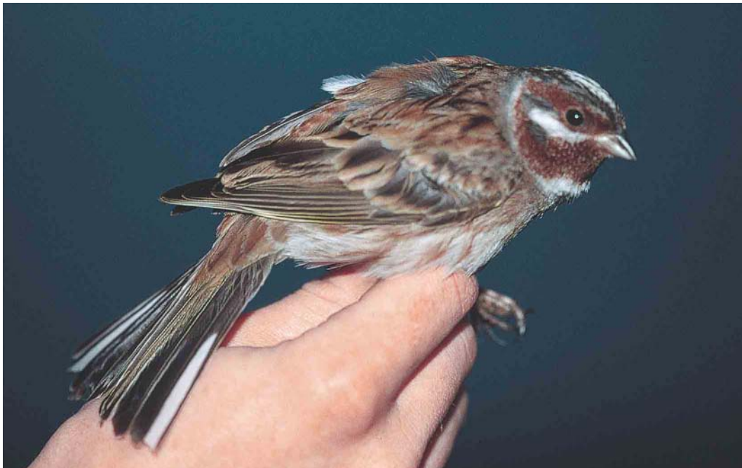
20 Hybrid Pine Bunting x Yellowhammer / Witkopgors x Geelgors Emberiza leucocephalos x citrinella, Fereydoon Kenar, Mazandaran province, Iran, 27 February 2001