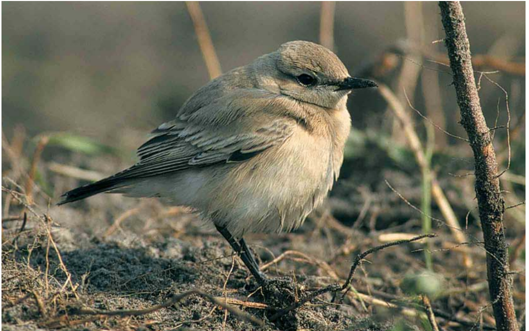
6 Izabeltapuit / Isabelline Wheatear Oenanthe isabellina , eerstejaars, Schiermonnikoog, Friesland, 16 oktober 2000

waarschuwen. Omdat het niet zo druk was met de vangsten ging AvL meteen kijken met één van de helpers, die gelukkig een telescoop bij zich had. Het licht was die middag vrij matig en de vogel kwam soms niet zo bleek over. Ook was er toen (vrijwel) geen wenkbrauwstreep te zien. Het duurde daarom even voordat de vogel de juiste kenmerken voor een Izabeltapuit liet zien, zoals de brede zwarte staartband en de lichte ondervleugel. Uiteindelijk groeide de overtuiging dat het allemaal klopte en werd de waarneming door MvdA via het semafoonsysteem bekendgemaakt.