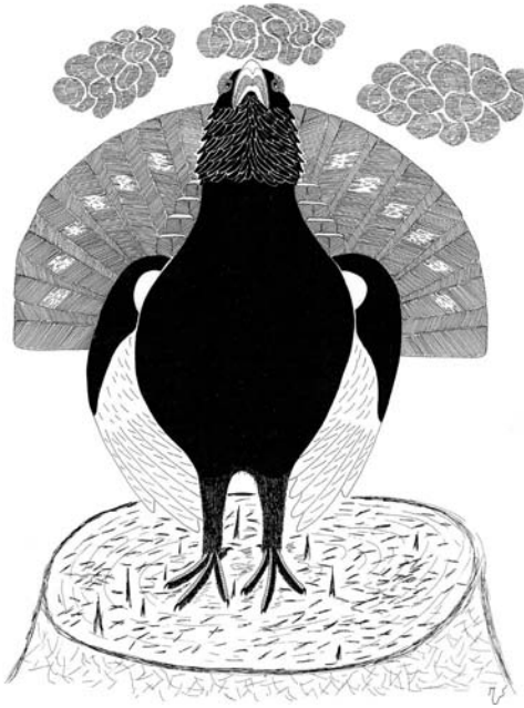
FIGURE 8 Western Capercaillie / Auerhoen Tetrao urogallus . Male during wide-necked postures against intruders in territory (Miroslav Saniga)

Towards the height of the season, and in response to certain stimuli (presence of females, activity of nearby males, weather conditions), after the initial pre-dawn period of arboreal singing, each male descends or flies into the display territory to continue Song-display on the ground. This usually occurs around the onset of the civil twilight (sun lower than 6^\circ below horizon) (Saniga 1998). Before performance on the ground, some males fly noisily from tree to tree,