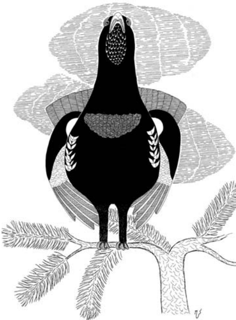
FIGURE 4 Western Capercaillie / Auerhoen Tetrao urogallus . Male during performance of Cork-pop note of song (Miroslav Saniga)