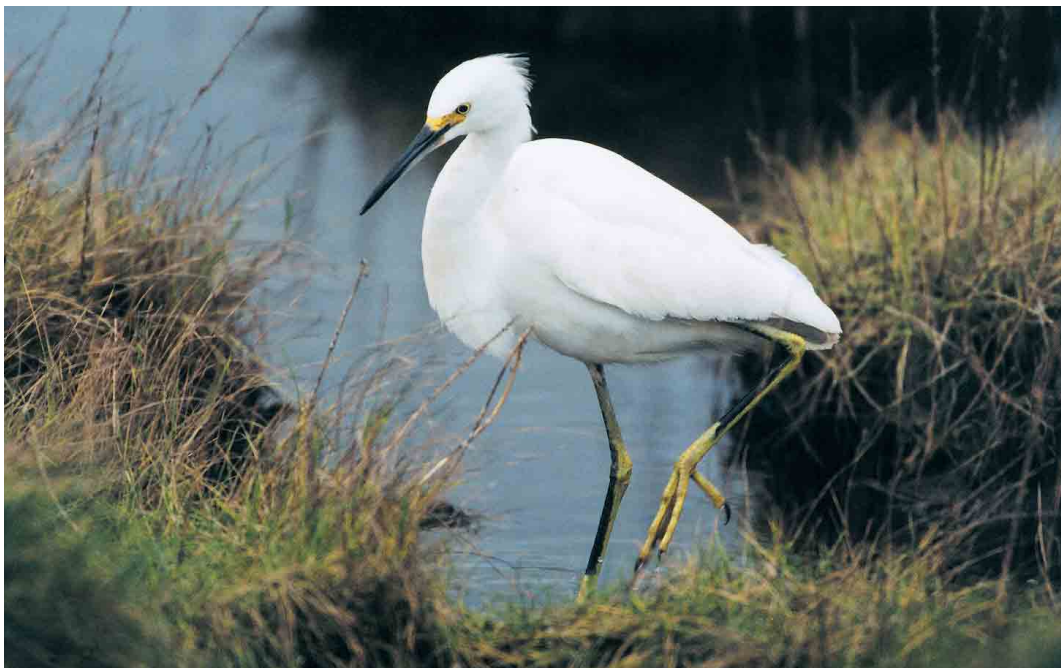
22 Snowy Egret / Amerikaanse Zilverreiger Egretta thula , juvenile, Balvicar, Seil Island, Argyll, Scotland, November 2001 (Iain H Leach)