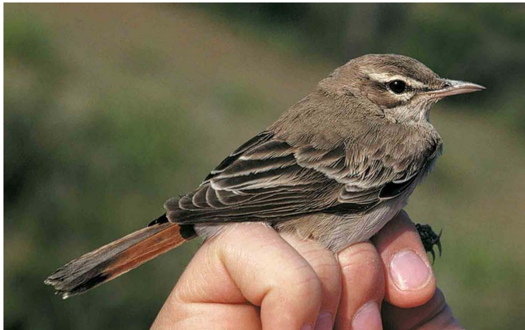
17 Eastern Rufous-tailed Scrub Robin / Oostelijke Rosse Waaiersstaart Cercotrichas galactotes syriacus , Omer Gölu, Yumurtalik, Turkey, 25 April 1987 (Arnaud B van den Berg). Note drab grey-brown coloration of upperparts, contrasting strongly with rufous tail, typical of eastern subspecies group

Within the Western Palearctic, four subspecies of Rufous-tailed Scrub Robin are recognized and these are usually divided into a western and an eastern subspecies group. The western group (Western Rufous-tailed Scrub Robin) consists of the nominate C g galactotes (breeding in southwestern Europe, northern Africa, Sinai, Israel, Jordan and southern Syria) and C g minor (southern Sahara). The eastern group (Eastern Rufous-tailed Scrub Robin) includes C g syriacus (breeding in south-eastern Europe, Turkey and the Levant south to Lebanon) which intergrades into