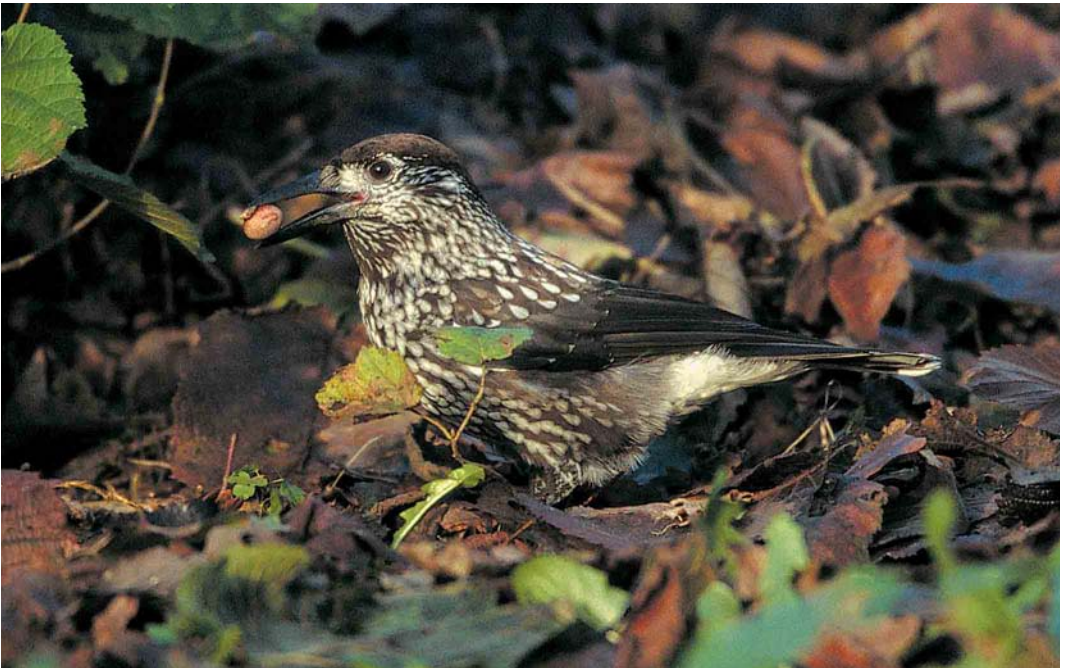
54 Notenkraaker / Spotted Nutcracker Nucifraga caryocatactes , Zeewolde, Flevoland, 10 december 2001 (Jan van Holten)