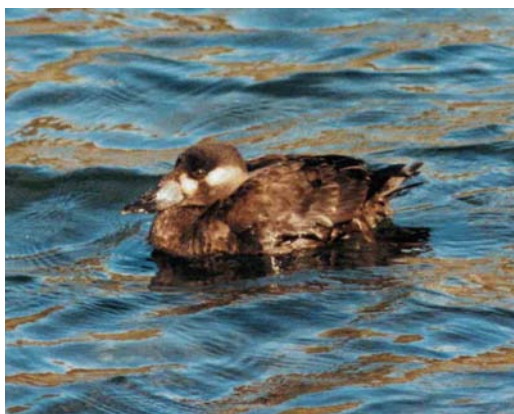
23 Red-wattled Lapwing / Indische Kievit Vanellus indicus , K19, Eilat, Israel, November 2001 ( Killian Mullarney ) 24 Great Cormorants / Aalscholvers Phalacrocorax carbo , Lagoa das Furnas, São Miguel, Azores, 2 November 2001 ( Kris De Rouck ) 25 Killdeer / Killdeerplevier Charadrius vociferus , Sete Cidades, São Miguel, Azores, 10 November 2001 ( Theo Bakker/Cursorius ) 26 Snowy Egret / Amerikaanse Zilverreiger Egretta thula , Porto Pim beach, Faial, Azores, 18 November 2001 ( Mark Bolton ) 27 American Coot / Amerikaanse Meerkoet Fulica americana , Lagoa Combes, Flores, Azores, 7 November 2001 ( Theo Bakker/Cursorius ) 28 Surf Scoter / Brilzee-eend Melanitta perspicillata , female, Porto Pim beach, Faial, Azores, 19 November 2001 ( Mark Bolton )