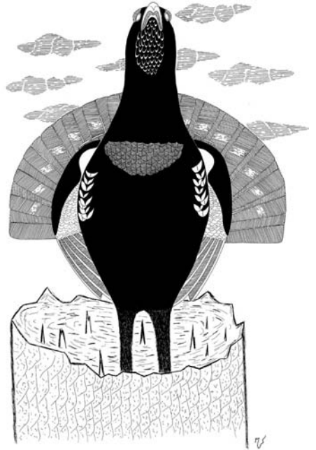
FIGURE 6 Western Capercaillie / Auerhoen Tetrao urogallus . Male during performance of Whetting phase of song (frontal view)