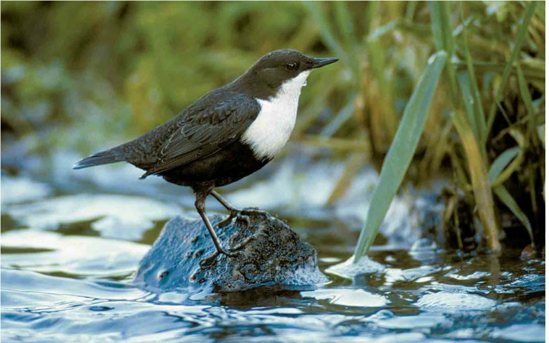
53 Zwartbuikwaterspreeuw / Black-bellied Dipper Cinclus cinclus cinclus , Amsterdamse Waterleidingduinen, Noord-Holland, 27 november 2001 (Marten van Dijl)