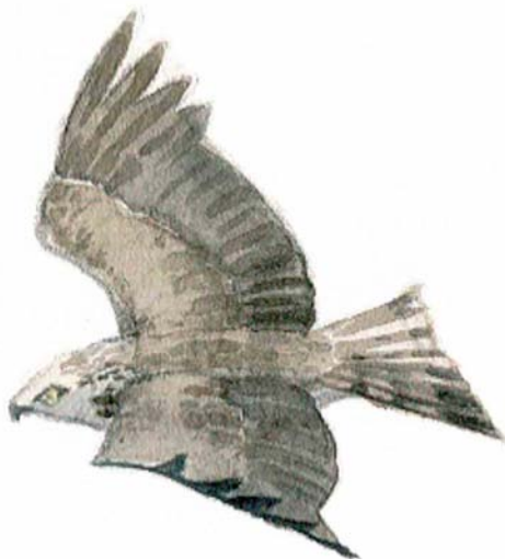
FIGURE 1 Short-toed Eagle / Slangenarend Circetus gallicus, Fochtelooërveen, Drenthe/Friesland, June 2001