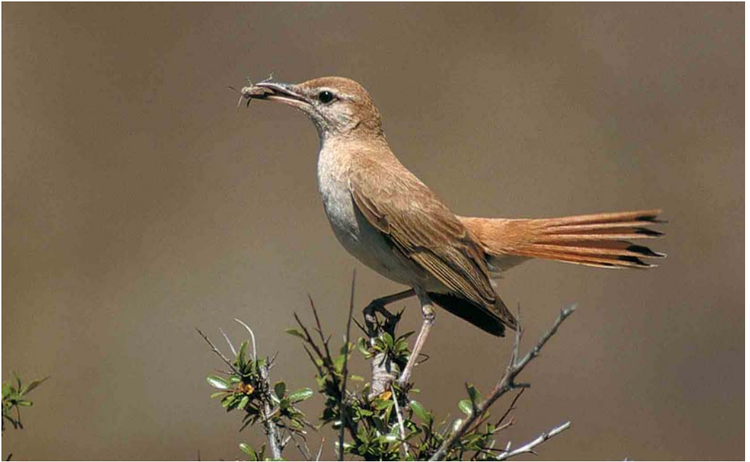
20 Western Rufous-tailed Scrub Robin / Westelijke Rosse Waaierstaart Cercotrichas galactotes galactotes , Fortes, Algarve, Portugal, 1 August 1999. Worn bird, more similar to eastern subspecies group due to rather pale and less rufous-tinged upperparts and whitish underparts. Note, however, lack of darker central tail-feathers