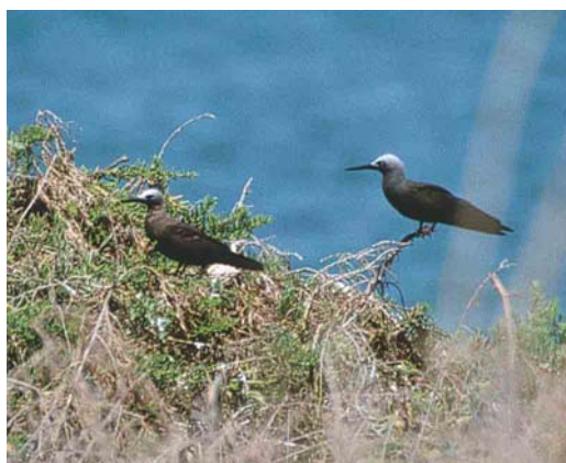
330 Presumed Greater Frigatebird / vermoedelijke Grote Fregatvogel Fregata minor , female, Jinawt, Oman, 22 September 2002 ( Harvey van Diek ) 331 Eleonora's Falcon / Eleonora's Valk Falco eleonora , Bica da Cana, Madeira, Portugal, 18 August 2001 ( Kris De Rouck ) cf Dutch Birding 24: 309, 2002 332 Allen's Gallinule / Afrikaans Purperhoen Porphyryla alleni , adult, Salalah, Oman, 24 September 2002 ( Harvey van Diek ) 333 Lesser Noddies / Kleine Noddies Anous tenuirostris , off Masirah, Oman, 18 September 2002 ( Harvey van Diek )

concerned juveniles on Utsira, Rogaland, Norway, on 4 September, at Brow Marsh, Shetland, Scotland, on 10-13 September, and on Ouessant on 9-17 October. The third Montagu's Harrier C pygargus for Iceland was a juvenile female trapped at Eskifjörður on 28 September. At the Bosporus, Turkey, 194 Levant Sparrowhawks Accipiter brevipes were counted on 19-21 September. If accepted, a Steppe Buzzard Buteo buteo vulpinus at Føyndland, Vestfold, on 19 September will be the eighth for Norway. Apparently, one or two Long-legged Buzzards B rufinus remained in the Camargue and the Crau, Bouches-du-Rhône, France, from 4 October. In Germany, an immature was present at Gut Seligenstadt, Kitzingen, Bavaria, from 5 September to 10 October. In Poland, one was seen at Myscowa on 8 September. A record 106 000 Lesser Spotted Eagles Aquila pomarina were counted this