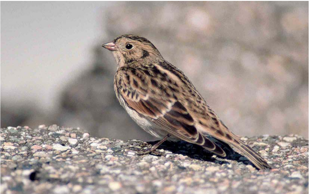
360 Ijsgors / Lapland Longspur Calcarius lapponicus , Maasvlakte, Zuid-Holland, 30 september 2002 (Marten van Dijl)