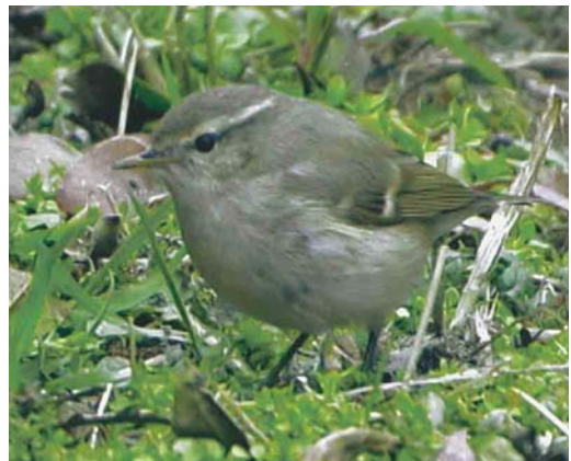
305 Greenish Warbler / Grauwe Fitis Phylloscopus trochiloides , Lauwersoog, Groningen, 23 September 2001 306 Iberian Chiffchaff / Iberische Tjiftjaf Phylloscopus brehmii , Belfeld, Limburg, 8 June 2001 307 Arctic Warbler / Noordse Boszanger Phylloscopus borealis , Petten, Noord-Holland, 30 September 2001 308 Arctic Warbler / Noordse Boszanger Phylloscopus borealis , first-winter, Kroonspolders, Vlieland, Friesland, 20 September 2001 309 Red-eyed Vireo / Roodoogvireo Vireo olivaceus , Schiermonnikoog, Friesland, 13 October 2001 310 Hume's Leaf Warbler / Humes Bladkoning Phylloscopus humei , Egmond aan Zee, Noord-Holland, March 2001