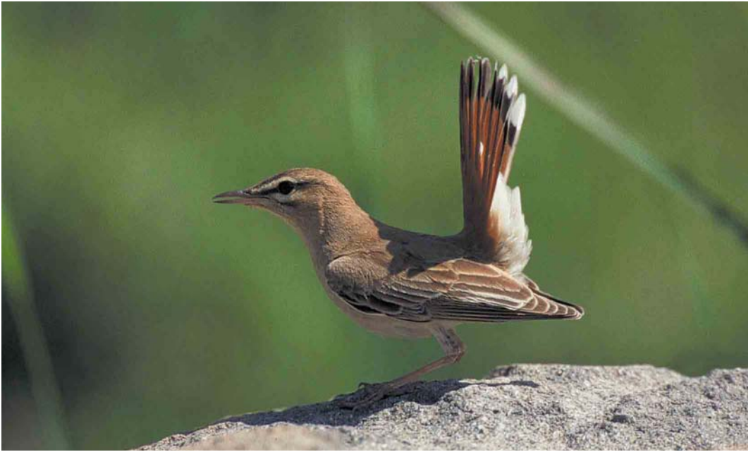
15 Eastern Rufous-tailed Scrub Robin / Oostelijke Rosse Waaiertaart Cercotrichas galactotes syriacus , Lesbos, Greece, April 1996. Note grey-brown upperpart coloration, but not as pale and greyish as birds of more eastern part of range of eastern subspecies group ( C g familiaris ) 16 Western Rufous-tailed Scrub Robin / Westelijke Rosse Waaiertaart Cercotrichas galactotes galactotes , Algarve, Portugal, 9 June 1998. Typical rufous-brown upperparts contrasting slightly with bright rufous tail. Also note tail pattern without darker central tail-feathers