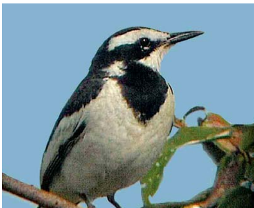
57 Mekong Wagtail / Mekongkwikstaart Motacilla samveasnae , male, Stung Treng Province, Cambodia, February 2001