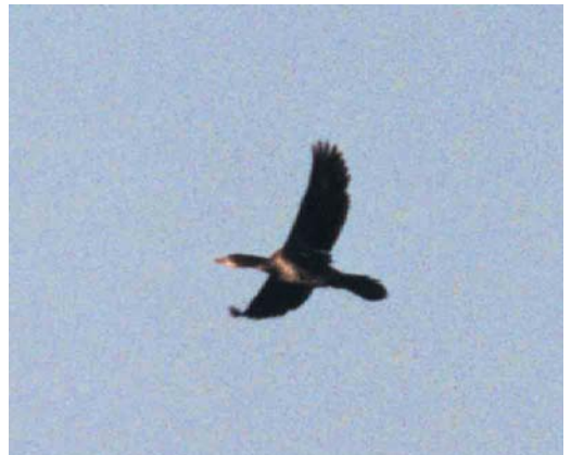
1-2 Pygmy Cormorant / Dwergaalscholver Microcarbo pygmeus , Warneton, Hainaut, 30 December 2000 3-4 Pygmy Cormorant / Dwergaalscholver Microcarbo pygmeus , Warneton, Hainaut, 28 December 2000

on outer web than on inner web. Secondaries brownish. Upperwing-coverts and underwing-coverts more blackish and darker than flight-feathers.