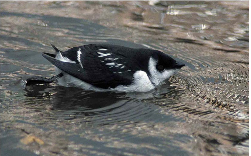
46 Kleine Alk / Little Auk Alle alle , Delft, Zuid-Holland, 8 november 2001 (Chris van Rijswijk)