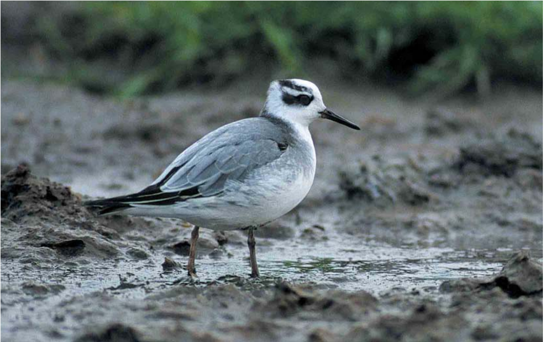
45 Rosse Franjepoot / Red Phalarope Phalaropus fulicaria , Zwaagwesteinde, Friesland, 10 november 2001