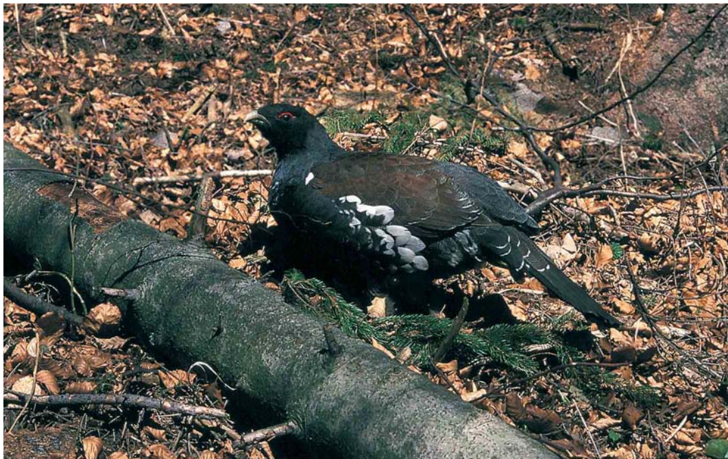
9 Western Capercaillie / Auerhoen Tetrao urogallus , male after morning display on the ground, Vel'ká Fatra mountains, Slovakia, 20 April 1996 (Miroslav Saniga)