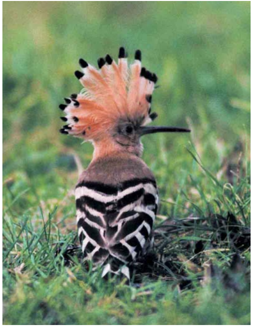
50 Pestvogel / Bohemian Waxwing Bombycilla garrulus , Julianadorp, Noord-Holland, 9 november 2001 51 Hop / Eurasian Hoopoe Upupa epops , Zwarte Haan, Friesland, 19 december 2001 52 Hop / Eurasian Hoopoe Upupa epops , Zwarte Haan, Friesland, 3 januari 2002