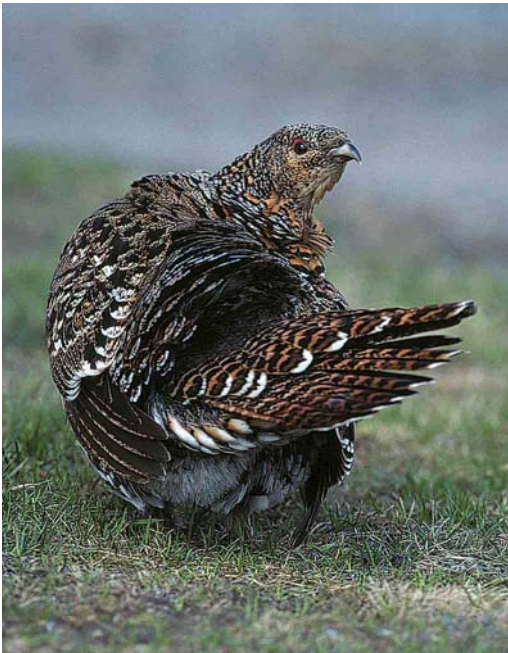
12 Western Capercaillie / Auerhoen Tetrao urogallus , female, Turo, Finland, April 1999

When the first females appear on the display ground, either in groups or solitary, the behaviour of the adjacent males changes to a directed display. The posture in this situation differs very little from a perfect Thin-necked Upright posture. The primaries of both wings, however, are spread and their tips touch the ground. The tail is almost completely fanned and cocked, and is usually tilted and turned towards the female (figure 7). Females on the ground are encircled by the male