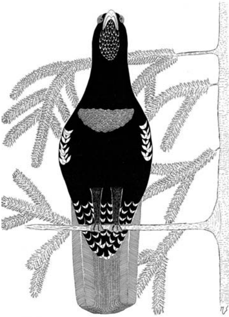
FIGURE 1 Western Capercaillie / Auerhoen Tetrao urogallus . Male displaying in strong wind and heavy rain with tail in resting position (Miroslav Saniga)