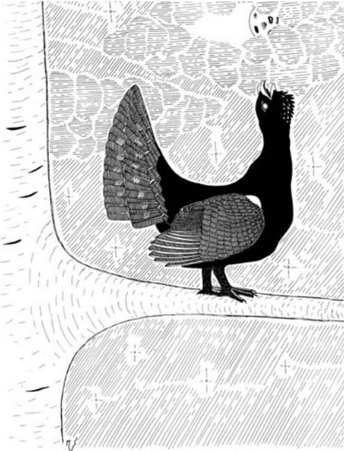
FIGURE 5 Western Capercaillie / Auerhoen Tetrao urogallus . Male during performance of Whetting phase of song (lateral view)