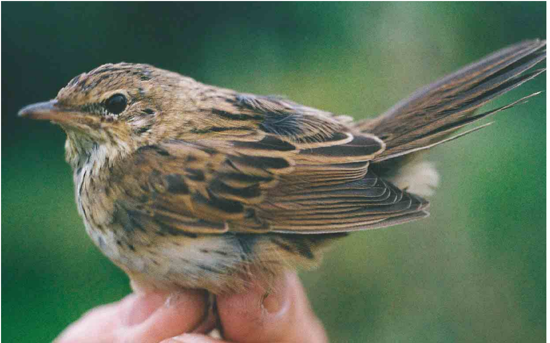
374 Kleine Sprinkhaanzanger / Lanceolated Warbler Locustella lanceolata , Amsterdamse Waterleidingduinen, Zandvoort, Noord-Holland, 20 september 2002 375 Siberische Sprinkhaanzanger / Pallas's Grasshopper Warbler Locustella certhiola , Castricum, Noord-Holland, 21 september 2002 376 Siberische Sprinkhaanzanger / Pallas's Grasshopper Warbler Locustella certhiola , Castricum, Noord-Holland, 27 september 2002