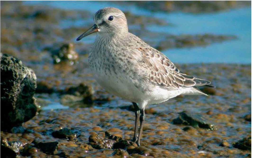
328 White-rumped Sandpiper / Bonapartes Strandloper Calidris fuscicollis , juvenile, Cabo da Praia, Terceira, Azores, 15 October 2002