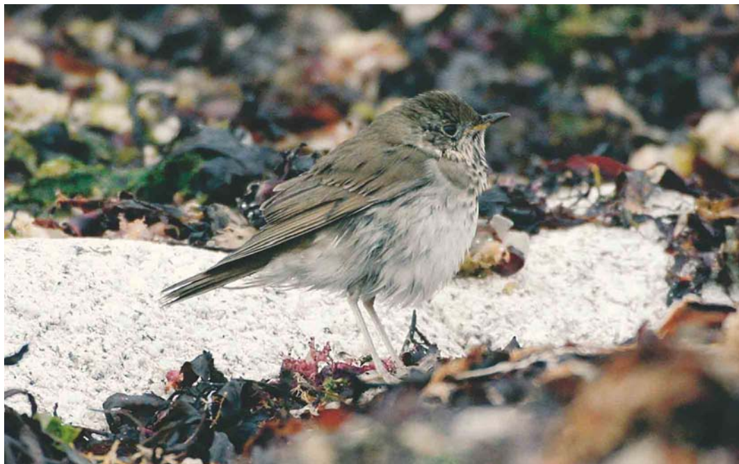
342 Grey-cheeked Thrush / Grijswangdwerglijster Catharus minimus , St Agnes, Scilly, England, 30 October 2002 (Chris Batty)