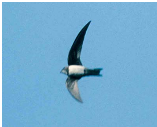
377 Alpengierzwaluw / Alpine Swift Apus melba, Wageningen, Gelderland, 12 november 2002