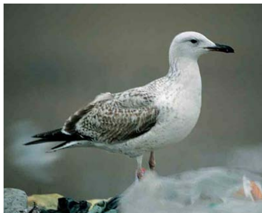
315 Pontic Gull / Pontische Meeuw Larus cachinnans cachinnans , adult, Konin, central Poland, January 2002 (Marcin Faber) 316 Pontic Gull / Pontische Meeuw Larus cachinnans cachinnans , adult, Konin, central Poland, December 2001 (Marcin Faber) 317 Pontic Gull / Pontische Meeuw Larus cachinnans cachinnans , adult, Konin, central Poland, January 2002 (Marcin Faber) 318 Pontic Gull / Pontische Meeuw Larus cachinnans cachinnans , first-winter, Toruń, Poland, February/March 2001 (Grzegorz Neubauer)

Herring and 28% in Pontic Gulls. Birds in older immature plumages (second-winter and third-winter) of both species were rarer (figure 2).