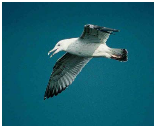
319 Herring Gull / Zilvermeeuw Larus argentatus , first-winter, Konin, central Poland, December 2001 ( Marcin Faber ) 320 Pontic Gull / Pontische Meeuw Larus cachinnans cachinnans , first-winter, Poznań, Poland, February 2001 ( Grzegorz Neubauer ). This bird was ringed in May 2000 as a pullus on the Dnjepr river, central Ukraine (see table 2) 321 Pontic Gull / Pontische Meeuw Larus cachinnans cachinnans , first-winter, Toruń, Poland, February 2001 ( Grzegorz Neubauer ). This bird (different from that in plate 320) was ringed in the same place and on the same day (see table 2) 322 Pontic Gull / Pontische Meeuw Larus cachinnans cachinnans , second-winter, Jeziorsko Reservoir, central Poland, December 2001 ( Marcin Faber )