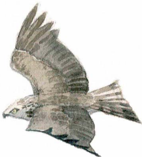
FIGURE 1 Short-toed Eagle / Slangenarend Circaetus gallicus, Fochteloöerveen, Drenthe/Friesland, June 2001