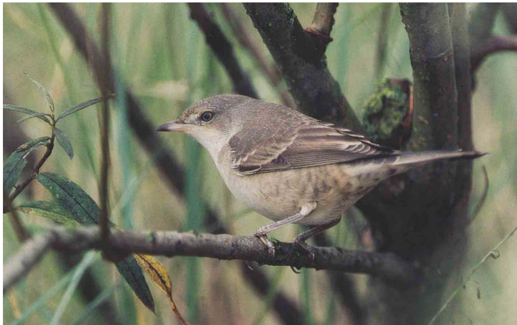
373 Sperwergrasmus / Barred Warbler Sylvia nisoria , eerstejaars, Heist, West-Vlaanderen, 8 september 2002 (Kris De Rouck)

Leefdaal, Vlaams-Brabant, op 1 oktober; over Gent op 5 en 8 oktober; en bij Sint-Kruis-Winkel, Oost-Vlaanderen, op 12 oktober. Op 14 en 29 september werd er telkens één Roodsterblauwborst Luscinia svecica svecica geringd te Kinrooi. De weinige Beflijsters Turdus torquatus werden waargenomen te Harelbeke op 6 oktober en te Zeebrugge (twee) op 8 oktober. Opmerkelijk was de explosieve toename van Cetti's Zangers Cettia cetti aan de Belgische westkust; tijdens deze periode werden er alleen al in Koksijde, West-Vlaanderen, 13 geringd. Vanaf 11 oktober zong er één bij Lissewege, West-Vlaanderen, en ook verbleven exemplaren te Heist op 12 en 16 oktober en in de Achterhaven van Zeebrugge vanaf 12 oktober. Maximaal werden in de Zeebrugse haven op 28 september nog 16 Graszangers Cisticola juncidis geteld. In Het Zwin te Knokke waren er maximaal twee aanwezig van 21 tot 28 september. Een eerste-winter Waterrietzanger Acrocephalus paludicola werd op 12 september geringd te Kalmthout. Een vrij laat exemplaar liet zich op 1 oktober in het veld bekijken te Tienen. Verrassend was de aanwezigheid van een zingend mannetje Westelijke Baardgrasmus Sylvia cantillans cantillans te Heist op 15 september. Op 1 september werden twee Sperwergrasmussen S nisoria geringd bij Koksijde. Op 4 september was er een vangst te Kinrooi. Tussen 4 en 10 september lieten maximaal drie exemplaren zich zeer goed observeren en fotograferen in de Baai van