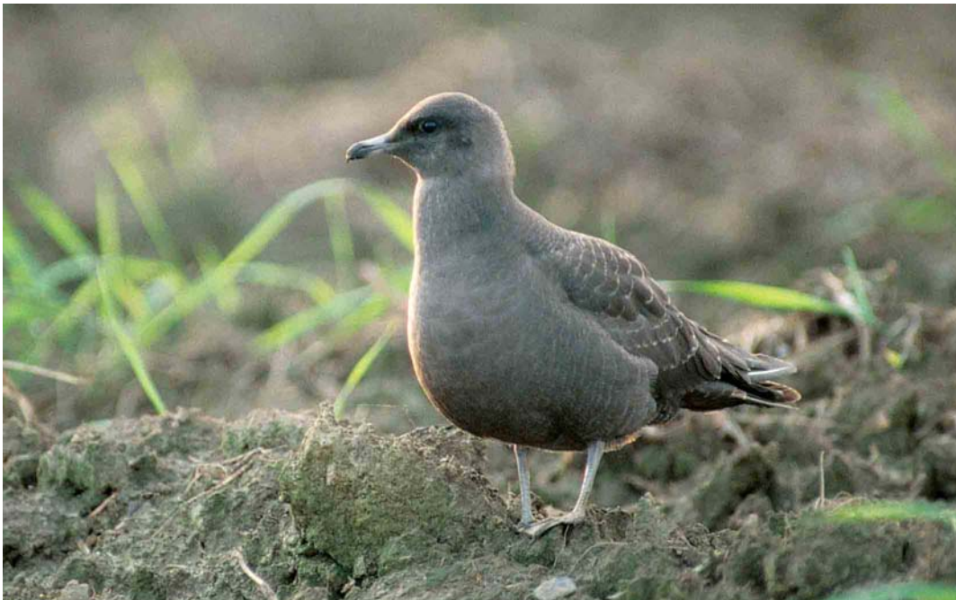
372 Kleinste Jager / Long-tailed Jaeger Stercorarius longicaudus , juveniel, Aische-en-Refail, Namur, 1 september 2002 (Antoine Joris)

Vlaanderen; Wintam (Bornem); en Zeebrugge (drie). De enige Morinelplevier Charadrius morinellus voor het najaar werd op 2 september opgemerkt bij Boneffe, Namur. De adulte Steppekievit Vanellus gregarius die in augustus te Willebroek verbleef, werd op 28 september herontdekt op het Noordelijk Eiland te Wintam (Bornem). De vogel was nu volledig in winterkleed en bleef tot 30 september. Temmincks Strandlopers Calidris temminckii verbleven te Gent, te Knokke en bij Veurne. Tot 4 september pleisterde de juveniele Gestreepte Strandloper C melanotos nog bij Veurne. Een andere verbleef op 26 september bij Genappe, Brabant-Wallon. De tweede Grote Griuze Snip Limnodromus scolopaceus voor België liet zich van 23 tot 25 september moeizaam vinden in de Achterhaven van Zeebrugge. Op 6 oktober vloog een Rosse Franjepoot Phalaropus fulicaria langs Raversijde, West-Vlaanderen. Vanaf 31 oktober pleisterde een eerste-winter te Blankenberge. Een binnenlandwaarneming van een Kleine Jager Stercorarius parasiticus vond plaats op 11 september in Willebroek. Ook verzeilden tijdens de eerste dagen van september enkele juveniele Kleinste Jagers S longicaudus in het binnenland: te Fexhe-le-Haut-Clocher, Liège, en te Aische-en-Refail, Namur. Een verzwakt exemplaar werd op 12 september opgehaald te Oostmalle maar overleefde het avontuur niet. Een zeer donkere juveniele was op 18 september aanwezig in Het Zwin te Knokke. Langs De Panne vloog er