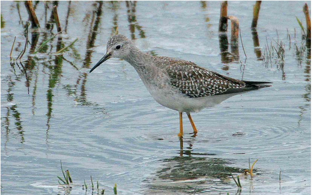
353 Kleine Geelpootruiter / Lesser Yellowlegs Tringa flavipes , juveniel, Amstelmeerdijk, Noord-Holland, 15 oktober 2002 (Jan Smit)