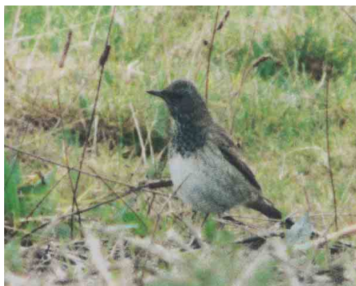
343 Daurian Shrike / Daurische Klauwier Lanius isabellinus , St Mary's, Scilly, England, October 2002 (Steve Young/Birdwatch) 344 Two-barred Crossbill / Witbandkruisbek Loxia leucoptera bifasciata , adult male, Orrevatnet, Jæren, Rogaland, Norway, 1 October 2002 (Sietze Bernardus) 345 Red-flanked Bluetail / Blauwstaart Tarsiger cyanurus , first-winter, Blériot-Plage, Pas-de-Calais, France, 23 October 2002 (Roger Tonnel) 346 Red-flanked Bluetail / Blauwstaart Tarsiger cyanurus , first-winter, Helgoland, Schleswig-Holstein, Germany, 18 September 2002 (Jochen Dierschke) 347 Eastern Crowned Warbler / Oostelijke Kroonzanger Phylloscopus coronatus , Jæren, Rogaland, Norway, 30 September 2002 (Fredrik Kræmer) 348 Black-throated Thrush / Zwartkeellijster Turdus rufo-collis atrogularis , Tresco, Scilly, England, October 2002 (Steve Young/Birdwatch)