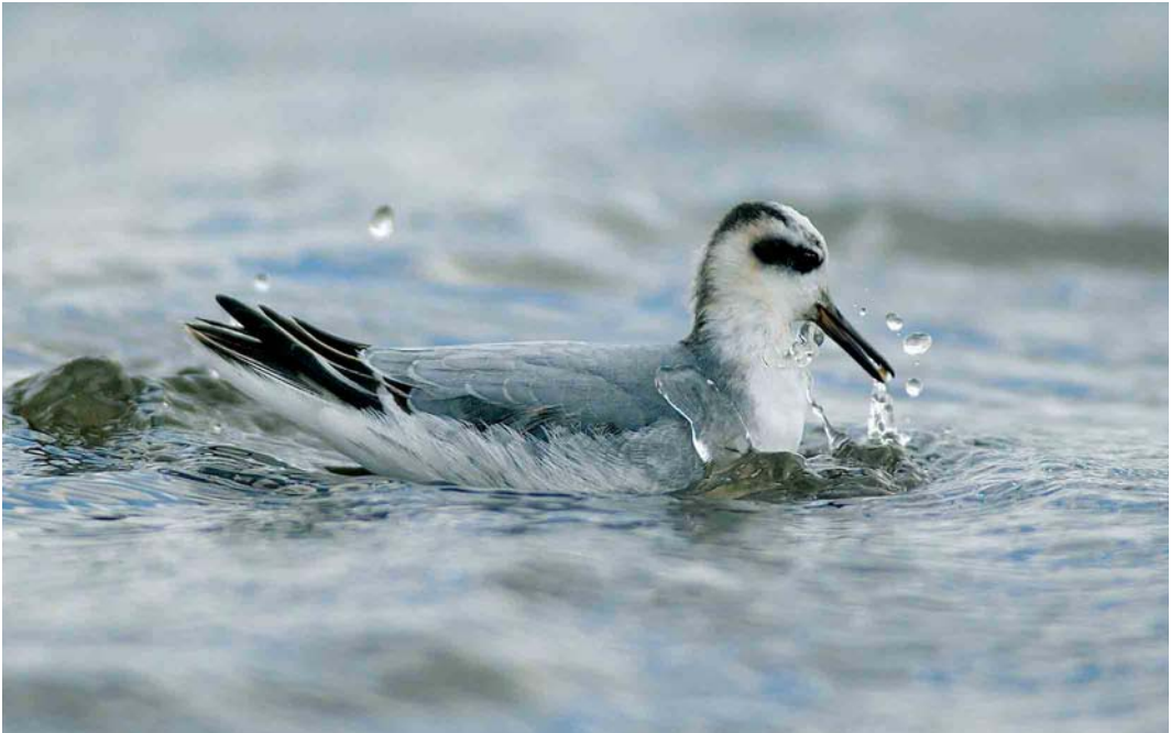
351 Rosse Franjepoot / Red Phalarope Phalaropus fulicaria , eerstejaars, Amstelmeerdijk, Noord-Holland, 23 oktober 2002 (René Pop)