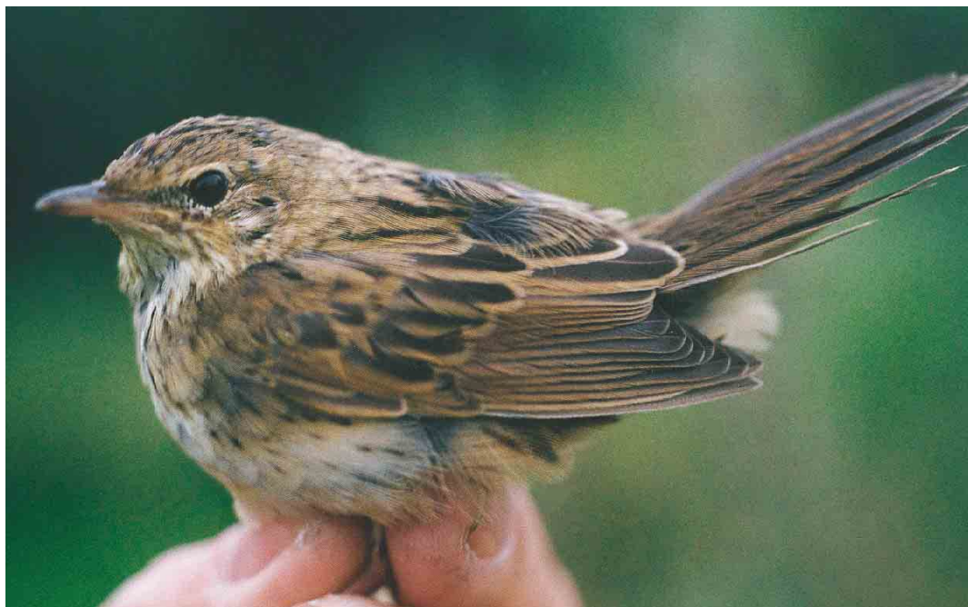
374 Kleine Sprinkhaanzanger / Lanceolated Warbler Locustella lanceolata , Amsterdamse Waterleidingduinen, Zandvoort, Noord-Holland, 20 september 2002 (Tom M van Spanje) 375 Siberische Sprinkhaanzanger / Pallas's Grasshopper Warbler Locustella certhiola , Castricum, Noord-Holland, 21 september 2002 (Paul S Ruiters) 376 Siberische Sprinkhaanzanger / Pallas's Grasshopper Warbler Locustella certhiola , Castricum, Noord-Holland, 27 september 2002 (René W R J Dekker)