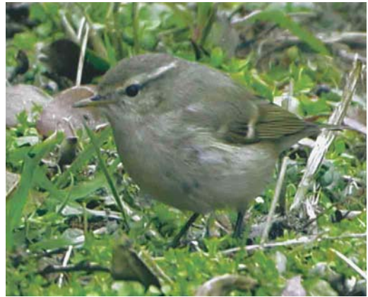
305 Greenish Warbler / Grauwe Fitis Phylloscopus trochiloides , Lauwersoog, Groningen, 23 September 2001 306 Iberian Chiffchaff / Iberische Tjiftjaf Phylloscopus brehmii , Belfeld, Limburg, 8 June 2001 307 Arctic Warbler / Noordse Boszanger Phylloscopus borealis , Petten, Noord-Holland, 30 September 2001 308 Arctic Warbler / Noordse Boszanger Phylloscopus borealis , first-winter, Kroonspolders, Vlieland, Friesland, 20 September 2001 309 Red-eyed Vireo / Roodoogvireo Vireo olivaceus , Schiermonnikoog, Friesland, 13 October 2001 310 Hume's Leaf Warbler / Humes Bladkoning Phylloscopus humei , Egmond aan Zee, Noord-Holland, March 2001