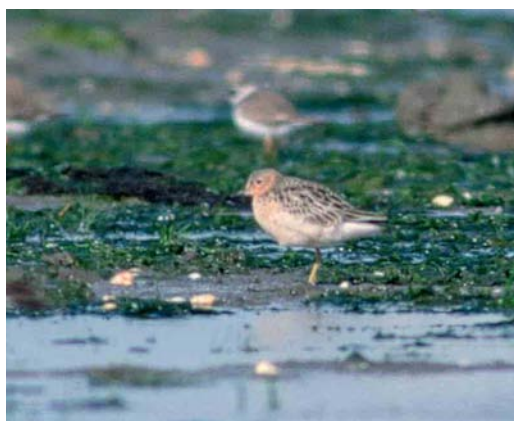
293 Greater Sand Plover / Woestijnplevier Charadrius leschenaultii , second calendar-year female, Oostvaardersdijk, Almere, Flevoland, 26 June 2001 ( Jan van Holten ) 294 Black-winged Pratincole / Steppeworkstaartplevier Glareola nordmanni , first-winter, Den Hoorn, Texel, Noord-Holland, 19 August 2001 ( Erik Menkveld ) 295 Pacific Golden Plover / Aziatische Goudplevier Pluvialis fulva , adult summer, Oosterend, Terschelling , Friesland, 22 July 2001 ( Arie Ouwerkerk ) 296 Buff-breasted Sandpiper / Blonde Ruitr Tryngites subruficollis , adult, Eemshaven, Groningen, 10 August 2001 ( Eric Koops )