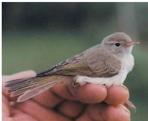
297 bonelli's warbler / bergfluits Phylloscopus bonelli/orientalis , first-winter, Amsterdamse Waterleidingduinen, Zandvoort, Noord-Holland, 17 August 2001 (Tom M van Spanje)