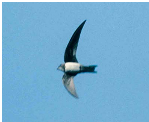
377 Alpengierzwaluw / Alpine Swift Apus melba, Wageningen, Gelderland, 12 november 2002