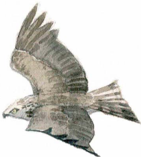
FIGURE 1 Short-toed Eagle / Slangenarend Circaetus gallicus, Fochtelooërveen, Drenthe/Friesland, June 2001