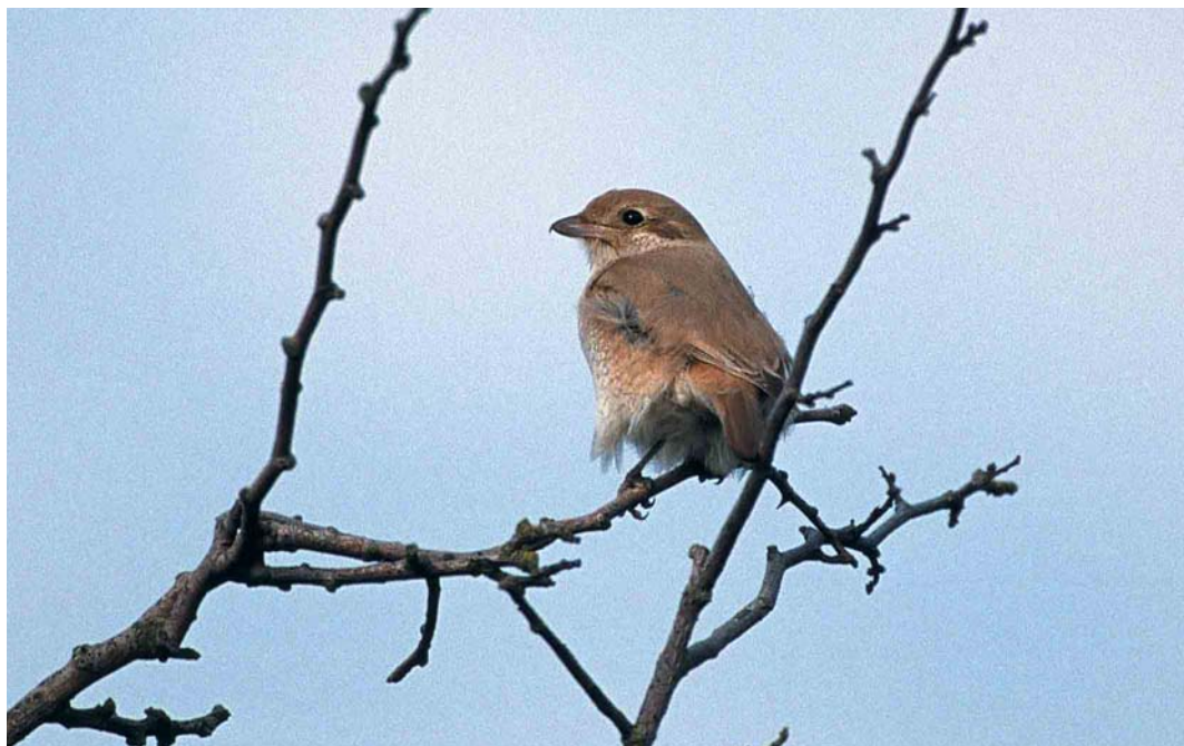
312 Daurian Shrike / Daurische Klauwier Lanius isabellinus , first-winter, Noordhollands Duinreservaat, Castricum, Noord-Holland, 3 October 2000