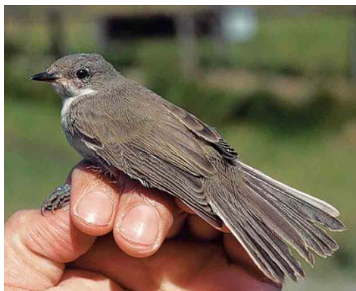
326 Lesser Whitethroat / Braamsluiper Sylvia curruca , Bloemendaal, Noord-Holland, Netherlands, 7 August 1997 (Arnoud B van den Berg)

tween Lesser Whitethroat S curruca and Arabian S leucomelaena , Eastern Orphea S crassirostris and Western Orphea Warbler S hortensis . Other Sylvia species, which were frequently mentioned as possible answers, can have a dark greyish hood and may therefore cause confusion. However, these species can be ruled out by the combination of a dark orbital ring, speckled whitish eye-ring and the lack of a pale greyish or yellowish lower mandible. From the mentioned possibilities, Arabian Warbler can be ruled out quite easily since this species has a darker, less greyish head. Especially the ear-coverts are much darker in Arabian compared with the mystery bird.