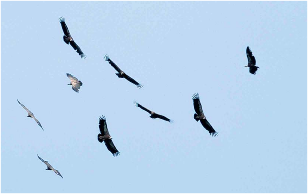
287 Eurasian Griffon Vultures / Vale Gieren Gyps fulvus , immatures, Westenschouwen, Zeeland, July 2001 288 Egyptian Vulture / Aasgier Neophron percnopterus , adult, Epen, Limburg, 25 May 2001