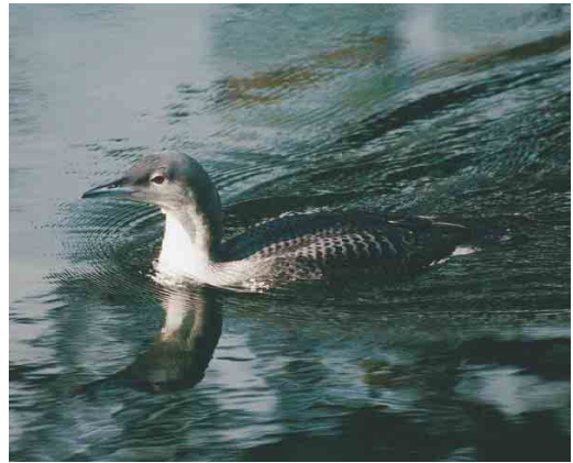
361 Bastaardarend / Greater Spotted Eagle Aquila clanga , onvolwassen, Oostvaardersplassen, Flevoland, 15 september 2002 362 Alpengierzwaluw / Alpine Swift Apus melba , Terschelling, Friesland, 20 september 2002 363 Gestreepte Strandloper / Pectoral Sandpiper Calidris melanotos , juveniel, Callantsoog, Noord-Holland, 15 september 2002 364 Grote Franjepoot / Wilson's Phalarope Phalaropus tricolor , eerstejaars, 't Zand, Noord-Holland, 15 september 2002 365 Pontische Meeuw / Pontic Gull Larus cachinnans cachinnans , eerste-winter, Noordzee nabij Schiermonnikoog, Friesland, 21 september 2002 366 Parelduiker / Black-throated Loon Gavia arctica , juveniel, Raalte, Gelderland, 24 oktober 2002