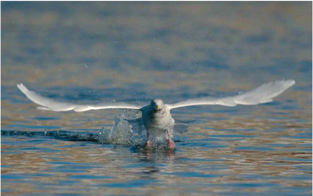
352 Grote Burgemeester / Glaucous Gull Larus hyperboreus , adult, Den Helder, Noord-Holland, 24 oktober 2002 (René Pop)