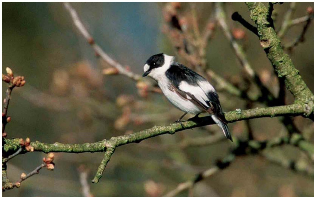
313 Collared Flycatcher / Withalsvliegenvanger Ficedula albicollis , first-summer male, Lies, Terschelling, Friesland, 7 May 2001