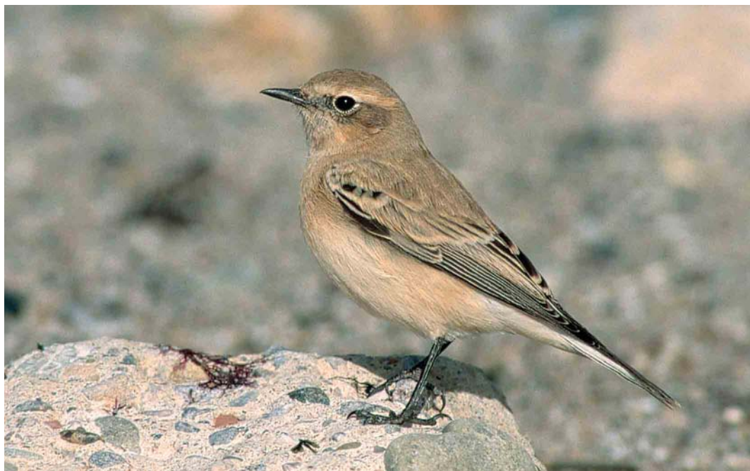
341 Black-eared wheatear / blonde tapuit Oenanthe hispanica/melanoleuca , Helgoland, Schleswig-Holstein, Germany, 6 October 2002