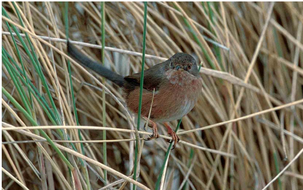
304 Dartford Warbler / Provençaalse Grasmus Sylvia undata , first-summer, Maasvlakte, Zuid-Holland, 25 March 2001 (Jan van Holten)