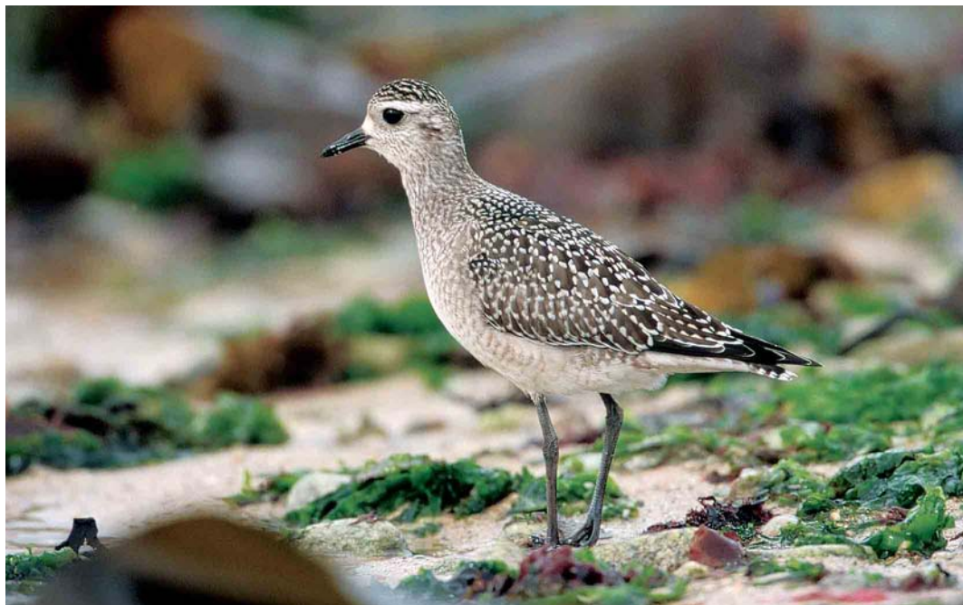
329 American Golden Plover / Amerikaanse Goudplevier Pluvialis dominica , Ouessant, Finistère, France, 9 October 2002