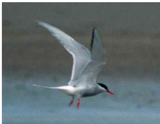
323 Arctic Tern / Noordse Stern Sterna paradisaea , adult summer, with African Skimmer / Afrikaanse Schaarbek Rynchops flavirostris and Lesser Crested Terns / Bengaalse Sterns S bengalensis , Sabaki river mouth, Kenya, 6 July 2002 (Jan Bisschop) 324 Arctic Tern / Noordse Stern Sterna paradisaea , adult summer, Sabaki river mouth, Kenya, 6 July 2002 (Jan Bisschop)

Tawila Island, Red Sea, Egypt (Shirihai 1999). Furthermore, in the north-eastern Indian Ocean region, Arctic Tern has reportedly been seen in Oman (Porter et al 1996) and there is one inland sighting from Kashmir, India (Grimmett et al 1998). The 21 records at Eilat, Israel (Shirihai 1996), may also be relevant in this context, because these birds are likely to have arrived there from the Indian Ocean. Up to now, Arctic Tern has not been reported from Tanzania, Madagascar, Seychelles or the Comoro archipelago.