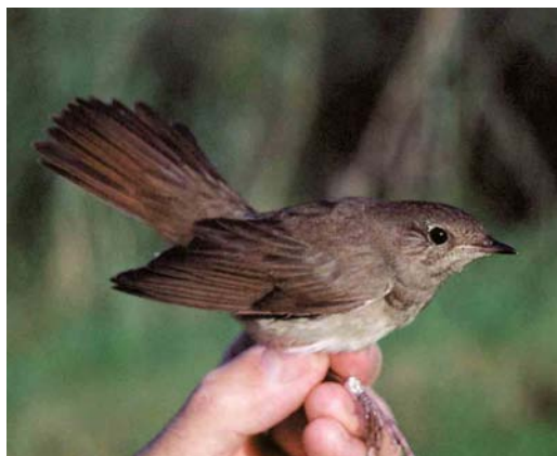
298 Thrush Nightingale / Noordse Nachtegaal Luscinia luscinia , first-winter, Amsterdamse Waterleidingduinen, Zandvoort, Noord-Holland, 15 August 2001