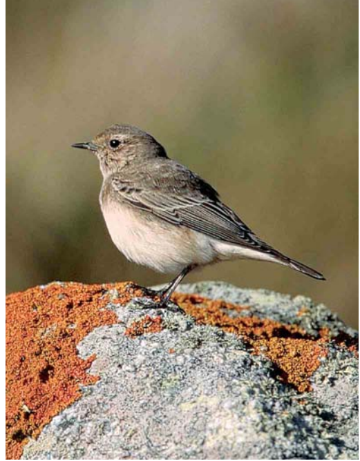
338 Blyth's Pipit / Mongoolse Pieper Anthus gustavi , Titran, Frøya, Sør-Trøndelag, Norway, 8 October 2002 (Kjetil Solbakken) 339 Pied Wheatear / Bonte Tapuit Oenanthe pleschanka , Ouessant, Finistère, France, 18 October 2002 (Arie Ouwerkerk) 340 Pechora Pipit / Petsjorapieper Anthus gustavi , Utsira, Rogaland, Norway, 6 October 2002 (Vegard Bunes)