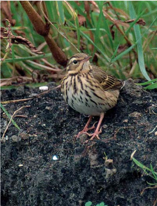
299 Olive-backed Pipit / Siberische Boompieper Anthus hodgsoni , Den Haag, Zuid-Holland, 3 October 2001 (Marten van Dijk)