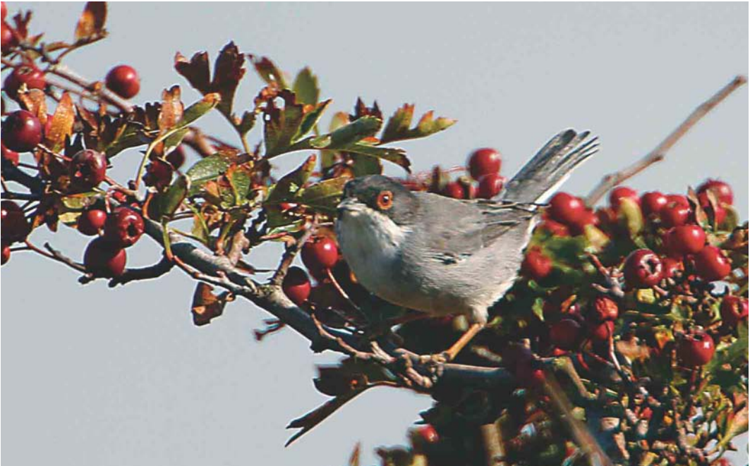
349 Sardinian Warbler / Kleine Zwartkop Sylvia melanocephala , male, Old Hunstanton, Norfolk, England, 5 October 2002 (Bill Baston)