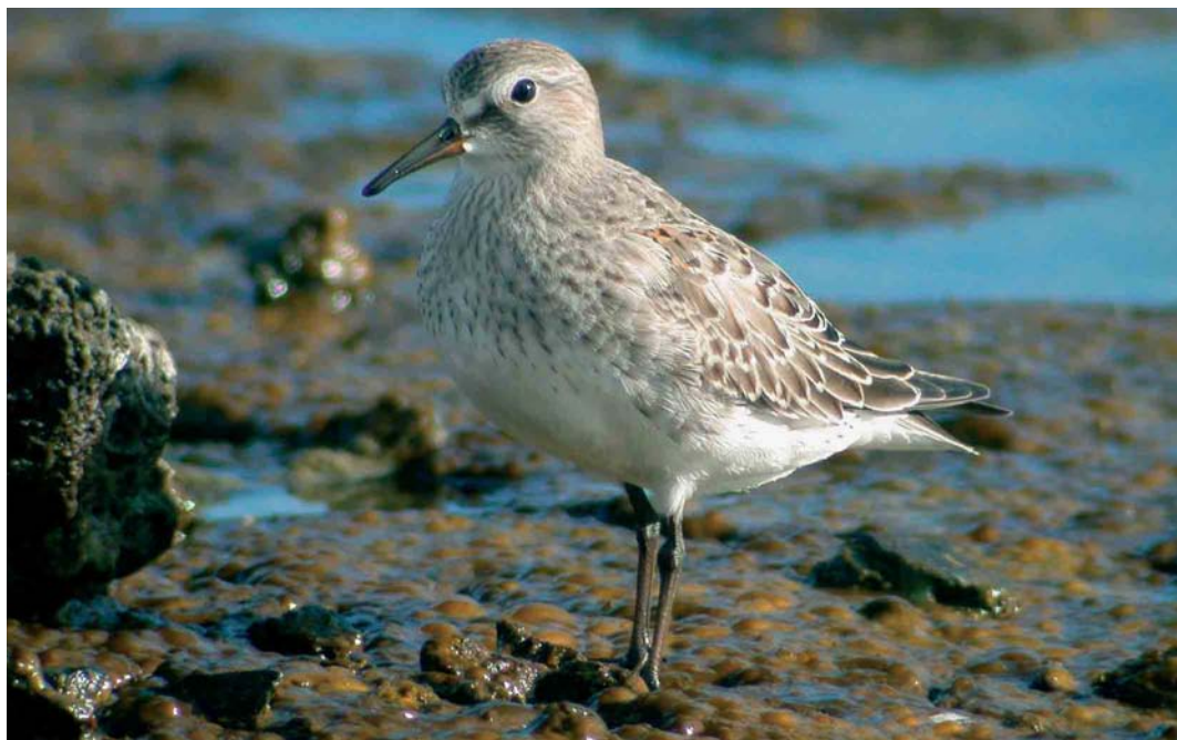
328 White-rumped Sandpiper / Bonapartes Strandloper Calidris fuscicollis , juvenile, Cabo da Praia, Terceira, Azores, 15 October 2002