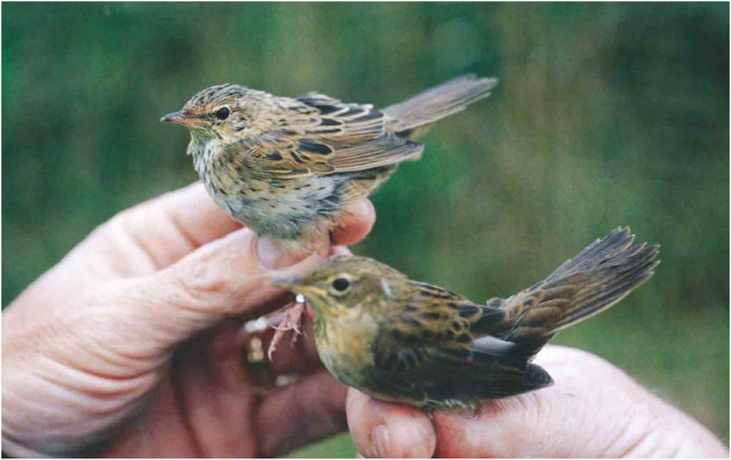
357 Kleine Sprinkhaanzanger / Lanceolated Warbler Locustella lanceolata (boven/upper) met Sprinkhaanzanger / Common Grasshopper Warbler L. naevia , Amsterdamse Waterleidingduinen, Zandvoort, Noord-Holland, 20 september 2002 358 Siberische Sprinkhaanzanger / Pallas's Grasshopper Warbler Locustella certhiola , Castricum, Noord-Holland, 21 september 2002