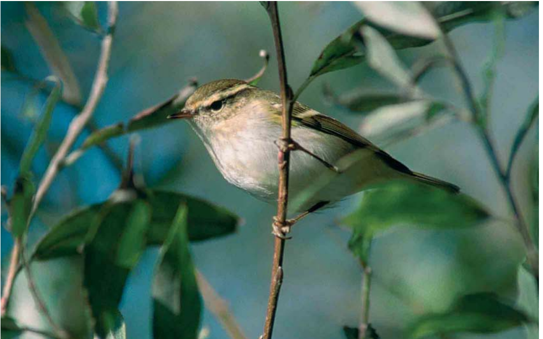
359 Bladkoning / Yellow-browed Warbler Phylloscopus inornatus , Texel, Noord-Holland, 8 oktober 2002