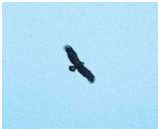
371 Schreeuwarend / Lesser Spotted Eagle Aquila pomarina , juveniel, Grimbergen, Vlaams-Brabant, 12 september 2002 (Axel Smets)

WOUWEN TOT ALKEN Een Zwarte Wouw Milvus migrans trok op 16 september over Westkapelle, West-Vlaanderen. Op 24 september trok een Rode Wouw M. milvus over Brecht en op 29 september één over Uitkerke. Op 5 en 9 oktober trok er telkens één over Knokke; op 9 oktober werden er overtrekkende Rode Wouwen gezien te Galmaarden; Genk, Kalmthout; Leuven, Vlaams-Brabant (vier); Limburg; Mechelen (zes); Oostmalle; en Sint-Denijs, Oost-Vlaanderen (twee); op 10 oktober over Muizen, Antwerpen; op 11 oktober telkens één over Brecht, Kalmthout, en Rillaar, Antwerpen; en op 12 oktober over Broechem,