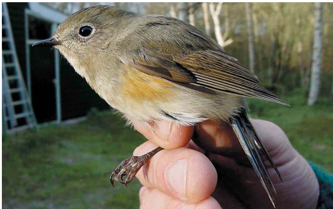
301 Red-flanked Bluetail / Blauwstaart Tarsiger cyanurus , first-winter female, Schiermonnikoog, Friesland, 5 November 2001 ( Henri Bouwmeester ) 302 Desert Wheatear / Woestijntapuit Oenanthe deserti , first-winter male, Eemshaven, Groningen, 13 October 2001 ( Eric Koops ) 303 Eyebrowed Thrush / Vale Lijster Turdus obscurus , first-winter, Oranjezon, Zeeland, 25 September 2001 ( Adri Joosse )