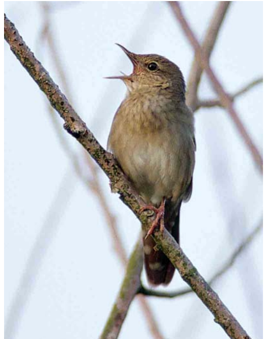
300 River Warbler / Krekelzanger Locustella fluviatilis , Leerdam, Gelderland, 5 June 2001 (Marten van Dijk)