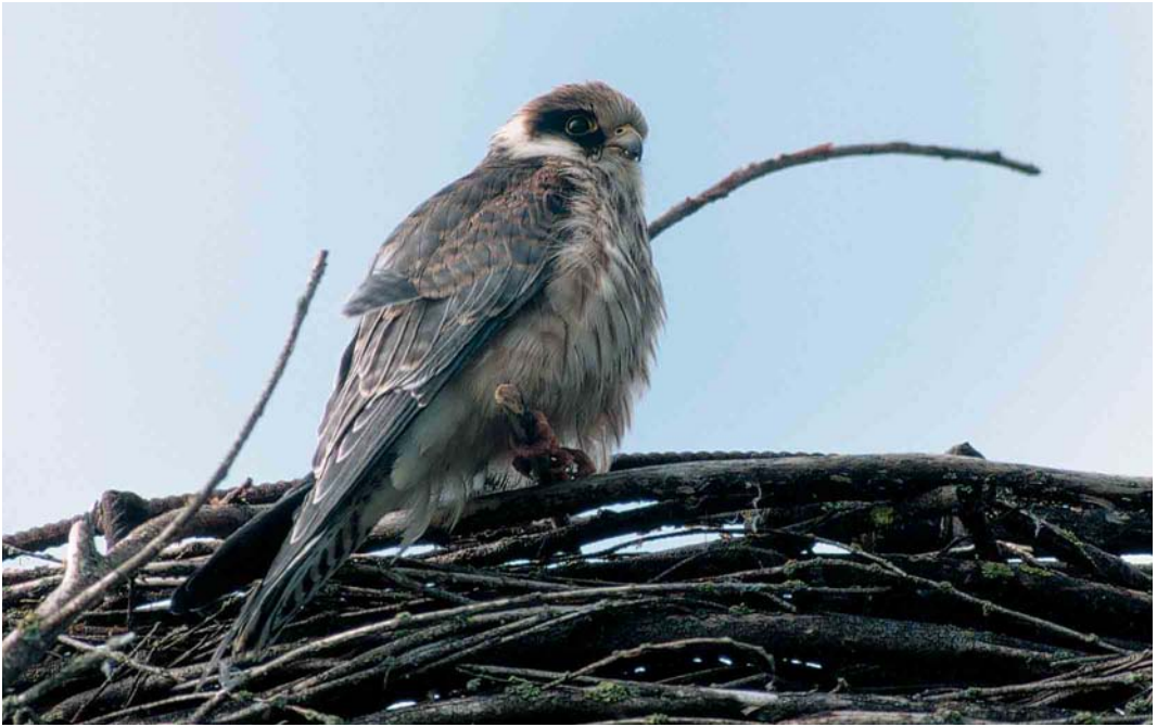
355 Roodpootvalk / Red-footed Falcon Falco vespertinus , juveniel, Lauwersmeer, Groningen, 23 september 2002 (Eric Koops)