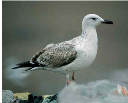
315 Pontic Gull / Pontische Meeuw Larus cachinnans cachinnans , adult, Konin, central Poland, January 2002 (Marcin Faber) 316 Pontic Gull / Pontische Meeuw Larus cachinnans cachinnans , adult, Konin, central Poland, December 2001 (Marcin Faber) 317 Pontic Gull / Pontische Meeuw Larus cachinnans cachinnans , adult, Konin, central Poland, January 2002 (Marcin Faber) 318 Pontic Gull / Pontische Meeuw Larus cachinnans cachinnans , first-winter, Toruń, Poland, February/March 2001 (Grzegorz Neubauer)

Herring and 28% in Pontic Gulls. Birds in older immature plumages (second-winter and third-winter) of both species were rarer (figure 2).