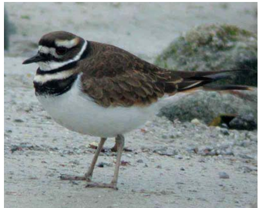
334 Hudsonian Whimbrel / Amerikaanse Regenwulp Numenius hudsonicus , Cabo da Praia, Terceira, Azores, 9 October 2002 (Leo J R Boon/Cursorius) 335 Baird's Sandpiper / Bairds Strandloper Calidris bairdii , juvenile, Cabo da Praia, Terceira, Azores, 15 October 2002 (Leo J R Boon/Cursorius) 336 Buff-breasted Sandpiper / Blonde Ruitter Tryngites subruficollis , juvenile, Lista, Norway, 26 September 2002 (Sietze Bernardus) 337 Killdeer / Killdeerplevier Charadrius vociferus , St Agnes, Scilly, November 2002 (Chris Batty)

site on 20-29 October). In Israel, a record 14 000 Red-footed Falcons Falco vespertinus were counted in the northern valleys this autumn, with a high of 7400 on 30 September. The first Barbary Falcon F. pelegrinoides for Malta since 1865 was at Buskett on 15 October.