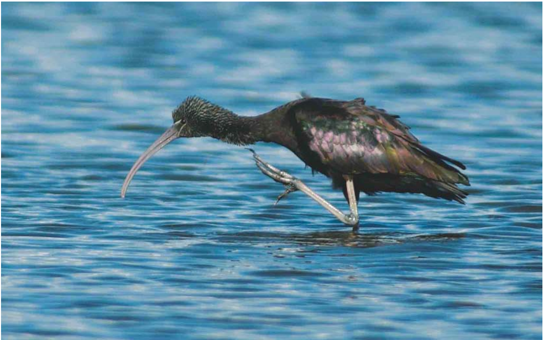
354 Zwarte Ibis / Glossy Ibis Plegadis falcinellus , adult, Julianadorp, Noord-Holland, september 2002