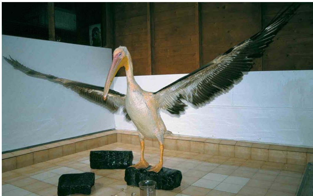
285 Great White Pelican / Roze Pelikaan Pelecanus onocrotalus , first-summer (taken into care at Oil Platform K-18 Kotter, Continental Shelf, on 28 May 2001), Den Helder, Noord-Holland, 2 June 2001 ( Ruud E Brouwer )