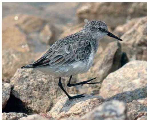
325 Little Stint / Kleine Strandloper Calidris minuta , Eilat, Israel, 28 March 1997 (Ruud E Brouwer). The scapulars of this stint show dark shaft-streaks and dark central areas. This is, however, not always easy to see, especially in the field