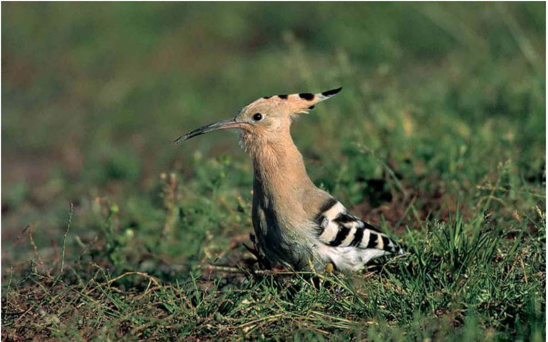
356 Hop / Eurasian Hoopoe Upupa epops , De Cocksdorp, Texel, Noord-Holland, 8 oktober 2002