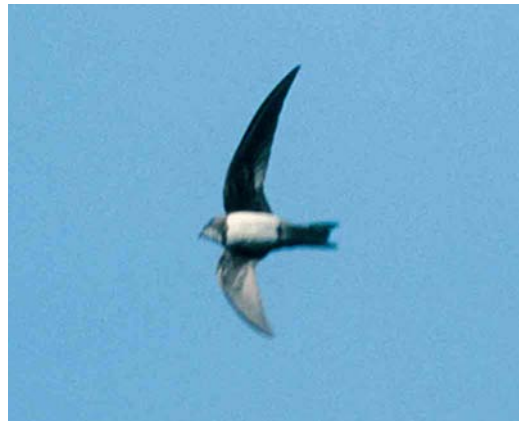
377 Alpengierzwaluw / Alpine Swift Apus melba , Wageningen, Gelderland, 12 november 2002

Pleisterende Alpengierzwaluw in Wageningen Op zondag 10 november 2002 zag Robert Keizer kortstondig een Alpengierzwaluw Apus melba vliegen boven Plantage Willem III aan de oostkant van Elst, Utrecht. Op maandag 11 november werd naar mag worden aangenomen dezelfde Alpengierzwaluw rond 09:00 gezien boven de wijk Noordwest in Wageningen, Gelderland. Daarna zagen Herman van Oosten en Marijn Salverda hem rond 11:30 boven de Rijnhaven