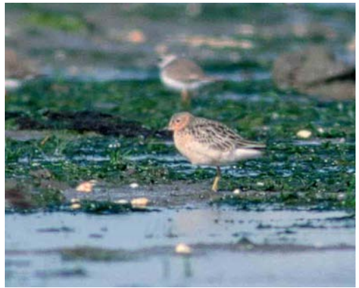
293 Greater Sand Plover / Woestijnplevier Charadrius leschenaultii , second calendar-year female, Oostvaardersdijk, Almere, Flevoland, 26 June 2001 ( Jan van Holten ) 294 Black-winged Pratincole / Steppeworkstaartplevier Glareola nordmanni , first-winter, Den Hoorn, Texel, Noord-Holland, 19 August 2001 ( Erik Menkveld ) 295 Pacific Golden Plover / Aziatische Goudplevier Pluvialis fulva , adult summer, Oosterend, Terschelling , Friesland, 22 July 2001 ( Arie Ouwerkerk ) 296 Buff-breasted Sandpiper / Blonde Ruiters Tryngites subruficollis , adult, Eemshaven, Groningen, 10 August 2001 ( Eric Koops )