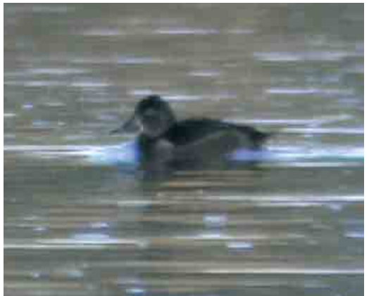
42 Hybride Witoogeed x Tafeleend / hybrid Ferruginous Duck x Common Pochard Aythya nyroca x ferina , vrouwtje, Oostvaardersdijk, Flevoland, 23 december 2001 43 Hybride Witoogeed x Tafeleend / hybrid Ferruginous Duck x Common Pochard Aythya nyroca x ferina , vrouwtje, Oostvaardersdijk, Flevoland, 23 december 2001. Tafeleendachtig snavelpatroon met brede zwarte punt en lichte subterminale band die beide langs snijranden teruglopen richting snavelbasis, lange snavel en groot formaat verschillen van zuiver vrouwtje Witoogeed en duiden op hybride met Tafeleend 44 Ringsnaveleend / Ring-necked Duck Aythya collaris , vrouwtje, Lobith, Gelderland, 10 november 2001

november maximaal twee bij Wierum. Een vrouwtje Ringsnaveleend Aythya collaris zwom op 10 november een middagje in de Bijland bij Lobith, Gelderland. Witoogeeden A nyroca werden opgemerkt op 4 november bij Wessem, Limburg, en op 22 december ten noorden van Eindhoven, Noord-Brabant. Een tweetal kruisingen met Tafeleend A ferina verbleef eind december langs de Oostvaardersdijk, Flevoland. De Amerikaanse Smient Mareca americana van Uithoorn, Noord-Holland, bleef daar tot 3 november. Andere bevonden zich op 9 november op de Ouderkerkerplas, Noord-Holland, van 25 november tot in januari in de Kapelsche Moer, Zeeland, en op 29 december bij Vlaardingen, Zuid-Holland. Een Amerikaanse Winter-taling Anas carolinensis werd op 25 november gezien