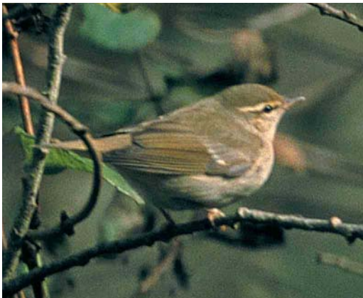
39 Arctic Warbler / Noordse Boszanger Phylloscopus borealis , Ouessant, Finistère, France, October 2001 cf Dutch Birding 23: 366, 2001

ing 900 000 were shot. A longevity record was established by a Mistle Thrush T viscivorus ringed in Switzerland on 21 September 1978 and shot in Spain on 19 December 1999, reaching an age of at least 21 years and four months (Ornithol Beob 98: 349-350, 2001).