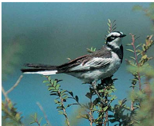
58 Mekong Wagtail / Mekongkwikstaart Motacilla samveasnae , female, Stung Treng Province, Cambodia, February 2001

the many proposed projects for the construction of dams in the lower Mekong area could conceivably quickly alter the fate for existing populations. Moreover, since the area of its known world range is extremely small (and, within this range, it is confined to river banks), the species may best be considered 'near-threatened' following the IUCN (1994) red list criteria for threatened species. This status could change to 'vulnerable' if a dam project in a key stretch of river within the breeding range is developed. ENNO B EBELS