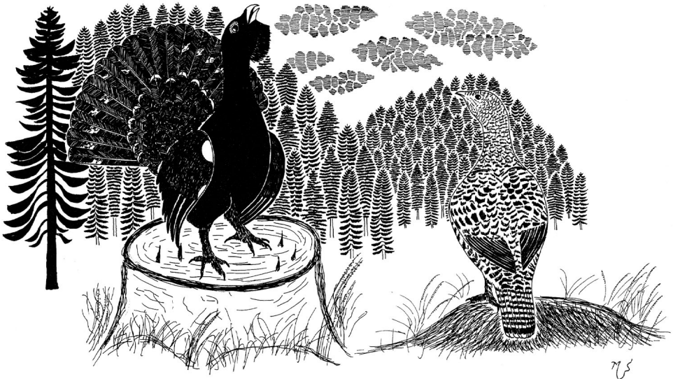
FIGURE 9 Western Capercaillie / Auerhoen Tetrao urogallus . Male courting hen on ground (Miroslav Saniga)