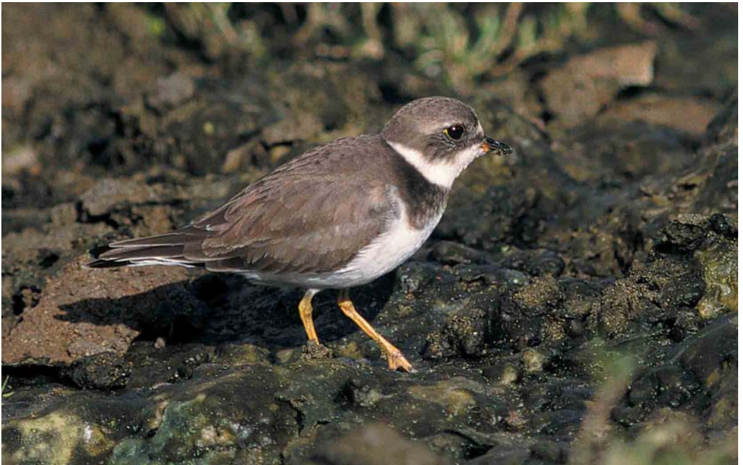
32 Semipalmated Plover / Amerikaanse Bontbekplevier Charadrius semipalmatus , Cabo da Praia, Terceira, Azores, 14 November 2001