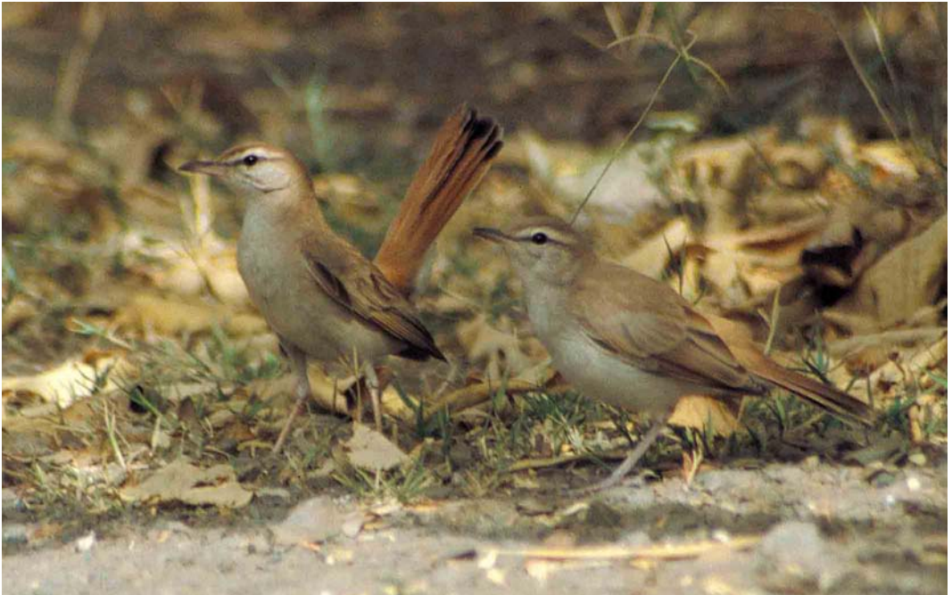
14 Western Rufous-tailed Scrub Robins / Westelijke Rosse Waaiertaarten Cercotrichas galactotes galactotes , juvenile (right) and adult, Marrakech, Morocco, July 2001 ( Martijn Verdoes )

XII This year's last mystery photograph depicts a small songbird. The bird looks rather featureless, thereby offering little clue for identification. The head pattern is rather diffuse yet shows a long