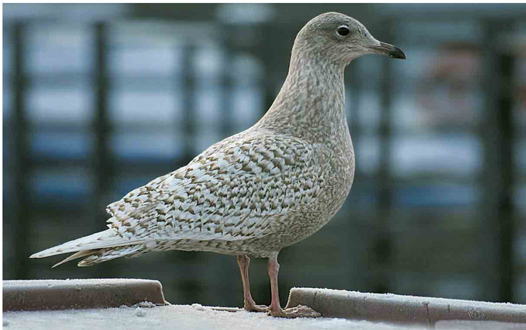
33 Iceland Gull / Kleine Burgemeester Larus glaucoides , first-winter, Huizen, Noord-Holland, Netherlands, 10 January 2001