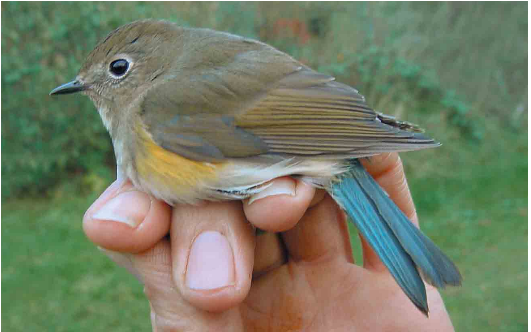
47 Blauwstaart / Red-flanked Bluetail Tarsiger cyanurus , eerste-winter, Schiermonnikoog, Friesland, 5 november 2001 48 Kleine Alk / Little Auk Alle alle , IJmuiden, Noord-Holland, 2 november 2001 49 Dwerggans / Lesser White-fronted Goose Anser erythropus , adult (rechts), Strijen, Zuid-Holland, 16 november 2001