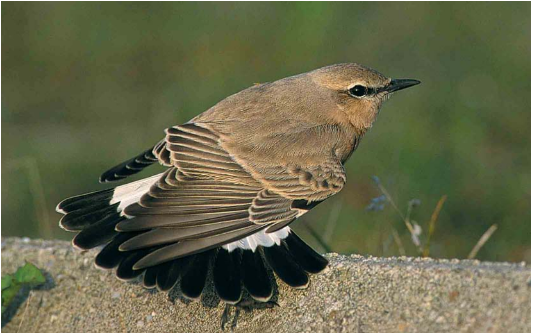
5 Izabeltapuit / Isabelline Wheater Oenanthe isabellina , IJmuiden, Noord-Holland, 23 september 2000 (Roef Mulder)

GEDRAG Beide dagen verblijvend op schaars begroeide parkeerplaats met veel paaltjes en stenen. Foeragerend op grond, daarbij soms grote afstanden rennend. Regelmatig op platte steen van 10 cm hoog zittend en dan rondkijkend. Ook vaak op 1 m hoge paal zittend. Dan soms tot 5 m hoog opvliegend om insect te vangen. Niet schuw, waarnemers regelmatig tot 3 m afstand benaderend. Solitair. Joeg Tapuiten weg.