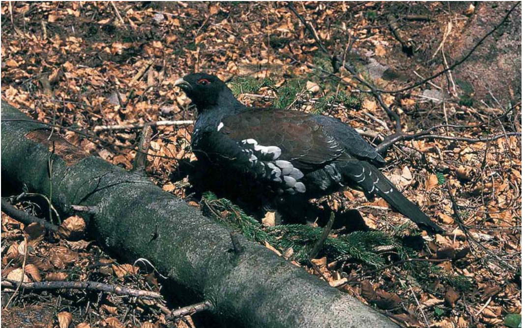
9 Western Capercaillie / Auerhoen Tetrao urogallus , male after morning display on the ground, Vel'ká Fatra mountains, Slovakia, 20 April 1996