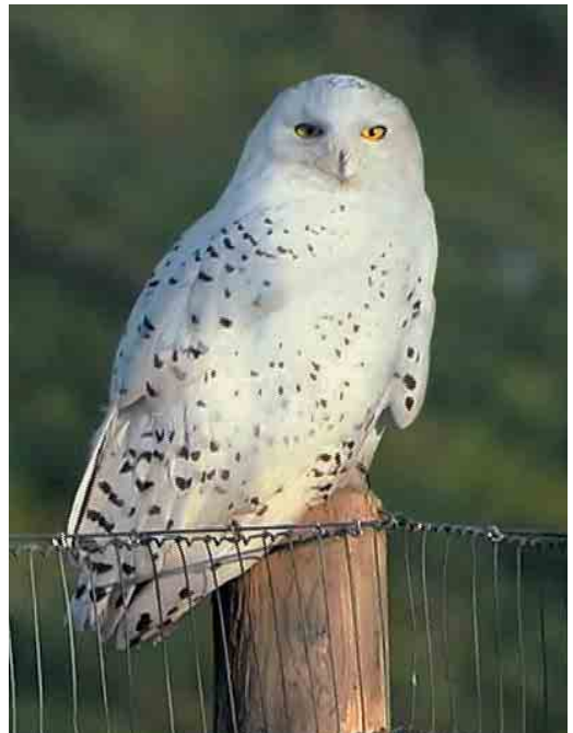
61 Sneeuwuil / Snowy Owl Nyctea scandiaca , adult mannetje, Meerssen, Limburg, 8 januari 2002 (Marc Plomp)

Keer op keer blijkt dat met name zeldzame roofvogels en uilen vatbaar zijn voor dit soort taferelen die gevoed worden door een mengsel van oprechte betrokkenheid van vogelaars, niet-vogelaars en opvangcentra, mogelijke belangen van voliërehouders van al dan niet legaal gehouden vogels, sensatiezucht bij de pers, onduidelijkheid of onwetendheid over wettelijke verantwoordelijkheden en 'claimgedrag' bij verschillende instanties. Voor een klein en voor leken en journalisten weinig aansprekend vogeltje als bijvoorbeeld de Pallas' Boszanger Phylloscopus proregulus van Zandvoort, Noord-Holland, meldde zich geen enkele 'beschermer' ... ENNO B EBELS & MAX BERLIJN