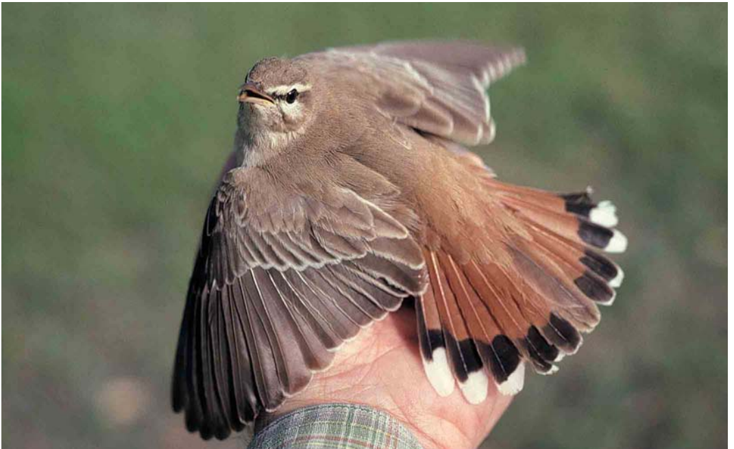
21 Eastern Rufous-tailed Scrub Robin / Oostelijke Rosse Waaierstaart Cercotrichas galactotes familiaris , Jubail, Gulf, Saudi Arabia, 19 April 1991. Note pale grey-brown upperparts, broad black subterminal tail-band and contrastingly darker central pair of tail-feathers