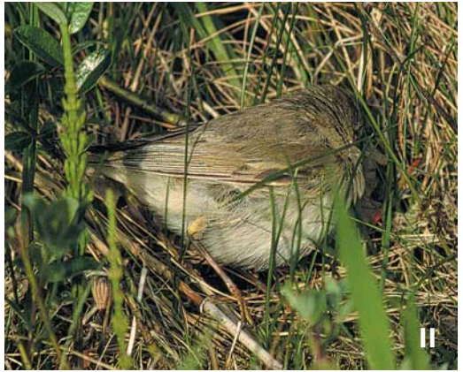
Mystery photograph II (May)