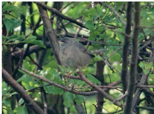
234-235 Sardijnse Grasmus / Marmora's Warbler Sylvia sarda , Duinbergen, Knokke-Heist, West-Vlaanderen, België, 7 mei 1997 (Marnix Vandegehuchte)

delen (van geen belang bij juveniele). De keel van balearica is effen witachtig grijs en contrasteert duidelijk met de donkere teugel en soms met de borst. De keel van sarda is meer effen grijs, bij mannetjes met dezelfde grijs tint als de borst; sarda mist bijgevolg de contrasterend lichte keel van typische balearica . Wat dit kenmerk betreft, komt de Belgische vogel beter overeen met sarda dan met balearica . 4 Snavelkleur Hoewel dit verschil moeilijk in het veld waarneembaar is, heeft balearica gemiddeld een minder zwarte en kleinere zwartachtige punt aan de ondersnavel; bij sommige exemplaren (hoofdzakelijk juveniele) ontbreekt deze zwartachtige ondersnavelpunt; sarda , daarentegen, heeft een meer uitgebreide en duidelijk afgetekende zwartachtige punt. De lichte snavelbasis is meestal geelachtig oranje bij balearica , maar meer roze-achtig bij sarda . De Belgische vogel had een uitgebreide zwartachtige punt aan de ondersnavel (goed voor sarda ) maar een geelachtige snavelbasis. De determinatie als sarda werd bevestigd door Gabriel Gargallo (in litt).