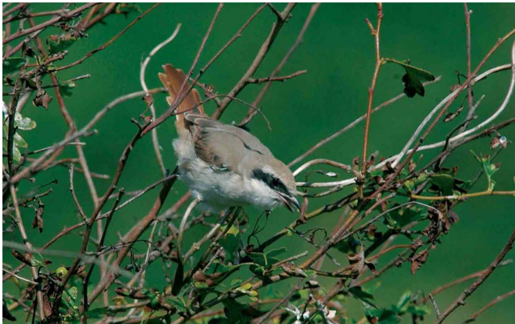
272 Turkestaanse Klauwier / Turkestan Shrike Lanius phoenicuroides , adult mannetje, Bleekersvallei, Texel, Noord-Holland, 14 augustus 2002