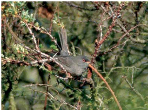
233 Sardijnse Grasmus / Marmora's Warbler Sylvia sarda , Duinbergen, Knokke-Heist, West-Vlaanderen, België, 7 mei 1997 (Johan Buckens)

BOVENDELEN Licht leigrijs, lichter dan bij mannetje Oostelijke Baardgrasmus (waarmee direct te vergelijken). ONDERDELEN Licht leigrijs. Bij bepaald licht met vaag bruin waas. Donkerste gedeelte van onderdelen effen grijze borstband vormend. Lichtste gedeelte gevormd door nauwe lichte strook van buik naar anaalstreek. Geen spoor van rode tinten.