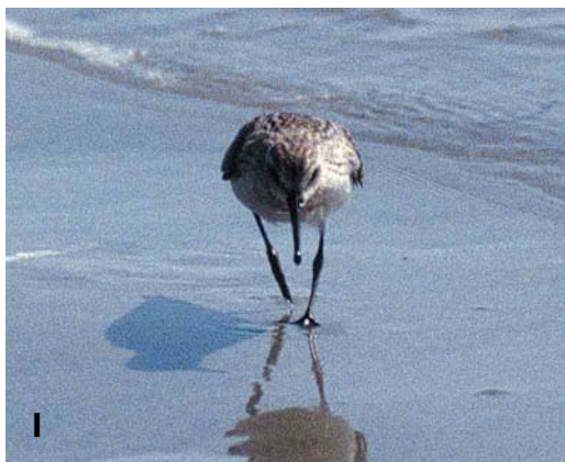
Mystery photograph I (August)