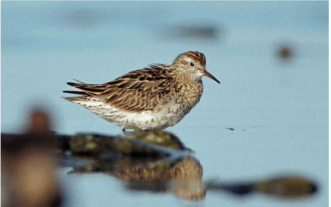
31 Sharp-tailed Sandpiper / Siberische Strandloper Calidris acuminata , adult summer moulting to winter plumage, Saaremaa Tammunaneem, Estonia, 31 August 2001 (Antti Luukkonen)