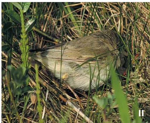
Mystery photograph II (May)