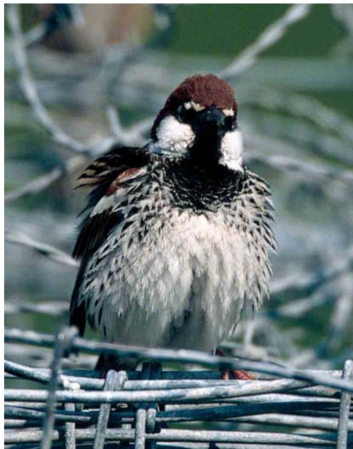
237-238 Spaanse Mus / Spanish Sparrow Passer hispaniolensis , adult mannetje, Camperduin, Noord-Holland, 13 mei 2000

Jan van Holten (cf Birding World 13: 186, 2000, Birdwatch 9 (98): 63, 2000, Dutch Birding 22: 179, plaat 156, 2000, 23: 340, plaat 390, 2001, Vogeljaar 46: 239, 2000; van den Berg & Bosman 2001) en videobeelden van Marc Plomp (Plomp et al 2001).