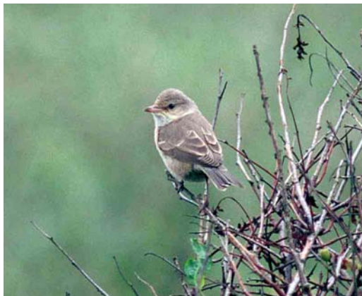
277 Sperwergrasmus / Barred Warbler Sylvia nisoria , eerstejaars, Bleekersvallei, Texel, Noord-Holland, 24 augustus 2002