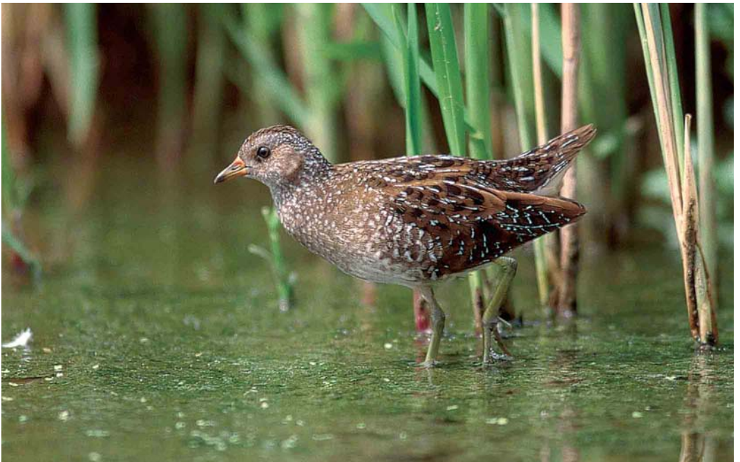
261 Porseleinhoen / Spotted Crake Porzana porzana , Starrevaart, Leidschendam, Zuid-Holland, 9 augustus 2002 (Bas van den Boogaard)