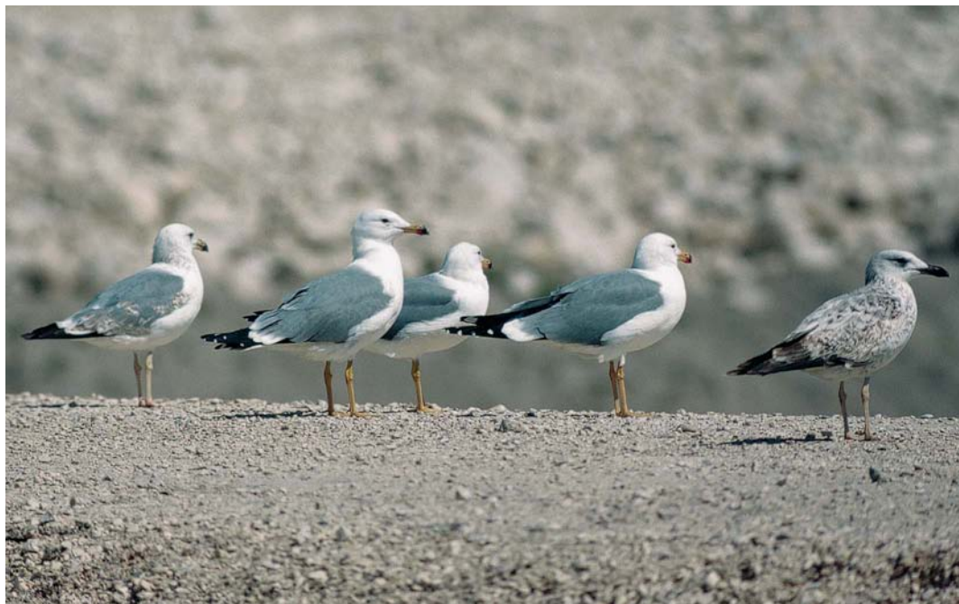
245 Armenian Gulls / Armeense Meeuwen Larus armenicus , Bet Shean, Israel, April 1990