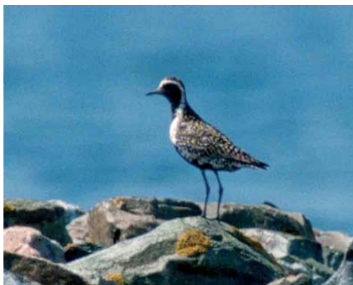
264 Ringsnavelmeeuw / Ring-billed Gull Larus delawarensis , adult, Wilhelminadorp, Zeeland, 19 augustus 2002 (Marten van Dijl) 265 Stepperearend / Steppe Eagle Aquila nipalensis , onvolwassen, Zouweboezem, Zuid-Holland, 15 juni 2002 (Jurjen Koerts) 266 Ralreiger / Squacco Heron Ardeola ralloides , Piershil, Hoekse Waard, Zuid-Holland, 23 juli 2002 (Chris van Rijswijk) 267 Aziatische Goudplevier / Pacific Golden Plover Pluvialis fulva , adult, Dwars in de Weg, Brouwershaven, Zeeland, 27 juli 2002 (Marten van Dijl)

augustus werden nog Woudapen Ixobrychus minutus gezien bij Tienhoven, Utrecht, ten zuiden van Delft, Zuid-Holland, bij Alphen aan den Rijn, Zuid-Holland, en bij Kinderdijk, Zuid-Holland. Maximaal 13 Kwakken Nycticorax nycticorax werden in juli gezien in de omgeving van Liessel, Noord-Brabant; later werd bekend dat hier in ieder geval één geslaagd broedgeval heeft plaatsgevonden. Verder werd elders nog een 10-tal exemplaren gemeld. Ralreigers Ardeola ralloides bleven ons land opsieren: tot 2 juli werden de twee van de Zuid-Schermer bij Alkmaar, Noord-Holland, nog gezien, op 30 juni en 1 juli verbleef er één bij het Driesumermeer bij Dokkum, Friesland, van 22 tot 24 juli één bij Piershil, Zuid-Holland, op 8 augustus ten oosten van Gouda, Zuid-Holland, en twee vlogen op 14 augustus over Oosterend, Terschelling, Friesland. Van 16 juli tot 3 augustus verbleef een Koereiger Bubulcus ibis in het natuurontwikkelingsgebied