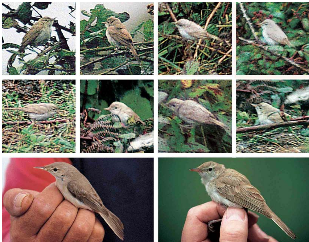
FIGURE 1 Upper eight photographs, unidentified warbler, Cape Clear Island, Ireland, October 1990. At present accepted as Olivaceous Warbler but under review. Bottom right, Sykes's Warbler, Shetland, October 1993. Bottom left, Olivaceous Warbler, Cape Clear Island, Ireland, September 2000

showed signs of wanting to grasp the nettle and read between the lines to answer the glaringly obvious question, 'Maybe ours wasn't an Olivaceous Warbler after all?' I sat on my hands too until, in 1999, I had the good fortune to meet one of the observers of the Shetland Booted Warbler.