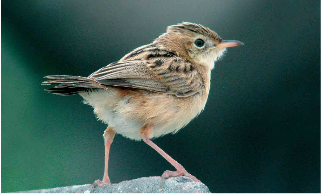
279 Graszanger / Zitting Cisticola juncidis , Zeebrugge, West-Vlaanderen, 27 juli 2002 (Yves Baptiste)