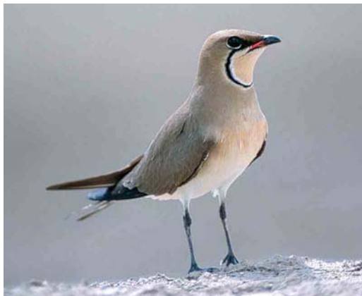
250 Collared Pratincole / Vorkstaartplevier Glareola pratincola , Brazo del Este, Spain, 26 April 2000. Note pale brown lores and forehead with some black feathers only just above bill