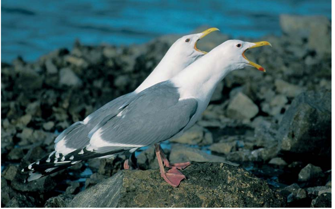
242-243 Vega Gulls / Vegameeuwen Larus vegae vegae , Anadyr, Chukotka, Russia, June 2000 (Chris Schenk)