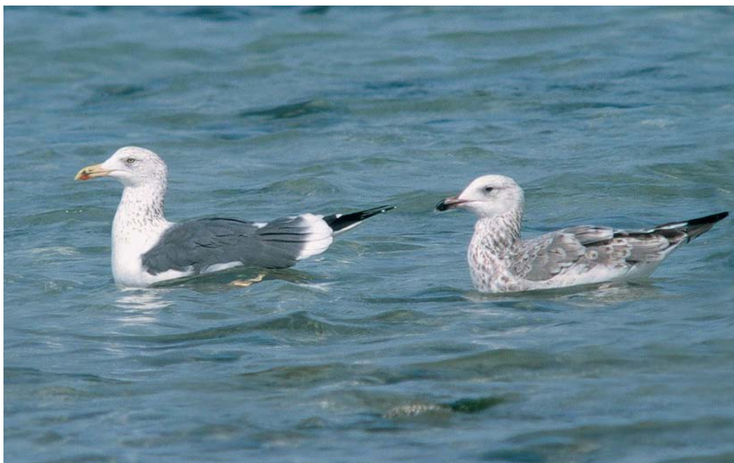
241 Heuglin's Gulls / Heuglins Meeuwen Larus heuglini , Bahrein, 27 February 2001 (Theodoor Muisse)