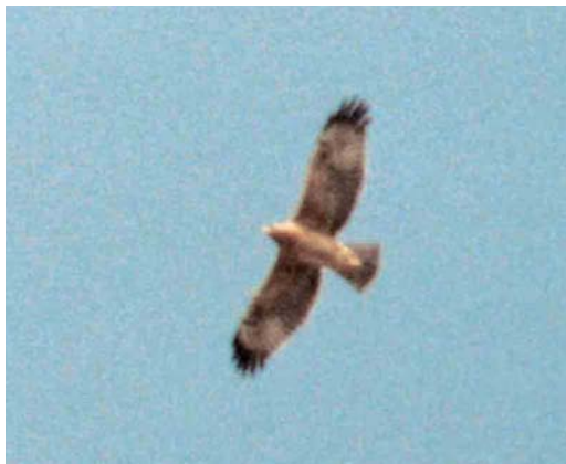
280-281 Havikarend / Bonelli's Eagle Hieraetus fasciatus , juveniel, Kroonspolders, Vlieland, Friesland, 15 augustus 2002

Zaterdag 17 augustus had ik eindelijk tijd om de foto's goed te bekijken en in de boeken te duiken. Toen kwamen ook de eerste serieuze berichten dat het waarschijnlijk om een Havikarend zou gaan en dus niet om een Arendbuizerd. Ruud Brouwer had de vogel de avond daarvoor laat als 'mogelijke Havikarend' doorgepiept. Met de foto's en een stapel boeken voor me op tafel besepte ik snel dat het inderdaad om een juveniele Havikarend ging. De foto's zijn duidelijk genoeg: ze laten de lange en brede vleugels met een S-vormige achterrand zien, kenmerkend voor een juveniel, de oranjebruine kleuren, de lange staart en de zwarte toppen aan de handpennen. De buitenste handpennen hebben een lichte basis.