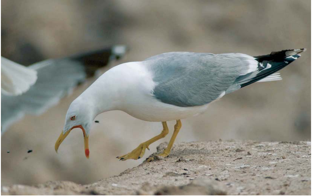
247 Yellow-legged Gull / Geelpootmeeuw Larus michahellis , Lesvos, Greece, 28 April 2002 (René Pop)

248 Yellow-legged Gull / Geelpootmeeuw Larus michahellis , Madeira, 3 March 1980 (Arnoud B van den Berg). In the past, birds of Madeira (and Canary Islands) were regarded to belong to L m atlantis (which is now considered to be restricted to the Azores)