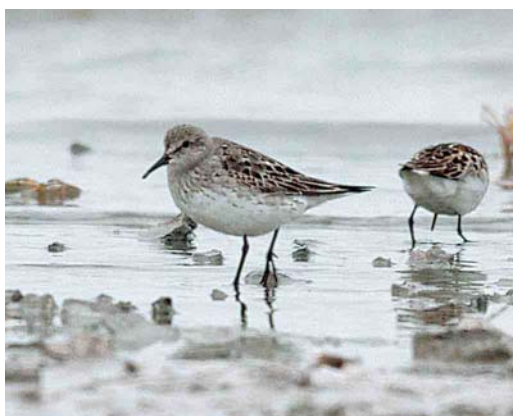
254 Pied-billed Grebe / Dikbekfuut Podilymbus podiceps , Rethen, Hannover, Germany, July 2002 255 Dwarf Bittern / Afrikaanse Woudaap Ixobrychus sturmi , Erjos ponds, Tenerife, Canary Islands, 25 August 2002 256 Lesser Crested Tern / Bengaalse Stern Sterna bengalensis , adult, Molfetta, Bari, Puglia, Italy, 26 July 2002 257 White-rumped Sandpiper / Bonapartes Strandloper Calidris fuscicollis , adult, Zwarte Haan, Friesland, Netherlands, 11 August 2002

began under a recovery programme in 1980. In eastern France, a Black-winged Kite Elanus caeruleus was observed at Salin-les-Bains, Jura, on 28 July. On 22 June, a (sub)adult Lammergeier Gypaetus barbatus was seen near Bosa, Sardinia, Italy (the species had not been seen in Sardinia for years). In Germany, an immature Egyptian Vulture Neophron percnopterus flew past Klein Bieberau, Hessen, on 27 July. In Switzerland, a ringed and wing-tagged Eurasian Black Vulture Aegypius monachus (probably from the French re-introduction site in the Cévennes) frequented several sites between Fully and Leuk in August (there are four post-1900 records for Switzerland, the last dating from 14 June 1938). On 11 August, one flew over the Golan, Israel. As in summer 2001, a Short-toed Eagle Circaetus gallicus was present at the Dutch breeding site of Common Cranes Grus grus at Fochtelooërveen, Drenthe/ Friesland, from 25 August into September. From c 6 August, a subadult male Pallid