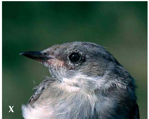
Mystery photograph X (August)