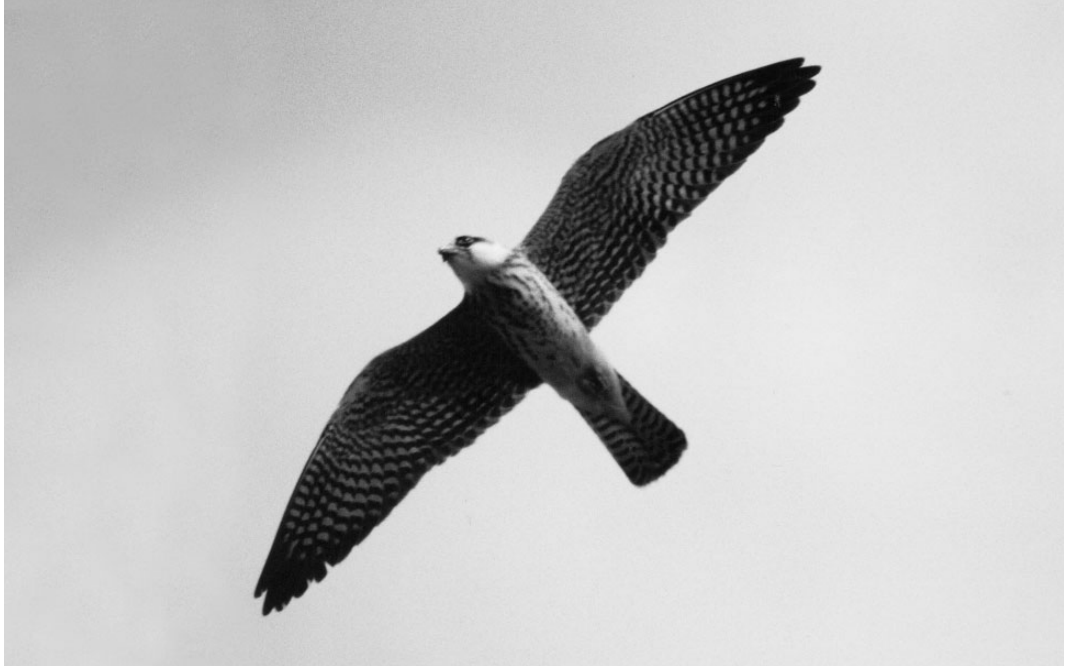
262 Roodpootvalk / Red-footed Falcon Falco vespertinus , juveniel, Eemshaven, Groningen, 30 augustus 2002