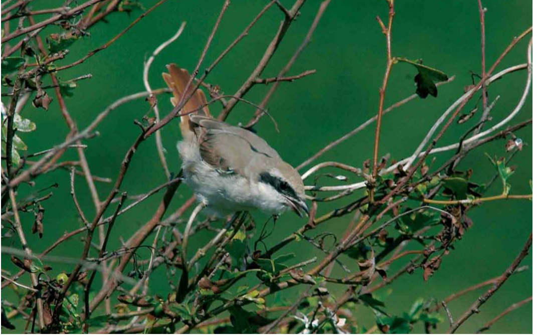
272 Turkestaanse Klauwier / Turkestan Shrike Lanius phoenicuroides , adult mannetje, Bleekersvallei, Texel, Noord-Holland, 14 augustus 2002