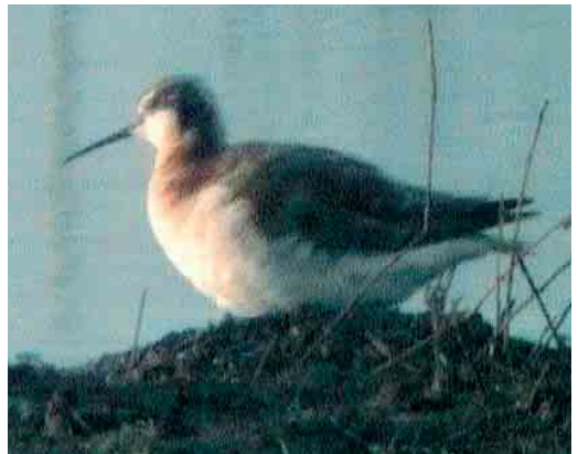
268 Breedbekstrandloper / Broad-billed Sandpiper Limicola falcinellus , juveniel, Zwarte Haan, Friesland, 11 augustus 2002 ( Bas van den Boogaard ) 269 Siberische Strandloper / Sharp-tailed Sandpiper Calidris acuminata , adult, Prunjepolder, Zeeland, 31 juli 2002 ( Marten van Dijk ) 270 Grote Franjepoot / Wilson's Phalarope Phalaropus tricolor , Scherpenissepolder, Tholen, Zeeland, juli 2002 ( Max Berlijn ) 271 Grote Franjepoot / Wilson's Phalarope Phalaropus tricolor , Scherpenissepolder, Tholen, Zeeland, juli 2002 ( Henk de Waard )

15 juli over Enschede, Overijssel. Ook werden in de periode vier Rode Wouwen M. milvus gezien. Twee Vale Gieren Gyps fulvus werden op 4 augustus gemeld bij Hollandse Rading, Utrecht, en op 29 augustus zou er één gefotografeerd zijn in een boom bij Raamsdonksveer, Noord-Brabant. Vanaf 25 augustus verscheen weer een Slangenarend Circaetus gallicus op het Fochtelooërveen, Drenthe/Friesland. Het vrouwtje Steppiekiekendief Circus macrourus van Terschelling werd daar op 29 juli voor het laatst gemeld. Nagekomen nieuws betreft een onvolwassen Steppearend Aquila nipalensis die op 15 juni werd gefotografeerd boven Zouweboezem in de Alblasserwaard, Zuid-Holland. Een lichte vorm Dwergarend Hieraaetus pennatus werd op 29 augustus gemeld van Schiermonnikoog, Friesland. De Havikarend Hieraaetus fasciatus die tot 15 juli op Terschelling verbleef, was niet de enige melding van deze soort. Een op 15 augustus gemelde