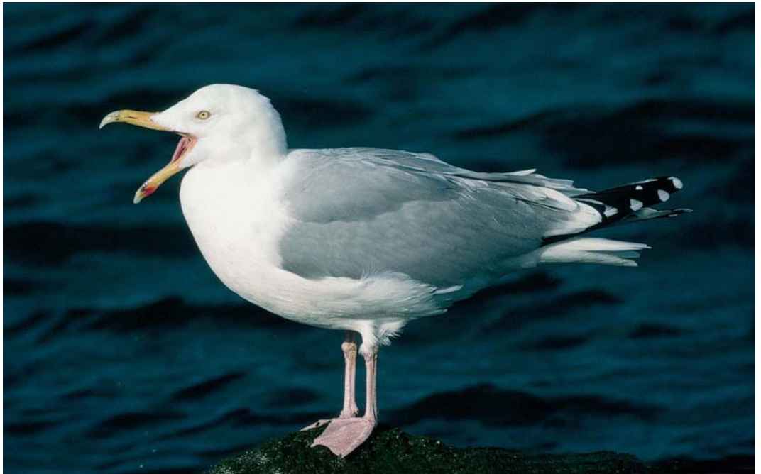
244 American Herring Gull / Amerikaanse Zilvermeeuw Larus smithsonianus , Barnegat, New Jersey, USA, 26 January 1995

It shows a fair degree of variation in wing-tip