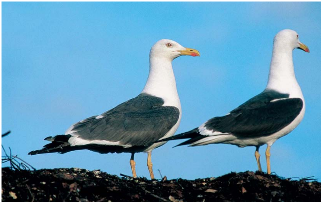
240 Heuglin's Gull / Heuglins Meeuw Larus heuglini , Tampere, Finland, 7 August 2002 (Theodoor Muisse). Note that light incidence makes mantle look darker than it actually is