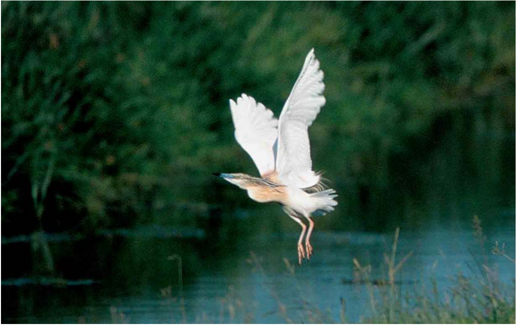
260 Ralreiger / Squacco Heron Ardeola ralloides , adult, Zuid-Schermer, Noord-Holland, 25 juni 2002 (Jan van Holten)