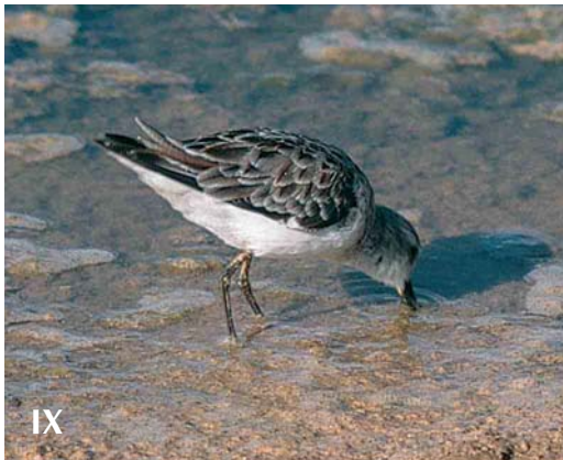
Mystery photograph IX (March)