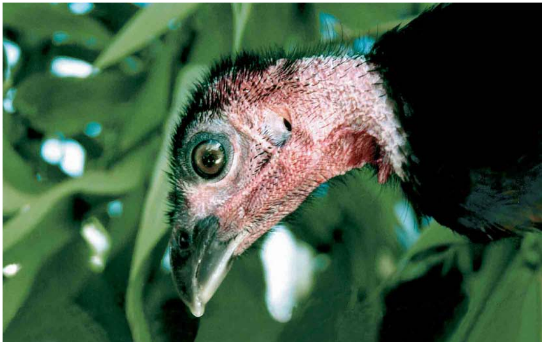
282 Bruijn's Brush-turkey / Bruijns Boshoen Aepyodius bruijnii , probably female, Doom (Sorong), Papua, Indonesia, 12 August 2002. The first photograph of a living bird of this species

managed to find KT who immediately took care of the bird and photographed it.