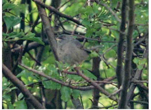
234-235 Sardijnse Grasmus / Marmora's Warbler Sylvia sarda , Duinbergen, Knokke-Heist, West-Vlaanderen, België, 7 mei 1997 (Marnix Vandegehuchte)

delen (van geen belang bij juveniele). De keel van balearica is effen witachtig grijs en contrasteert duidelijk met de donkere teugel en soms met de borst. De keel van sarda is meer effen grijs, bij mannetjes met dezelfde grijs tint als de borst; sarda mist bijgevolg de contrasterend lichte keel van typische balearica . Wat dit kenmerk betreft, komt de Belgische vogel beter overeen met sarda dan met balearica . 4 Snavelkleur Hoewel dit verschil moeilijk in het veld waarneembaar is, heeft balearica gemiddeld een minder zwarte en kleinere zwartachtige punt aan de ondersnavel; bij sommige exemplaren (hoofdzakelijk juveniele) ontbreekt deze zwartachtige ondersnavelpunt; sarda , daarentegen, heeft een meer uitgebreide en duidelijk afgetekende zwartachtige punt. De lichte snavelbasis is meestal geelachtig oranje bij balearica , maar meer roze-achtig bij sarda . De Belgische vogel had een uitgebreide zwartachtige punt aan de ondersnavel (goed voor sarda ) maar een geelachtige snavelbasis. De determinatie als sarda werd bevestigd door Gabriel Gargallo (in litt).