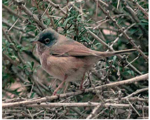
252 Tristram's Warbler / Atlasgrasmus Sylvia deserticola , Gorges du Todra, Tinerhir, Morocco, 10 April 1997 (Arnoud B van den Berg). Note rusty-red throat speckled white and hint of moustachial stripe

This round was not too difficult. From the 78 en-