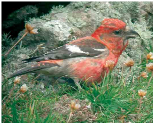
258 Two-barred Crossbill / Witbandkruisbek Loxia leucoptera bifasciata , adult male, Fair Isle, Shetland, Scotland, August 2002