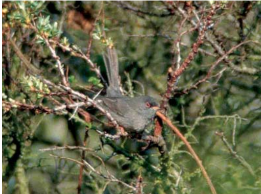
233 Sardijnse Grasmus / Marmora's Warbler Sylvia sarda , Duinbergen, Knokke-Heist, West-Vlaanderen, België, 7 mei 1997 (Johan Buckens)

BOVENDELEN Licht leigrijs, lichter dan bij mannetje Oostelijke Baardgrasmus (waarmee direct te vergelijken). ONDERDELEN Licht leigrijs. Bij bepaald licht met vaag bruin waas. Donkerste gedeelte van onderdelen effen grijze borstband vormend. Lichtste gedeelte gevormd door nauwe lichte strook van buik naar anaalstreek. Geen spoor van rode tinten.