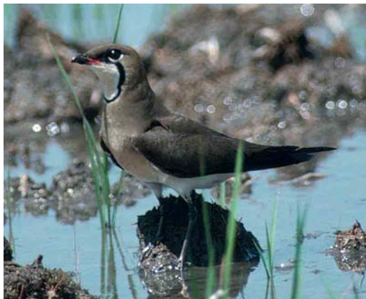
251 Oriental Pratincole / Oosterse Vorkstaartplevier Glareola maldivarum , Perlis, Malaysia, 30 March 1994. Note rich buffish lower breast, dark upperparts, black lores and intermediate amount of red at bill base

show darker upperparts and more closely resemble Oriental Pratincole and Black-winged Pratincole. Therefore, excluding Collared on this feature alone is not safe and other characters require attention. The amount of black feathers on the lores and forehead is normally much smaller in Collared compared with Oriental and Black-winged. Although subject of some variation, the lores in Collared are in general pale brown with only just a tiny amount of black feathers above the bill (cf plate 250). The mystery bird shows extensive black lores and this character rules out Collared as one of the possibilities. In addition, in Collared the tail is often longer and projects beyond the wing tips, which seems not the case in the mystery photograph.