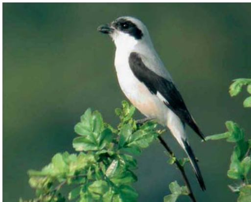
259 Lesser Grey Shrike / Kleine Klapekster Lanius minor , Porsemosen, Ballerup, Denmark, 31 July 2002 (Jens Søgaard Hansen)