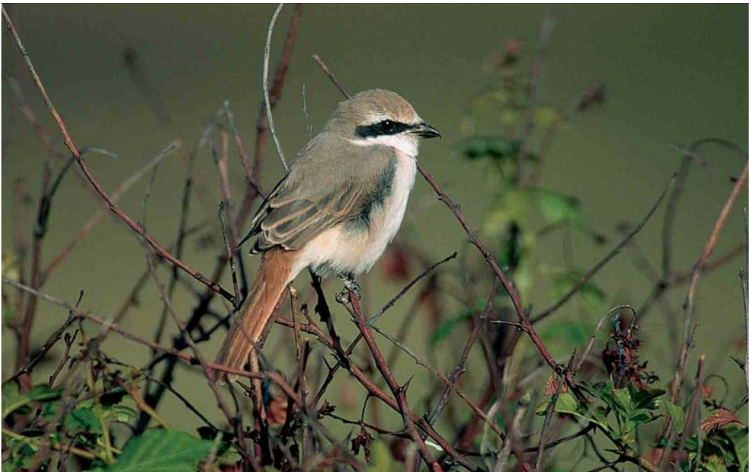
273 Turkestaanse Klauwier / Turkestan Shrike Lanius phoenicuroides , adult mannetje, Bleekersvallei, Texel, Noord-Holland, 23 augustus 2002 ( Marten van Dijl )