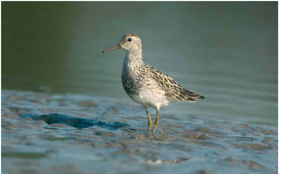
263 Gestreepte Strandloper / Pectoral Sandpiper Calidris melanotos , adult, Meers, Limburg, juli 2002 (Karel Lemmens)