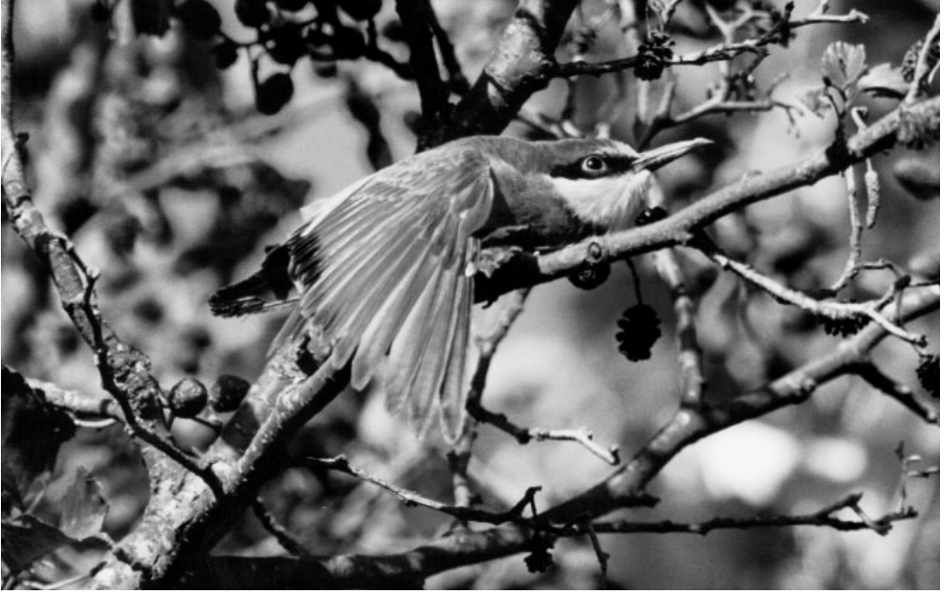
274 Bijeneter / European Bee-eater Merops apiaster , adult, Marnewaard, Lauwersmeer, Groningen, 13 augustus 2002 (Jan den Hertog)