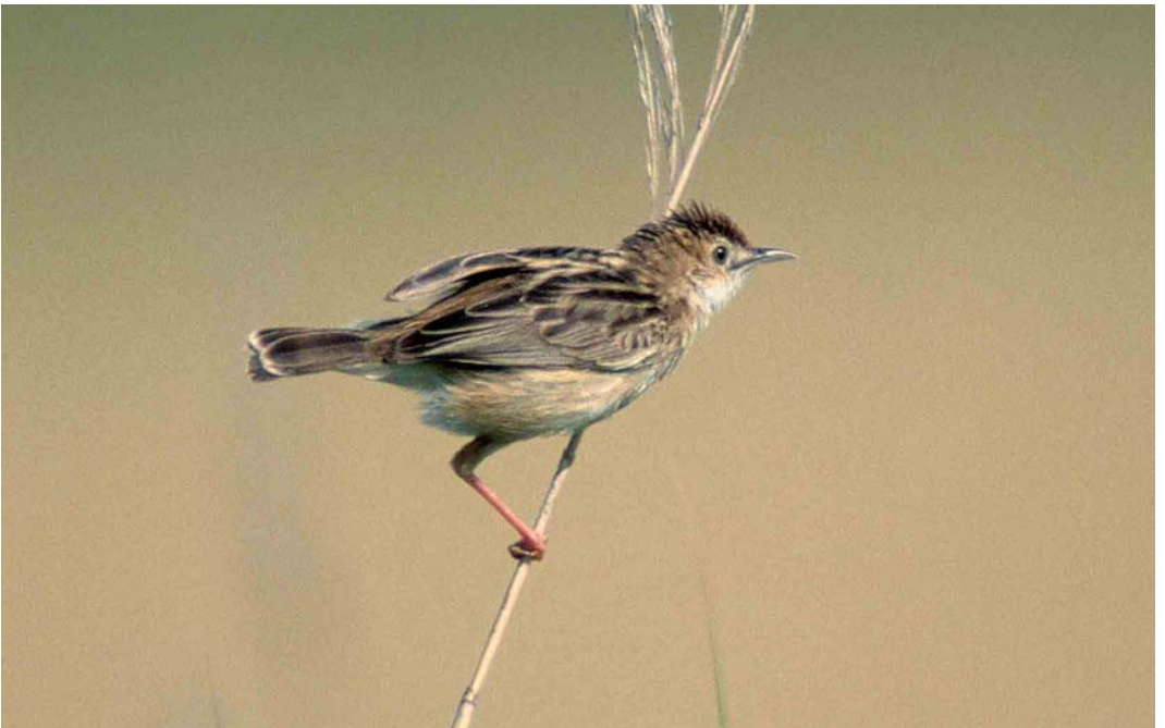
275 Graszanger / Zitting Cisticola Cisticola juncidis , Colijnsplaat, Zeeland, 27 juli 2002