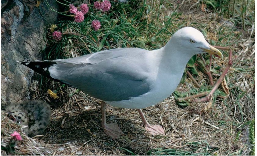
239 Herring Gull / Zilvermeeuw Larus argentatus argentatus , Cap Fréhel, Côtes-d'Armor, France, July 1970 (Fanch Yésou)

graellsii ; see below) in most of its range. Argentatus and fuscus are phenotypically well differentiated (eg, Grant 1982, 1986), having developed isolation behaviour (Brown 1967), so interbreeding remains a relatively rare event (eg, Harris et al 1978, Yésou 1991), and a significant genetic divergence has been found in their mtDNA (Wink et al 1994, Heidrich et al 1996, Crochet 1998, Crochet et al 2002). Their ranking as two species is, therefore, widely accepted.