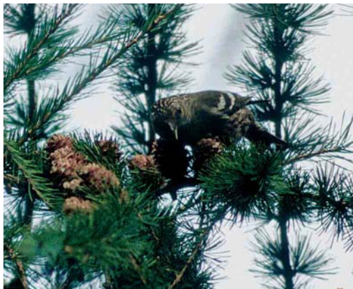
276 Witbandkruisbek / Two-barred Crossbill Loxia leucoptera bifasciata , Selwerderhof, Groningen, Groningen, 20 augustus 2002