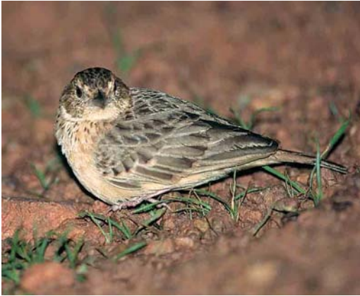
127 Flappet Lark / Ratelleuwerik Mirafra rufocinnamomea buckleyi , Nazinga Game Ranch, Burkina Faso, 27 May 2000. When the rainy season begins, this species is often located by its particular wing beats