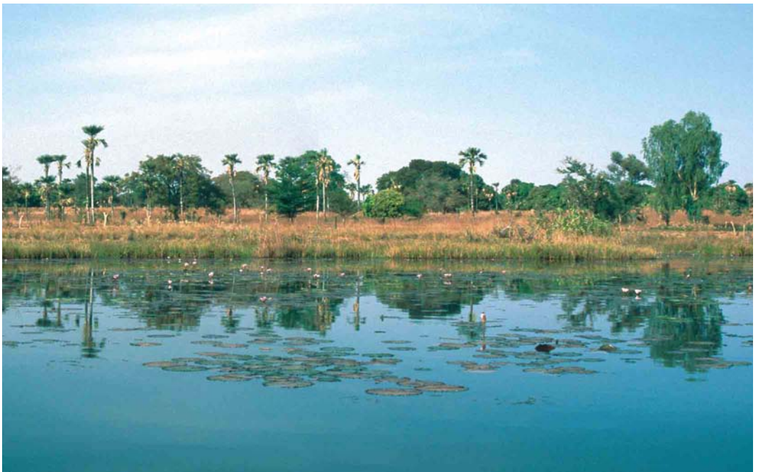
119 Tengrela Marshes, Tengrela, Burkina Faso, 25 February 2001