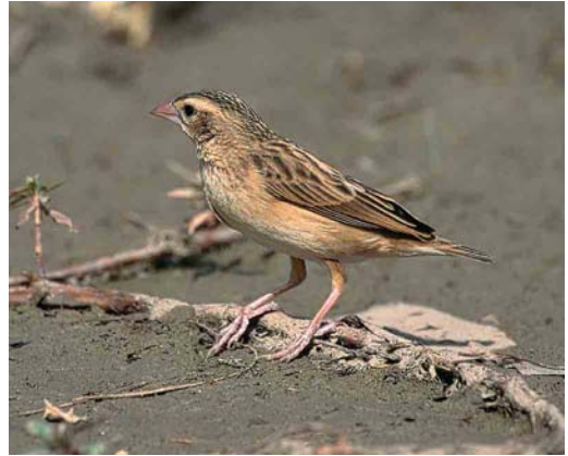
128 Black-winged Bishop / Roodvoorhoofdwever Euplectes hordeaceus , female or immature, Nazinga Game Ranch, Burkina Faso, 6 December 2000 ( Bruno Portier )

ciated islands. Priority sites for Conservation, Birdlife Conservation Series 11, pp 117-125. Serle, W, Morel, G-J & Hartwig, W 1977. A field guide to the birds of West Africa. London. Thonnerieux, Y 1983. Résultats préliminaires sur la présence dans le Sahel voltaïque d'oiseaux migrants en provenance d'Europe. Rapport de mission CORA/IRBET. Thonnerieux, Y 1986. Commentaires sur quelques migrants paléarctiques du Burkina Faso (ex Haute