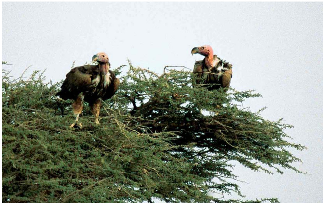
149 Lappet-faced Vultures / Oorgieren Torgos tracheliotus , Shalatein, Egypt, 19 March 2002 (Eric Didner)