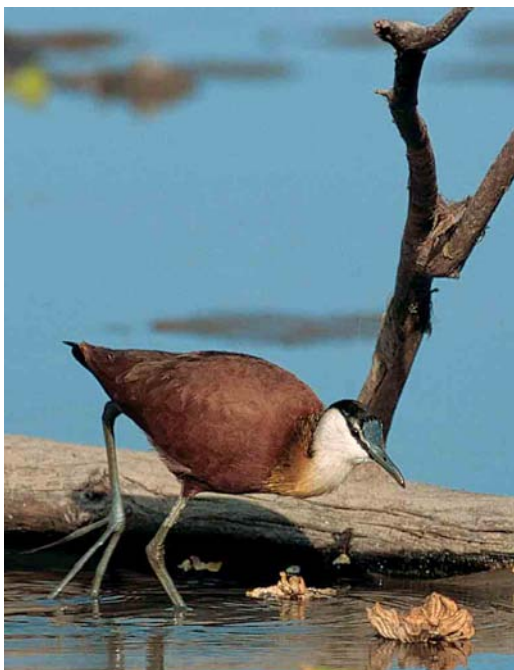
120 African Jacana / Lelieloper Actophilornis africanus, Nazinga Game Ranch, Burkina Faso, 27 November 1999