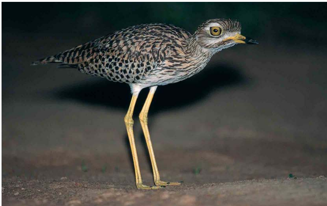
114 Spotted Thick-knee / Kaapse Griel Burhinus capensis maculosus , Nazinga Game Ranch, Burkina Faso, 28 November 2000 (Bruno Portier)