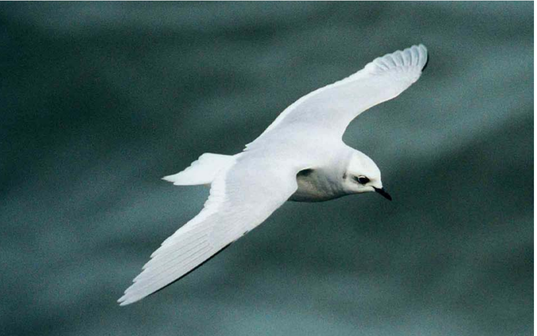
148 Ross's Gull / Ross' Meeuw Rhodostethia rosea , adult, Scarborough, North Yorkshire, England, March 2002

RAPTORS A Turkey Vulture Cathartes aura stayed south of Landskrona, Sweden, from 6 May (for previous sightings in Europe, see Dutch Birding 20: 45, 1998; 22: 113-114, 164, 233, 2000). A record 21 migrating Crested Honey Buzzards Pernis ptilorhynchus were counted near Eilat, Israel, on 30 April; 17 were seen at Lotan on 1 May and eight on 2 May. By 23 May, this spring's total for Israel had risen to 98. Four Cape Verde Kites ' Milvus fasciicauda ' were reported from Boavista in July-August 2001 (one being documented by photographs); moreover, two individuals and six Black Kites M. migrans with two possible hybrids were claimed from Maio in 2001. Possibly the second Yellow-billed Kite M. (m) aegyptius for Israel was reported over the Eilat mountains on 7 May. In the Netherlands, a Black-winged Kite Elanus caeruleus reportedly flew past Ventjagersplaten, Zuid-Holland, on 8 May. An adult was found at Aiguamolls, Girona, Spain, on 15 May. Presumably the first Lammergeier Gypaetus barbatus to be accepted as a wild bird in the Netherlands was an unmarked and unringed immature over Flevoland and Noord-Holland on 2 June and then on Texel, Noord-Holland, later that day and staying to 4 June. Also in the Netherlands, five sightings of Eurasian Griffon Vultures Gyps fulvus on 16-20 May concerned one flying south over the Noord-Holland dunes on 16 May, one over Breskens, Zeeland, on 17 May, two over Veendam, Groningen, on 17 May, one over Marnevaard, Lauwersmeer, on 18 May, and one over