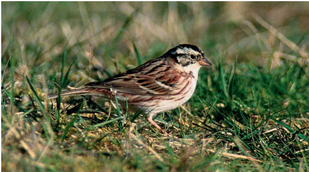
167 Bosgors / Rustic Bunting Emberiza rustica , tweede-kalenderjaar mannetje, De Kennemerduinen, Noord-Holland, 6 april 2002 (Marten van Dijk)

getroffen werd in Bleskensgraaf, Zuid-Holland, was zeker ontsnapt. Op 1 april was een Alpengierzwaluw Apus melba c 30 min ter plaatse boven de Zoute Kwel in de Lauwersmeer, Groningen. Op 27 april vloog een Bijeneter Merops apiaster rond aan bij het Nieuwe Robbengat aan de oostkant van de Lauwersmeer. Hoppen Upupa epops werden ontdekt op 19 april bij het Soerendonks Goor, Noord-Brabant, en op 21 april in langs telpost Parnassia in De Kennemerduinen, Noord-Holland. Een Kortteenleeuwerik Calandrella brachydactyla vloog op 22 april roepend over ten noordoosten van Bergen, Noord-Holland. Een Grote Pieper Anthus richardi was van 10 tot 31 maart (weer) aanwezig op de Maasvlakte, Zuid-Holland. Het aantal van 44 Rouwkwikstaarten Motacilla yarellii op 16 maart bij Rioolwaterzuivering Everstekeoog op Texel is het vermelden waard. Een late Pestvogel Bombycilla garrulus was op 10 maart aanwezig in Heerhugowaard, Noord-Holland. De Waterspreeuwen Cinclus cinclus waren nog aanwezig tot 8 maart in de AW-duinen, Noord-Holland, en tot 9 maart bij de Ketelbrug, Flevoland. Roodborsttapuiten met kenmerken van Aziatische Roodborsttapuit Saxicola maura werden gezien van 25 tot 31 maart op de Brielsegatdam bij Oostvoorne, Zuid-Holland, en op 13 april op de Dwingelose Heide, Drenthe. De Graszanger Cisticola juncidis van het Kennemermeer bij IJmuiden bleef daar in ieder geval tot 2 april. Een andere vloog op 21 april over de Akerdijkse Plassen, Zuid-Holland. Eind april