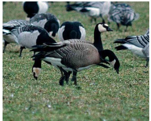
131 Hutchins' Canadese Gans / Hutchins's Canada Goose Branta hutchinsii hutchinsii , met Brandganzen / Barnacle Geese B leucopsis , Bandpolder, Friesland, 25 april 1998 (Roef Mulder) 132 Kleinste Canadese Gans / Cackling Canada Goose Branta hutchinsii minima , met hybride canadse gans x Brandgans / hybrid canada goose x Barnacle Goose B hutchinsii/canadenis x leucopsis en Kolganzen / Greater White-fronted Geese Anser albifrons , Anjummerkolken, Friesland, 13 maart 1998 (Theo Bakker/Cursorius) 133 Kleinste Canadese Gans / Cackling Canada Goose Branta hutchinsii minima , met Brandganzen / Barnacle Geese B leucopsis , Anjummerkolken, Friesland, 9 maart 2000 (Theo Bakker/Cursorius) 134 Kleinste Canadese Gans / Cackling Canada Goose Branta hutchinsii minima , met Brandganzen / Barnacle Geese B leucopsis , Anjummerkolken, Friesland, 2 maart 2000 (Theo Bakker/Cursorius)

pulaties in met name Brittannië en Scandinavië, of van ontsnapte exemplaren. Er werd bovendien nauwelijks opgelet of men te maken had met een taxon van Kleine Canadese Gans (waartoe hutchinsii , leucopareia , minima en taverneri worden gerekend) of Grote Canadese Gans (waartoe canadensis , fulva , interior , maxima , moffitti , occidentalis en parvipes worden gerekend; indeling conform Sangster et al (1999). Deze taxonomische indeling werd recentelijk ondersteund door moleculair onderzoek waaruit bleek dat Kleine Canadese Gans meer verwant is