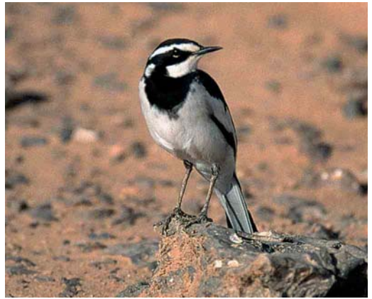
154 Subalpine Warbler / Baardgrasmus Sylvia cantillans , male, Hargen, Noord-Holland, Netherlands, 13 May 2002 155 Pied Stonechat / Zwarte Roodborsttapuit Saxicola caprata , Eilat, Israel, 29 March 2002 156 Franklin's Gull / Franklins Meeuw Larus pipixcan , adult, Banjul, Gambia, 17 January 2002 157 African Pied Wagtail / Afrikaanse Bonte Kwikstaart Motacilla aguimp , Abu Simbel, Egypt, 24 March 2002

reported from Beilen, Drenthe, on 20 April. An adult at Oldenburg, Niedersachsen, Germany, on 11 April also wore a Finnish colour-ring. A first-winter Iceland Gull L. glaucooides was (still) at Santa Cruz das Flores, Azores, on 5 April. A second-winter or adult Ross's Gull Rhodostethia rosea stayed at Peterhead, Aberdeenshire, Scotland, on 9-11 March. In England, adults were seen in Cornwall and Devon until 5 March; at Scarborough, North Yorkshire, from 16 March to 4 April; and at Blacktoft Sands, East Yorkshire, on 31 March; and a first-winter was found in Gloucestershire on 16 April. In the Netherlands, an immature was reported from Grote Vlak, Texel, Noord-Holland, on 23 April. In Shetland, Scotland, a first-winter was present at Mainland from 10 May onwards. An adult was seen in Hrutafjörður, Iceland, on 22 May. Seven Lesser Crested Terns Sterna bengalensis at Tarifa