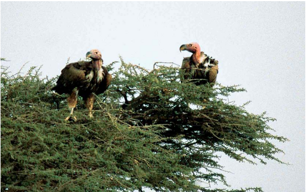
149 Lappet-faced Vultures / Oorgieren Torgos tracheliotus , Shalatein, Egypt, 19 March 2002 (Eric Didner)