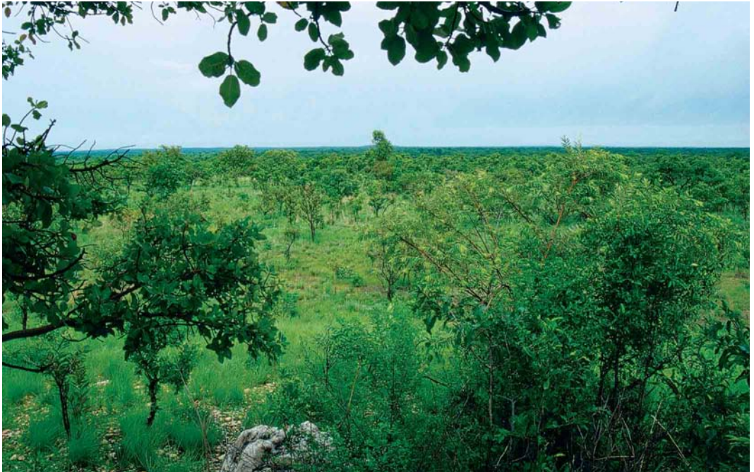
118 Typical view of tree savanna in mid-July, Nazinga Game Ranch, Burkina Faso, 12 July 1999 ( Bruno Portier )