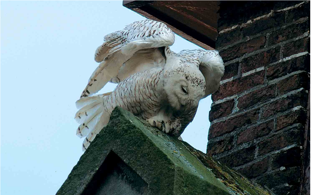
162 Sneeuwuil / Snowy Owl Nyctea scandiaca , eerste-winter mannetje, Hippolytushoef, Noord-Holland, 19 april 2002