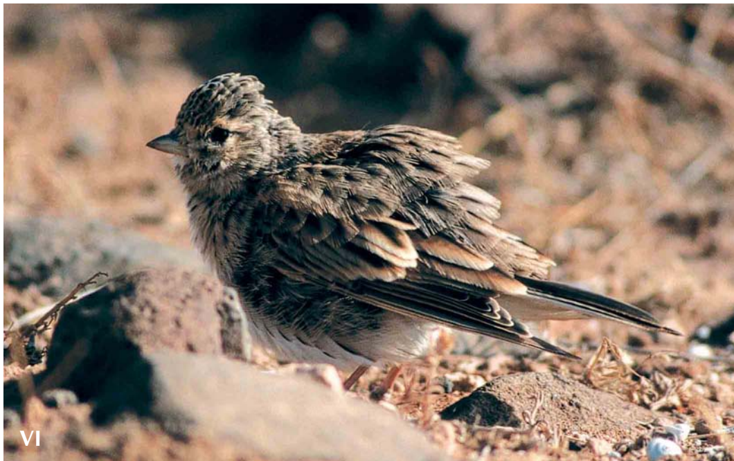
Mystery photograph VI (August)

So, now we are left with Green and Solitary Sandpiper. The easiest character to separate these two species is the dark rump of Solitary, which is white in Green. This character, however, cannot be seen on the mystery photograph because the rump is covered by the wings. Another feature of adult summer Solitary are the streaked fore flanks. In this photograph, this feature cannot be judged safely but any streaking seems to be missing. A more subtle character of Solitary Sandpiper can be found on the outermost tail-feathers, which can be seen on the mystery photograph. In Green, the two outermost tail-feathers (t5-6) are white, frequently with a small subterminal dark spot on the outer web. In Solitary, the barring on the tail reaches the outermost tail-feather with one or two dark brown lines. In addition, the tail-bars are somewhat broader in Green than in Solitary. As can be seen on the photograph, the mystery bird shows at least two dark bars on its outer tail-feather, thus fitting Solitary. Loss of its outer tail-feathers is not very likely as the bird is photographed in May and Solitary renews its tail-feathers in a complete moult after breeding, mostly in their wintering quarters. Occasionally, the central tail-feathers