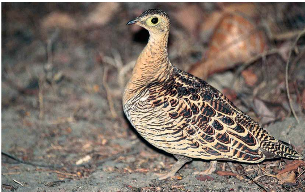
115 Four-banded Sandgrouse / Vierbandzandhoen Pterocles quadricinctus , female, Nazinga Game Ranch, Burkina Faso, 7 March 2000