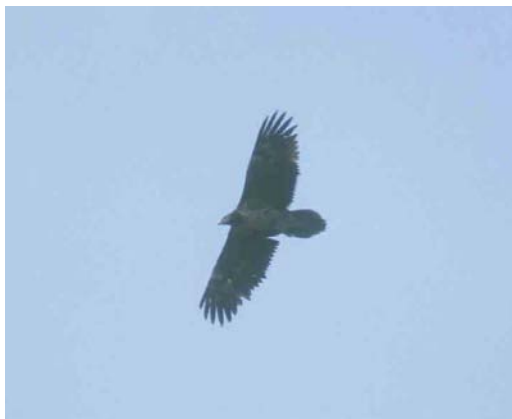
169 Lammergier / Lammergeier Gypaetus barbatus , onvolwassen, Texel, Noord-Holland, 3 juni 2002 (Marten van Dijl)

Eerdere gevallen van in gevangenschap geboren en