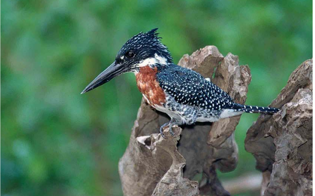
124 Giant Kingfisher / Afrikaanse Reuzenijsvogel Megaceryle maxima, Nazinga Game Ranch, Burkina Faso, 28 May 2000