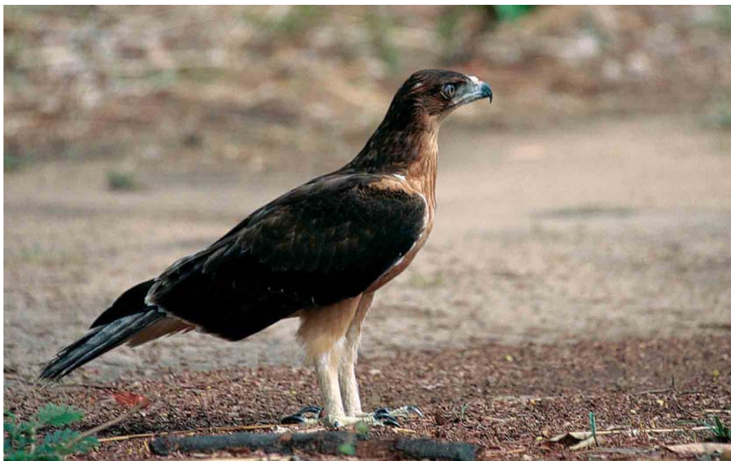
113 African Hawk Eagle / Afrikaanse Havikarend Hieraaetus spilogaster , juvenile, Nazinga Game Ranch, Burkina Faso, 14 May 2000 (Bruno Portier)