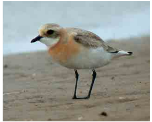
150 Pacific Golden Plover / Aziatische Goudplevier Pluvialis fulva , Harger- en Pettemerpolder, Noord-Holland, Netherlands, 14 April 2002 151 Great Snipe / Poelsnip Gallinago media , Maassluis, Zuid-Holland, Netherlands, 16 May 2002 152-153 Lesser Sand Plover / Mongoolse Plevier Charadrius mongolus , Rimac, Lincolnshire, England, May 2002

ladelphia was seen at Le Croisic, Loire-Atlantique, France, on 13 March. In England, the adult staying until 9 March at Millbrook, Cornwall, turned up at Paghham, West Sussex, on 16 March where it remained until at least 25 March. In Scotland, an adult was found on South Uist, Outer Hebrides, Scotland, on 28 April. In Spain, the first Audouin's Gull L audouinii for Cantabria was a third-summer at Somo in Santander bay from 5 May. In France, singles were seen at Lapalme, Aude, on 24 April (second-summer), at Portiraques, Hérault, on 1 May and at the Camargue on 16 May. In Sardinia, up to 4000 Slender-billed Gulls L genei were counted at Molentargius on 14 April. On 15 May, one was reported at Wollmatinger Ried, Baden-Württemberg, Germany. On Flores, Azores, not only four first-winter Ring-billed Gulls L delawarensis but also a first-winter American Herring Gull L smithsonianus was observed at Lagoa Rasa on 16 April.