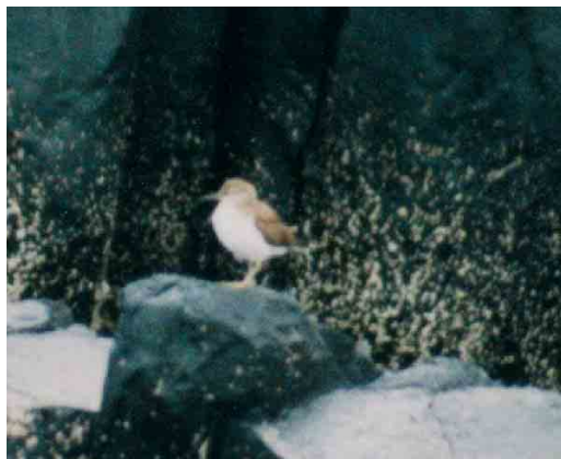
140 Spotted Sandpiper / Amerikaanse Oeverloper Actitis macularia , Île de Gorée, off Dakar, Senegal, 20 February 2001 (Cornelie van der Hoop)

This record constitutes the first for Senegal and the third for sub-Saharan mainland Africa. Previous sub-Saharan records concerned adults photographed in central Kenya on 4-5 September 1999 and in south-western Cameroon on 21 April 2000 (Bishop & Bishop 2001, Languy & Lambin 2001). In the south-western Western Palearctic, this Nearctic counterpart of Common