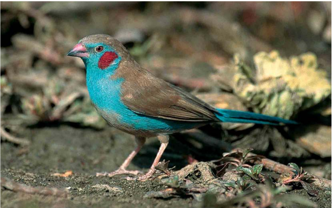
125 Red-cheeked Cordonbleu / Blaufazantje Uraeginthus bengalus , male, Nazinga Game Ranch, Burkina Faso, 12 February 2000 (Bruno Portier)