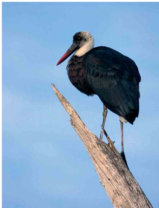
123 Woolly-necked Stork / Bisschopsooievaar Ciconia episcopus, Nazinga Game Ranch, Burkina Faso, 29 May 2000

plain that provides food for a Hippo herd which occupies the lake, sometimes sharing the shores with African Elephants from the nearby Maro Reserve.