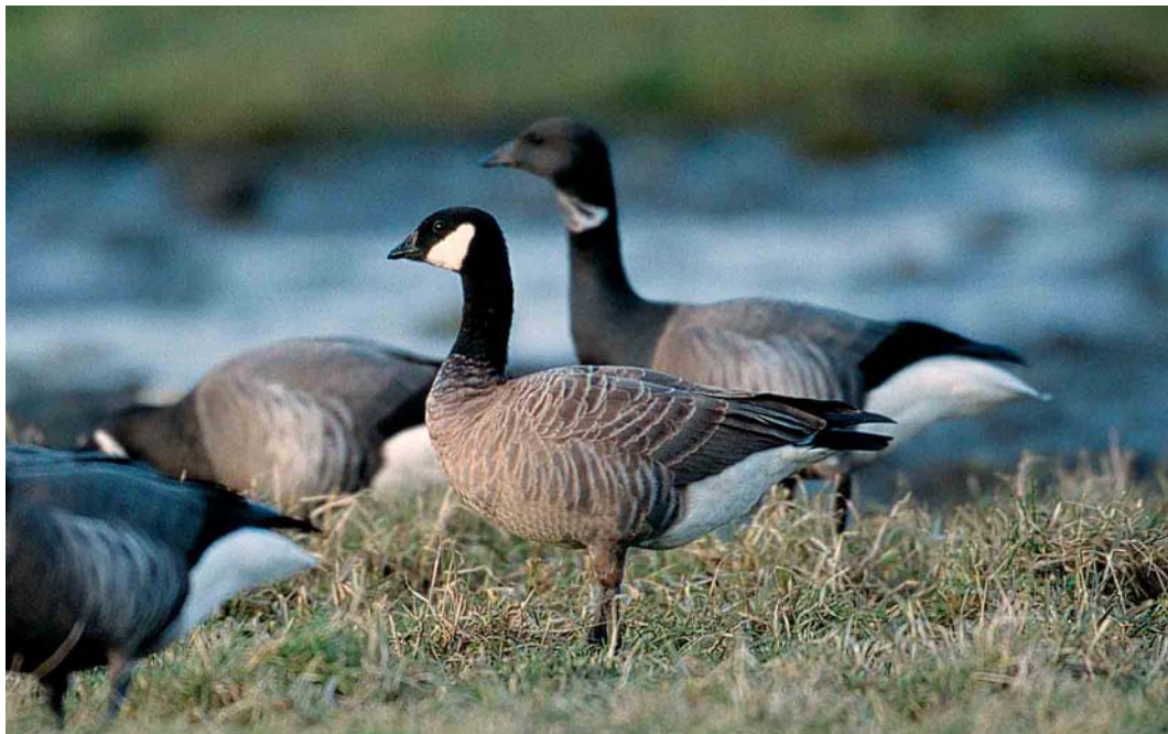
135 Kleinste Canadese Gans / Cackling Canada Goose Branta hutchinsii minima , met Rotganzen / Dark-bellied Brent Geese B bernicla , Prunjepolder, Zeeland, februari 1998 (Jan van Holten)

Als gevolg van het besluit van de Commissie Systematiek Nederlandse Avifauna (CSNA) om het canadese-ganzencomplex te beschouwen als bestaande uit twee soorten, waarbij hutchinsii wordt ingedeeld bij Kleine Canadese Gans en parvipes bij Grote Canadese Gans (Sangster et al 1999), was het voor de CDNA noodzakelijk om