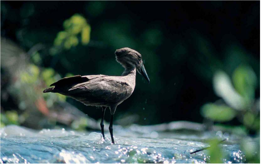
110 Hamerkop / Hamerkop Scopus umbretta, Nazinga Game Ranch, Burkina Faso, 20 November 1999 111 White-backed Night Heron / Witrugkwak Gorsachius leuconotus, juvenile, Nazinga Game Ranch, Burkina Faso, 27 May 2000. One of the potential highlights. This very elusive and nocturnal species was recently discovered in Burkina Faso