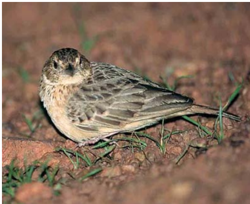
127 Flappet Lark / Ratelleuwerik Mirafra rufocinnamomea buckleyi , Nazinga Game Ranch, Burkina Faso, 27 May 2000 ( Bruno Portier ). When the rainy season begins, this species is often located by its particular wing beats