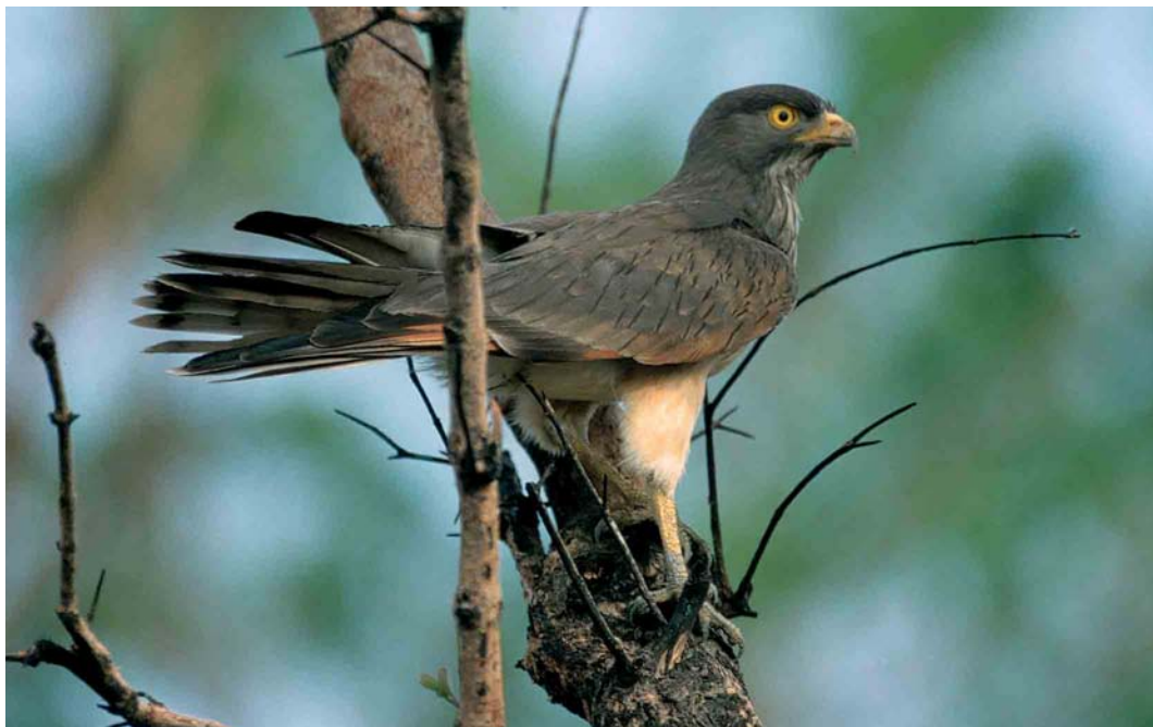
112 Grasshopper Buzzard / Sprinkhaanbuizerd Butastur rufipennis, Gonsé Classified Forest, Burkina Faso, 6 May 2000