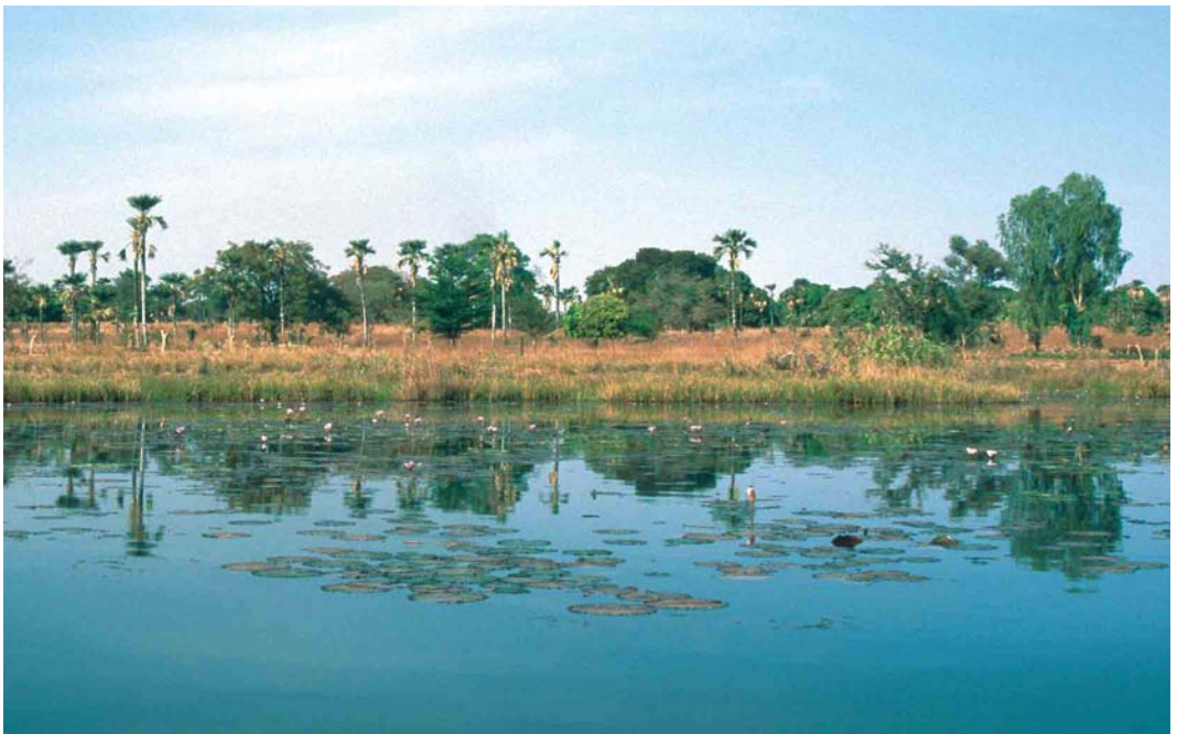
119 Tengrela Marshes, Tengrela, Burkina Faso, 25 February 2001