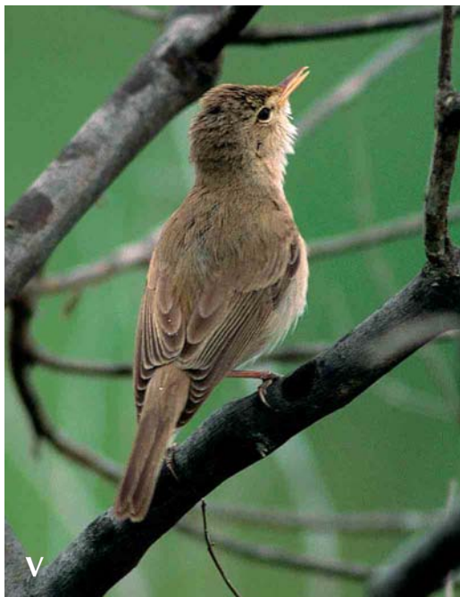
Mystery photograph V (May)

So, now we are left with Green and Solitary Sandpiper. The easiest character to separate these two species is the dark rump of Solitary, which is white in Green. This character, however, cannot be seen on the mystery photograph because the rump is covered by the wings. Another feature of adult summer Solitary are the streaked fore flanks. In this photograph, this feature cannot be judged safely but any streaking seems to be missing. A more subtle character of Solitary Sandpiper can be found on the outermost tail-feathers, which can be seen on the mystery photograph. In Green, the two outermost tail-feathers (t5-6) are white, frequently with a small subterminal dark spot on the outer web. In Solitary, the barring on the tail reaches the outermost tail-feather with one or two dark brown lines. In addition, the tail-bars are somewhat broader in Green than in Solitary. As can be seen on the photograph, the mystery bird shows at least two dark bars on its outer tail-feather, thus fitting Solitary. Loss of its outer tail-feathers is not very likely as the bird is photographed in May and Solitary renews its tail-feathers in a complete moult after breeding, mostly in their wintering quarters. Occasionally, the central tail-feathers