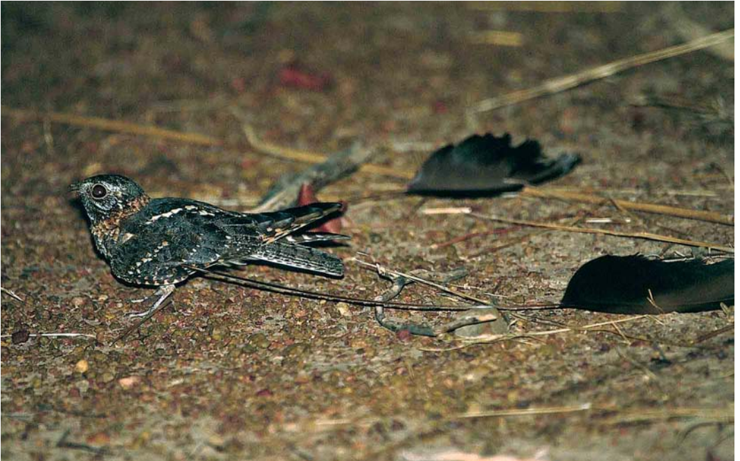
116 Standard-winged Nightjar / Viervleugelnachtzwaluw Macrodipteryx longipennis , male, Nazinga Game Ranch, Burkina Faso, 25 May 2000 ( Bruno Portier ). Probably the most-wanted and enigmatic bird of the area. It will be encountered at night on sandy tracks, except at the very heart of the dry season 117 Long-tailed Nightjar / Mozambikaanse Nachtzwaluw Caprimulgus climacurus , Nazinga Game Ranch, Burkina Faso, 25 May 2000 ( Bruno Portier )