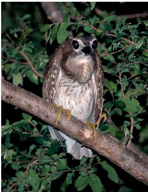
122 White-backed Night Heron / Witrugkwak Gorsachius leuconotus , juvenile, Nazinga Game Ranch, Burkina Faso, 27 May 2000 (Bruno Portier)