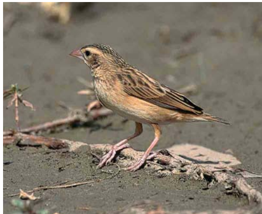
128 Black-winged Bishop / Roodvoorhoofdwever Euplectes hordeaceus , female or immature, Nazinga Game Ranch, Burkina Faso, 6 December 2000

ciated islands. Priority sites for Conservation, Birdlife Conservation Series 11, pp 117-125. Serle, W, Morel, G-J & Hartwig, W 1977. A field guide to the birds of West Africa. London. Thonnerieux, Y 1983. Résultats préliminaires sur la présence dans le Sahel voltaïque d'oiseaux migrants en provenance d'Europe. Rapport de mission CORA/IRBET. Thonnerieux, Y 1986. Commentaires sur quelques migrants paléarctiques du Burkina Faso (ex Haute