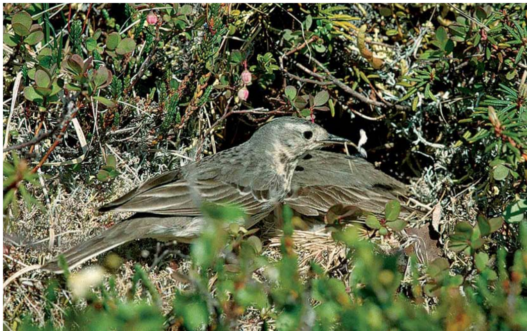
138-139 Siberian Buff-bellied Pipits / Siberische Waterpiepers Anthus rubescens japonicus , upper Anadyr area, Russia, June 1994