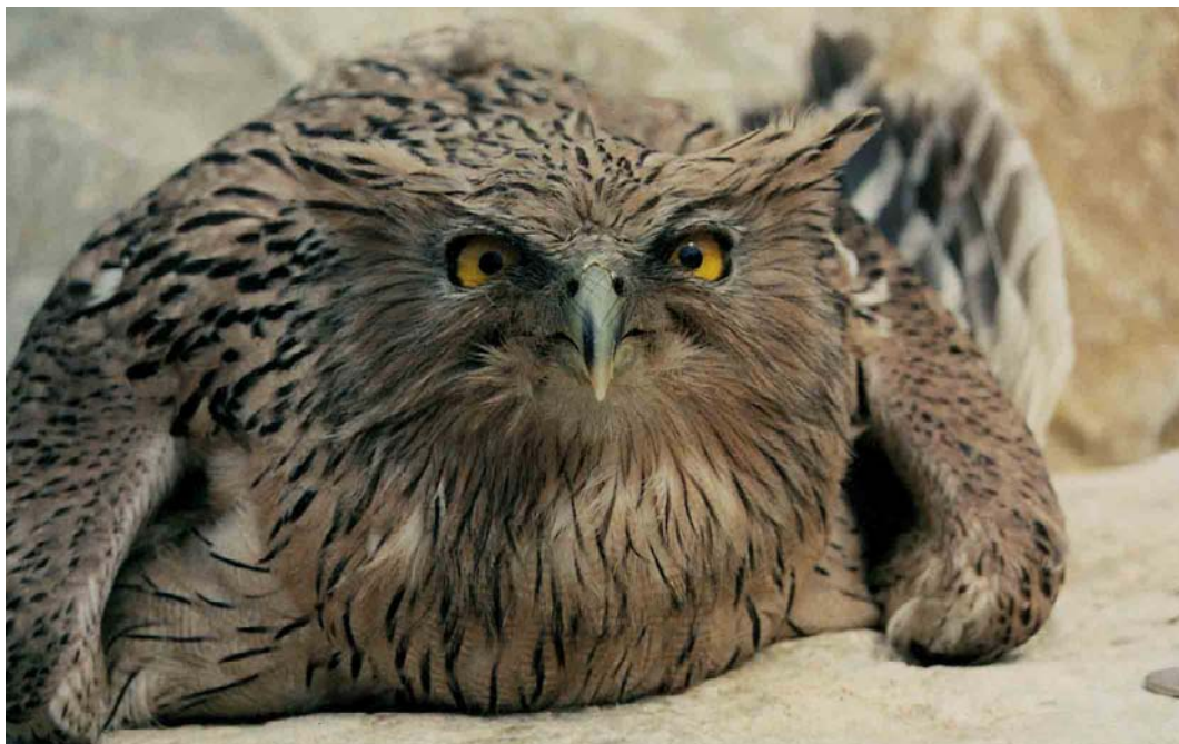
143-144 Brown Fish Owl / Bruine Visuil Ketupa zeylonensis , Adana region, Turkey, late April 1990