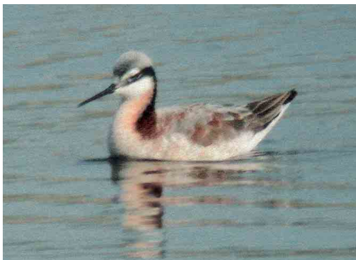
168 Grote Franjepoot / Wilson's Phalarope Phalaropus tricolor , vrouwtje, Bredene, West-Vlaanderen, 24 april 2002 (Koen Verbanck)