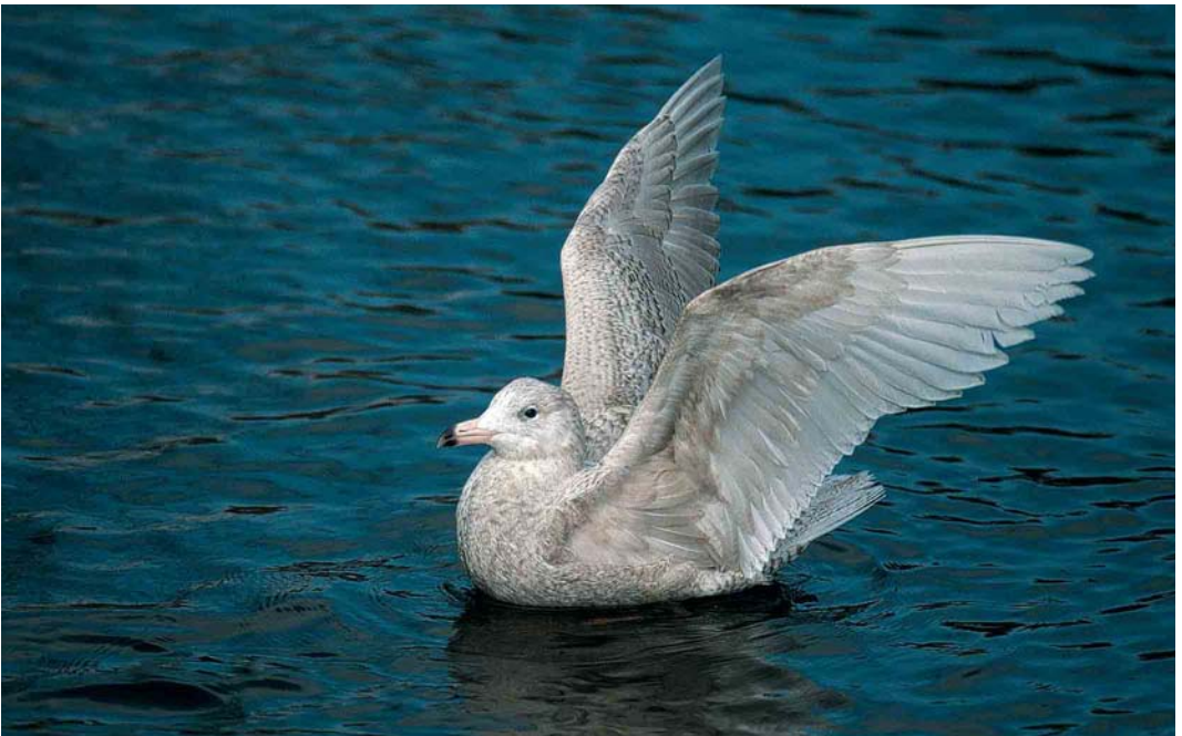
163 Grote Burgemeester / Glaucous Gull Larus hyperboreus , eerste-winter, Schiedam, Zuid-Holland, 23 maart 2002