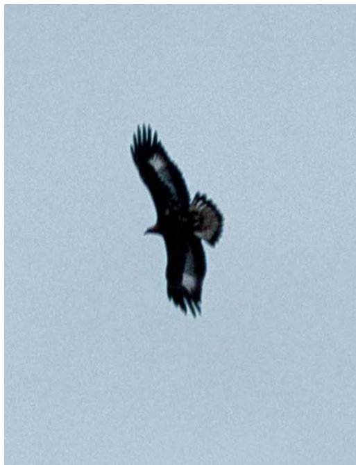
159 Alpengierzwaluw / Alpine Swift Apus melba , Lauwersmeer, Groningen, 1 april 2002 (Eric Koops) 160 Steenarend / Golden Eagle Aquila chrysaetos , tweede-kalenderjaar, Amen, Drenthe, 6 maart 2002 (Roef Mulder) 161 Grote Zilverreigers / Great Egrets Casmerodius albus , Veenhuizerstukken, Groningen, 13 maart 2002 (Eric Koops)