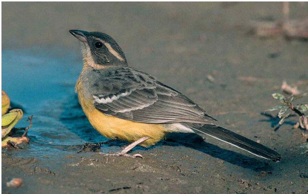
126 Cabanis's Bunting / Cabanis' Gors Emberiza cabanisi , female, Nazinga Game Ranch, Burkina Faso, 12 February 2000 (Bruno Portier)