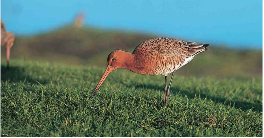
146 'Eureka!' the visitor said, matching the Black-tailed Godwit to an illustration in the book. 'Brick-red throat and chest, heavily patterned upperparts and a yellow bill base. Have a look dear – it's a Red-throated Pipit.'

the household now wish to see the star bird himself, but he also wants to show it to his four kids, one of whom is sucking a dummy and has been clattering into tripod legs since arriving.