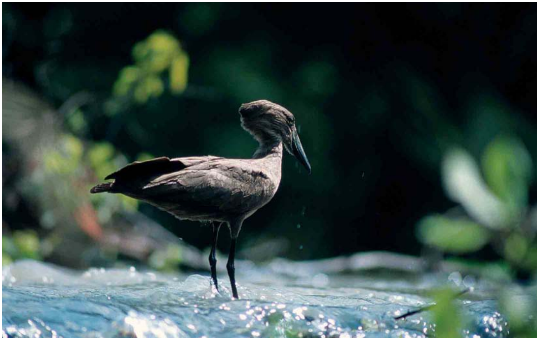
110 Hamerkop / Hamerkop Scopus umbretta, Nazinga Game Ranch, Burkina Faso, 20 November 1999 111 White-backed Night Heron / Witrugkwak Gorsachius leuconotus, juvenile, Nazinga Game Ranch, Burkina Faso, 27 May 2000 One of the potential highlights. This very elusive and nocturnal species was recently discovered in Burkina Faso