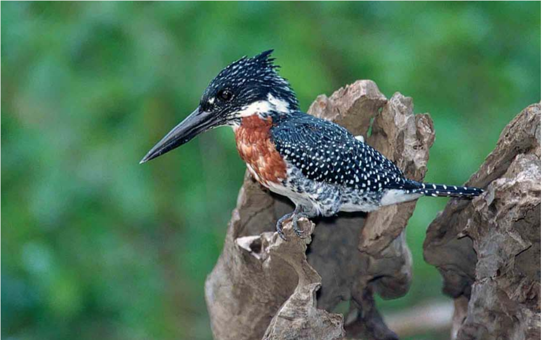
124 Giant Kingfisher / Afrikaanse Reuzenijsvogel Megaceryle maxima, Nazinga Game Ranch, Burkina Faso, 28 May 2000