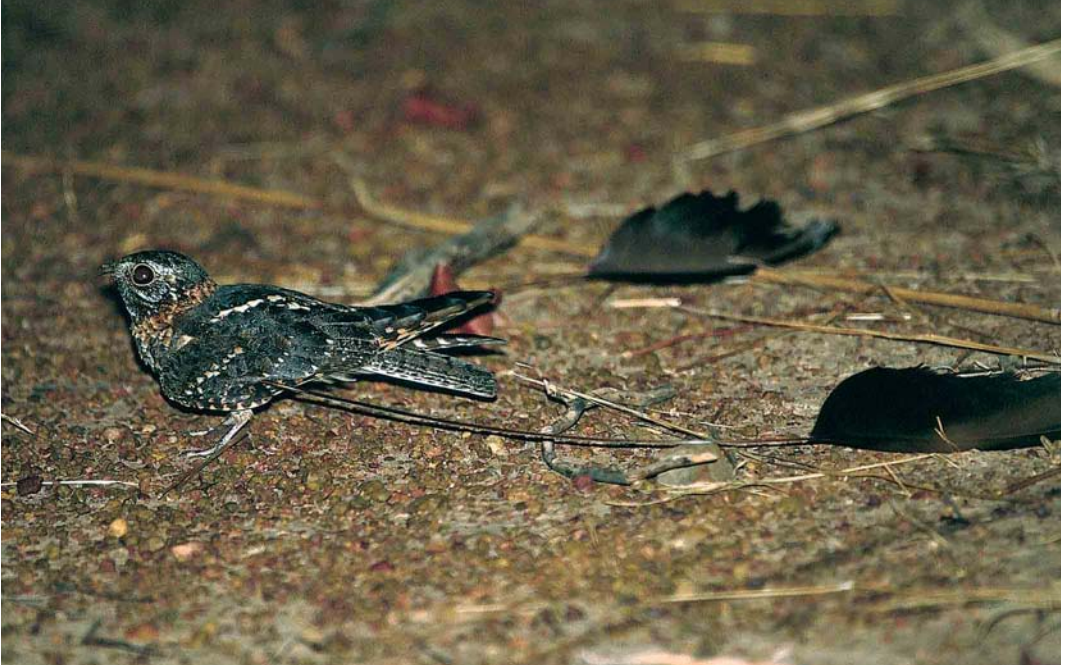
116 Standard-winged Nightjar / Viervleugelnachtzwaluw Macrodipteryx longipennis , male, Nazinga Game Ranch, Burkina Faso, 25 May 2000 ( Bruno Portier ). Probably the most-wanted and enigmatic bird of the area. It will be encountered at night on sandy tracks, except at the very heart of the dry season 117 Long-tailed Nightjar / Mozambikaanse Nachtzwaluw Caprimulgus climacurus , Nazinga Game Ranch, Burkina Faso, 25 May 2000 ( Bruno Portier )