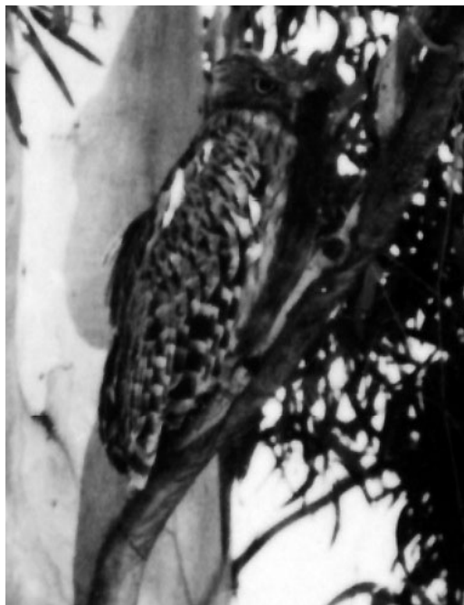
141-142 Brown Fish Owl / Bruine Visuil Ketupa zeylonensis , Hammat Gader area, Israel, August 1975 ( Giora Ilany )

one photographed near the Sea of Galilee in spring 1980. These observations, however, were not listed in Shirihai (1996) and must be considered unsubstantiated (Nir Sapir in litt). Special surveys to find this species in 1983-84 were unsuccessful and the species is now considered extinct (Schlütter 1987, 1988, Shirihai 1996). The chances that undiscovered birds still remain in this relatively small and rather densely populated area must be nil.