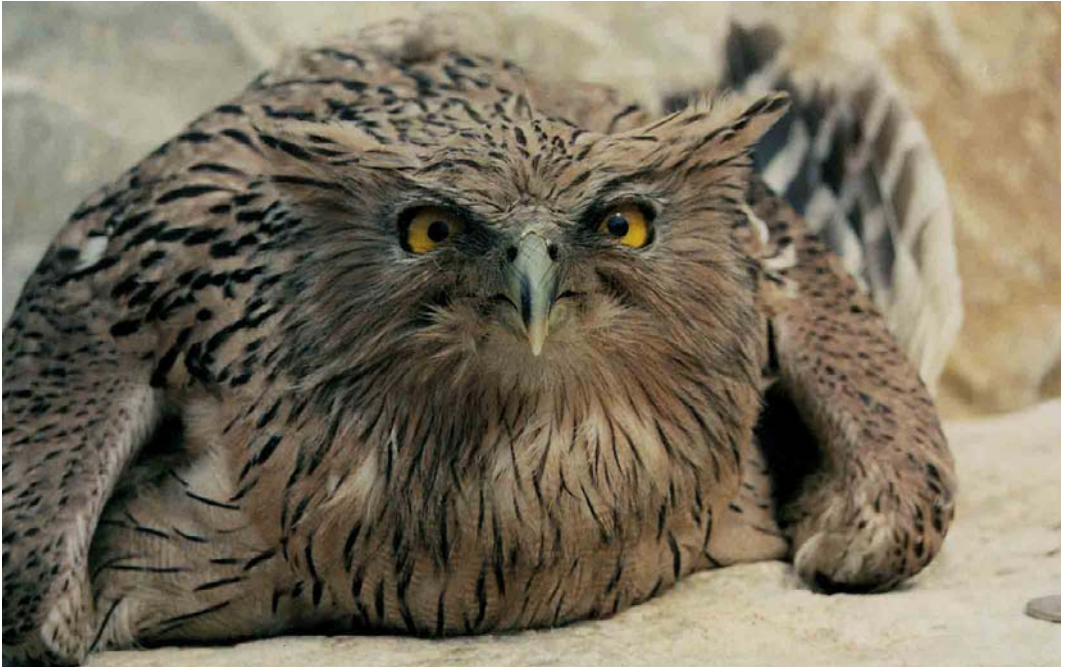
143-144 Brown Fish Owl / Bruine Visuil Ketupa zeylonensis , Adana region, Turkey, late April 1990