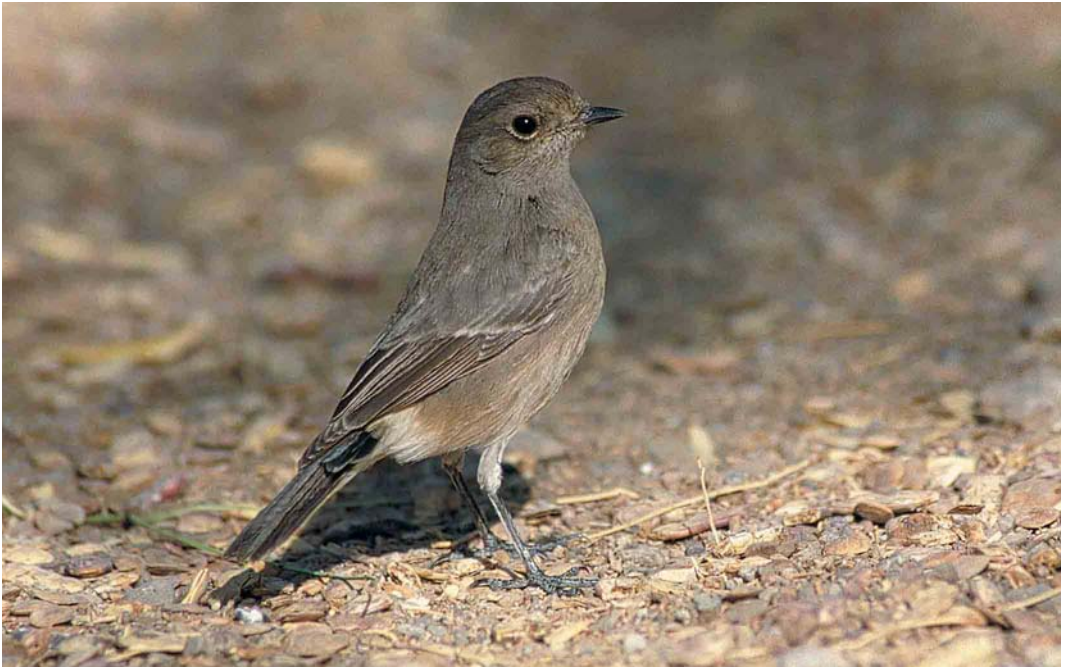
38 Pied Bushchat / Zwarte Roodborsttapuit Saxicola caprata , first-winter female, Eilat, Israel, November 2001