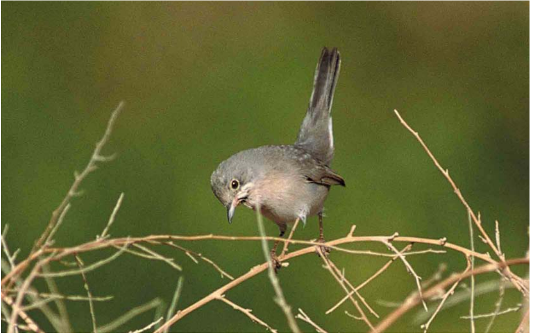
37 Ménétries's Warbler / Ménétries' Zwartkop Sylvia mystacea , Eilat, Israel, November 2001 (Killian Mullarney)