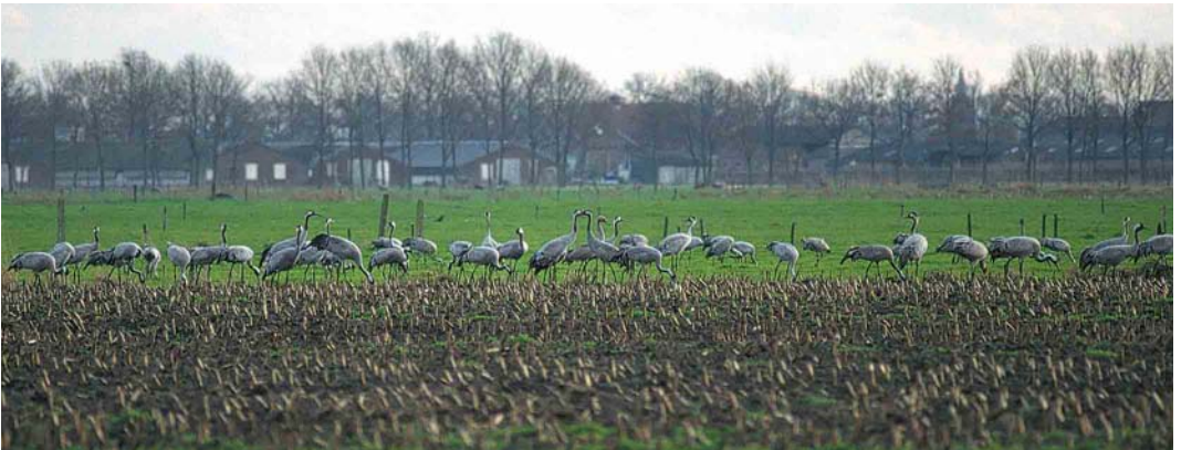
132 Koningseider / King Eider Somateria spectabilis , tweede-winter mannetje, Texel, Noord-Holland, 1 januari 2001 (Ruud E Brouwer) 133 Huiskraai / House Crow Corvus splendens , Renesse, Zeeland, 5 februari 2001 (Arnoud B van den Berg) 134 Ringsnavelmeeuw / Ring-billed Gull Larus delawarensis , adult winter, Goes, Zeeland, 7 januari 2001 (Peter L Meiningen) 135 Koereiger / Cattle Egret Bubulcus ibis , Mariapolder, Wissenkerke, Zeeland, 20 januari 2001 (Gerwin Geertse) 136 Kraanvogels / Common Cranes Grus grus , Nederweert, Limburg, 8 december 2000 (Max Berlijn)