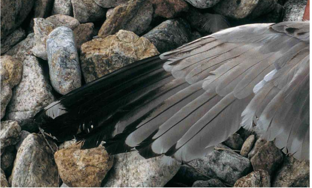
99 Mongolian Gull / Mongoolse Meeuw Larus (cachinnans) mongolicus , (sub)adult, upperwing, Lake Baikal, Siberia, Russia, early June 1992 ( Pierre Yésou ). This bird shows very dark wing-tip pattern, without white mirror on p9, and with many dark markings on outer coverts. Although bird was trapped at nest, its advanced moult stage (growing inner primaries and in particular fresh unmarked outer median coverts contrasting with older, brown-tinged, surrounding feathers) suggests that it has not yet reached fully adult plumage 100 Mongolian Gull / Mongoolse Meeuw Larus (cachinnans) mongolicus , adult, underwing, Lake Baikal, Siberia, Russia, May 1992 ( Pierre Yésou ). Note contrast between mid-grey remiges, paler grey greater and median coverts, and white lesser coverts. Shadow is partly masking pale grey tips to primaries that appear white and translucent when seen from below in flight