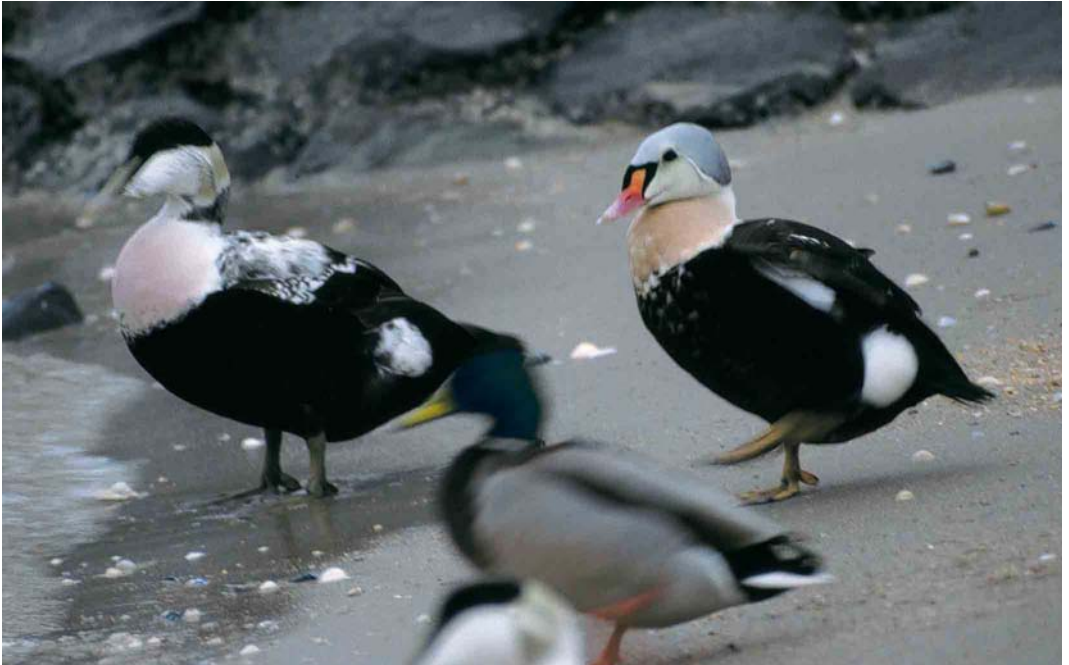
127 Koningseider / King Eider Somateria spectabilis , tweede-winter mannetje, met Eider / Common Eider S. mollissima , Texel, Noord-Holland, 15 februari 2001