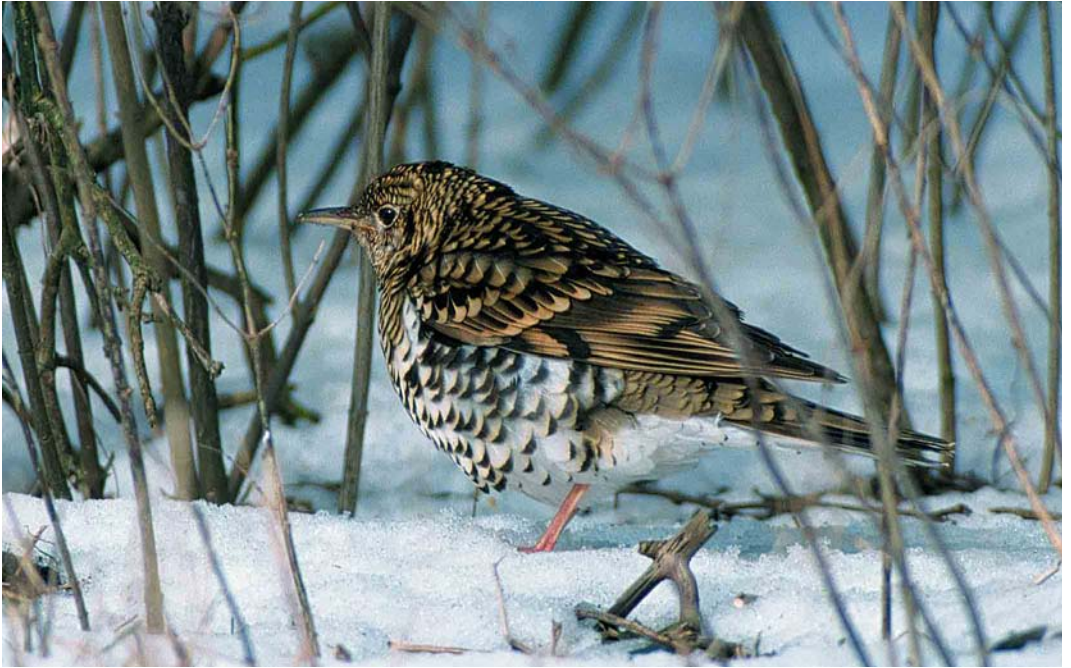
121 White's Thrush / Goudlijster Zoothera aurea , Skårup, Thisted, Nordjylland, Denmark, 6 March 2001 122 White's Thrush / Goudlijster Zoothera aurea , Skårup, Thisted, Nordjylland, Denmark, 5 March 2001. Aged as first-winter by outermost retained juvenile greater covert which is more rusty tinged than renewed other greater coverts