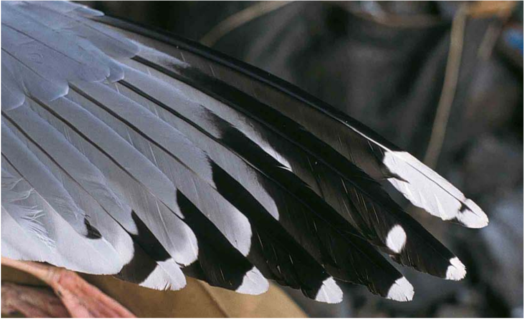
97 Mongolian Gull / Mongoolse Meeuw Larus (cachinnans) mongolicus , adult, upperwing, Lake Baikal, Siberia, Russia, June 1992 (Pierre Yésou). Less common wing-tip pattern. Note incomplete subterminal black bar on p10