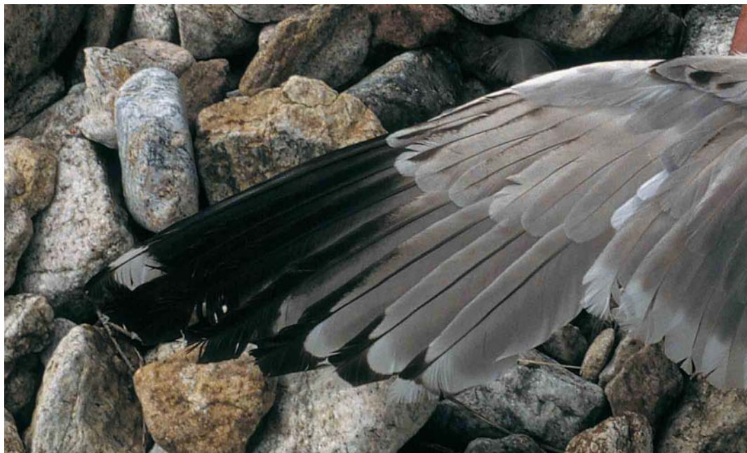
99 Mongolian Gull / Mongoolse Meeuw Larus (cachinnans) mongolicus , (sub)adult, upperwing, Lake Baikal, Siberia, Russia, early June 1992 ( Pierre Yésou ). This bird shows very dark wing-tip pattern, without white mirror on p9, and with many dark markings on outer coverts. Although bird was trapped at nest, its advanced moult stage (growing inner primaries and in particular fresh unmarked outer median coverts contrasting with older, brown-tinged, surrounding feathers) suggests that it has not yet reached fully adult plumage 100 Mongolian Gull / Mongoolse Meeuw Larus (cachinnans) mongolicus , adult, underwing, Lake Baikal, Siberia, Russia, May 1992 ( Pierre Yésou ). Note contrast between mid-grey remiges, paler grey greater and median coverts, and white lesser coverts. Shadow is partly masking pale grey tips to primaries that appear white and translucent when seen from below in flight