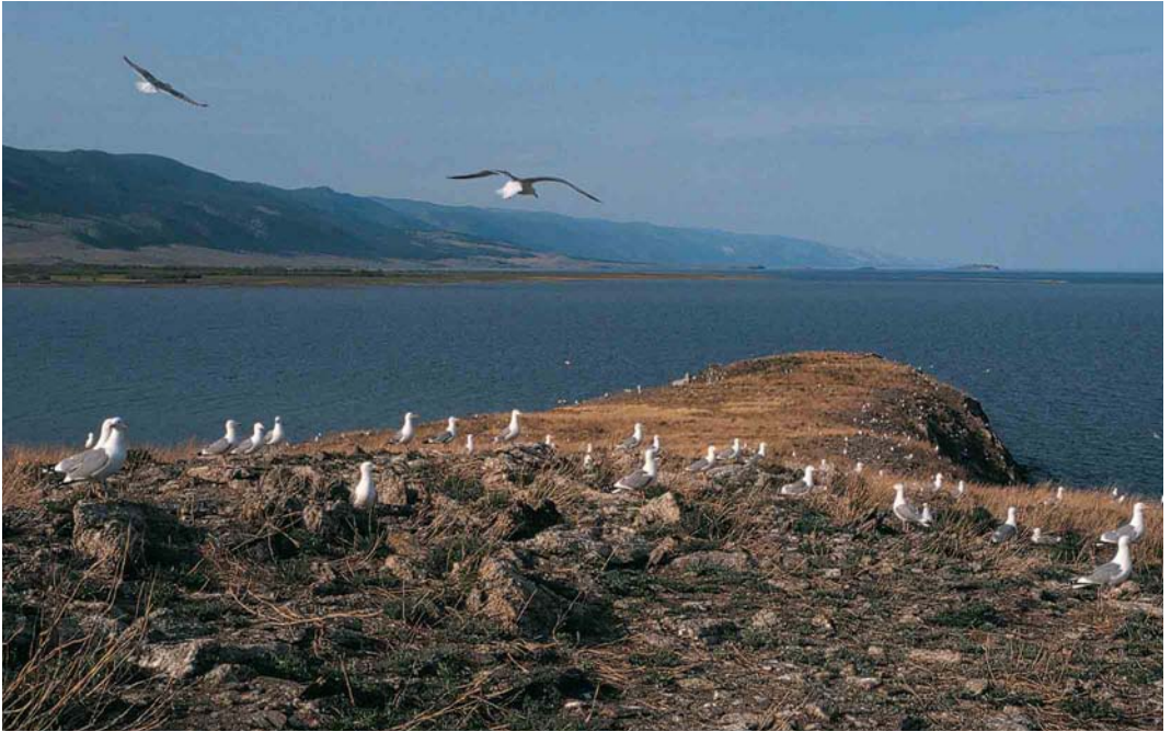
85 Part of Bolshoye Toïnik, Maloye More, north-western Lake Baikal, Siberia, Russia, May 1992 ( Pierre Yésou ). This island holds main colony of Mongolian Gull / Mongoolse Meeuw Larus (cachinnans) mongolicus (c 1000 pairs). Egg laying starts on c 5 May when ice still covers large parts of Lake Baikal. Temperatures of below 0°C regularly occur at night up to mid-June. Water surface temperature is still below 10°C by late June, except in some sheltered coastal bays 86 Mongolian Gulls / Mongoolse Meeuwen Larus (cachinnans) mongolicus , Maloye More, north-western Lake Baikal, Siberia, Russia, June 1992 ( Pierre Yésou )