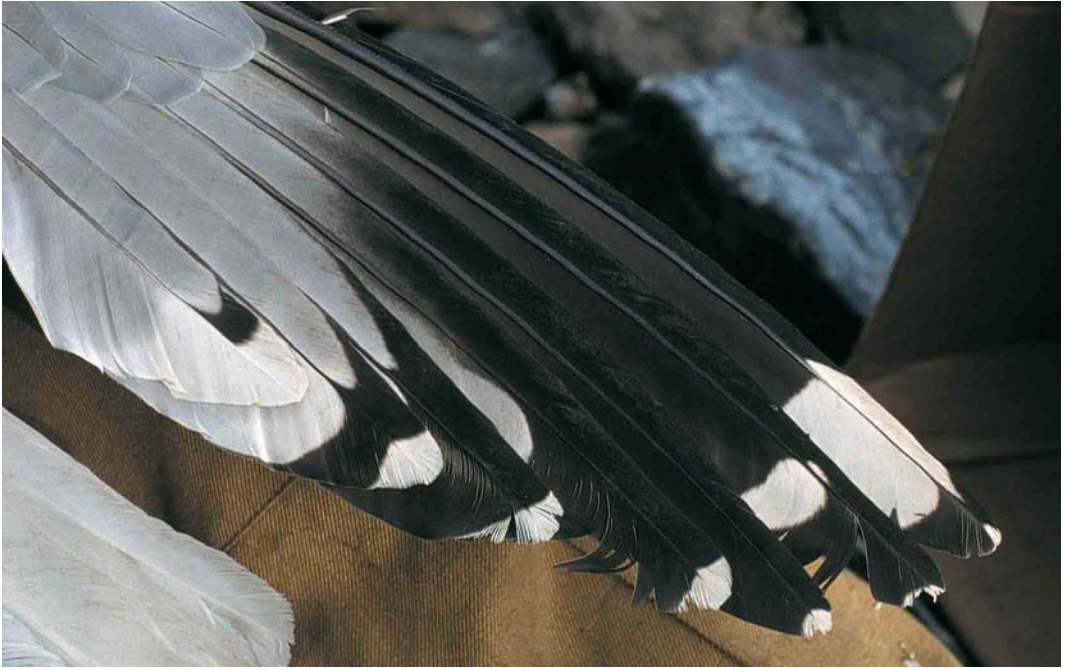
95-96 Mongolian Gull / Mongoolse Meeuw Larus (cachinnans) mongolicus , adult, upperwing, Lake Baikal, Siberia, Russia, June 1992 (Pierre Yésou). Typical wing-tip patterns. Note large white mirror and subterminal black bar (white tip more or less abraded) on p10 and mirror of variable extent on p9