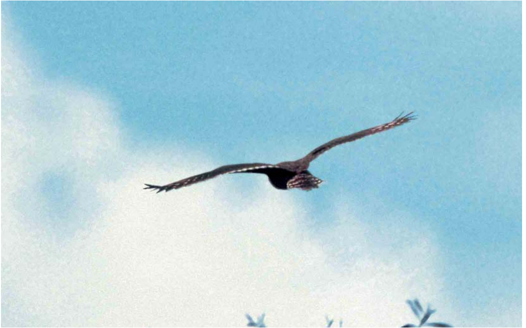
Mystery photograph III (December)