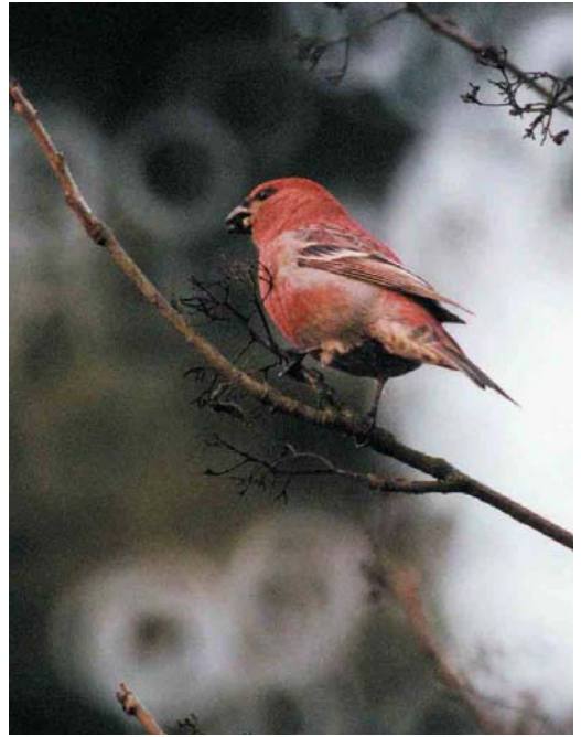
123 Northern Hawk Owl / Sperweruil Surnia ulula , Kallstorp, Skåne, Sweden, 17 February 2001 124 Pine Grosbeak / Haakbek Pinicola enucleator , adult male, Nyholla, Skåne, Sweden, January 2001 125 Pine Grosbeak / Haakbek Pinicola enucleator , probably first-winter male, Espoo, Helsinki, Finland, 12 February 2001. Narrow white fringes on just visible greater coverts indicate first-winter (white fringes are broader in adult); orange on head and breast indicates first-winter male