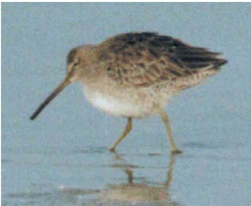
145 Grote Grijze Snip / Long-billed Dowitcher Limnodromus scolopaceus , Het Zwin, Knokke, West-Vlaanderen, 16 januari 2001 (Koen Verbanck)

Grote Grijze Snip in Prunjepolder Op 17 februari 2001 besloten wij (Hans, Mart en Wietze Janse) een klein familiedagje naar vogels te kijken in Zeeland. Al vogelend besloten we richting Prunjepolder te gaan omdat daar nog een Dwerggans Anser erythropus gemeld was. Aan de noordzijde van de Prunjepolder zagen we een kleine groep Brandganzen Branta leucopsis en we besloten die even af te kijken. Voor deze groep liepen enkele Kemphanen Philomachus pugnax