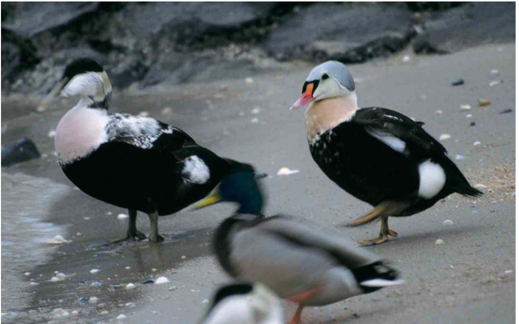
127 Koningseider / King Eider Somateria spectabilis , tweede-winter mannetje, met Eider / Common Eider S. mollissima , Texel, Noord-Holland, 15 februari 2001 (Erik Menkveld)