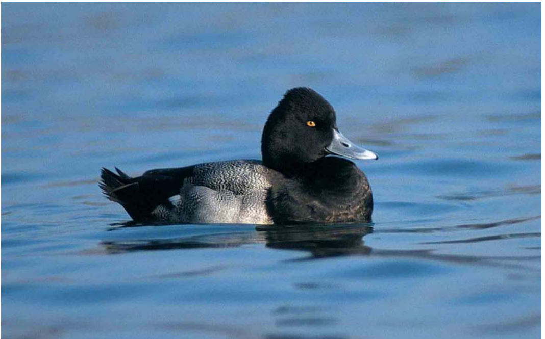
114 Lesser Scaup / Kleine Topper Aythya affinis , male, Huningue, Haut-Rhin, France, 14 January 2001 (Raffael Aye)