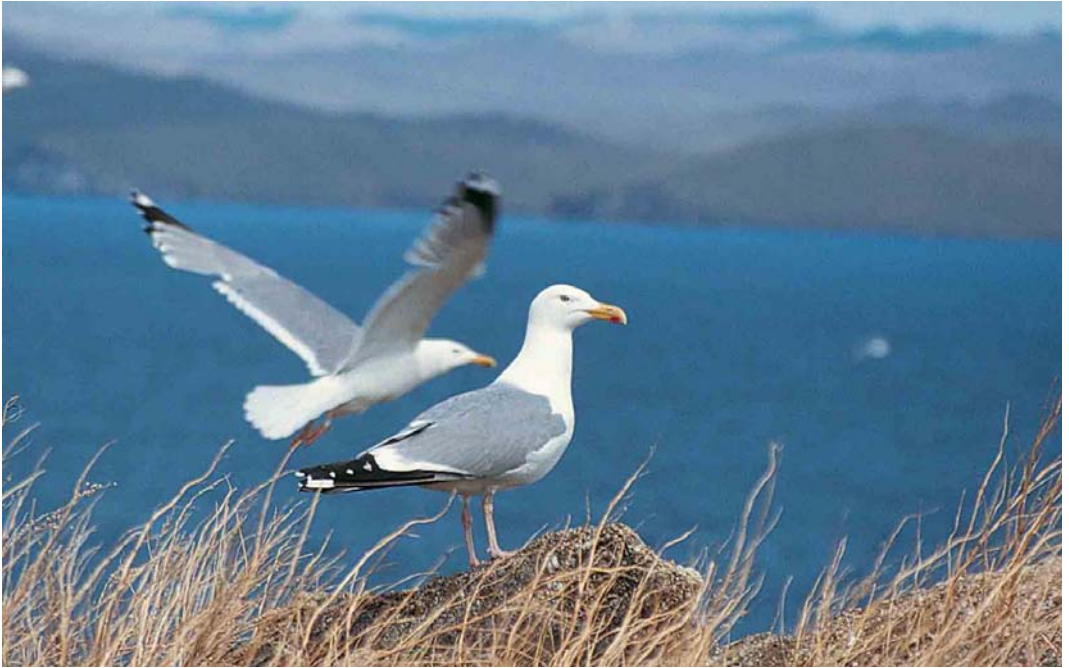
87 Mongolian Gulls / Mongoolse Meeuwen Larus (cachinnans) mongolicus , Maloye More, north-western Lake Baikal, Siberia, Russia, June 1992