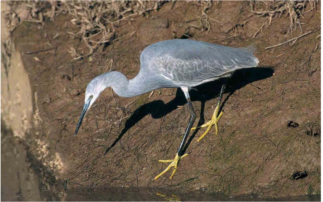
113 Grey-morph egret / grijze zilverreiger Egretta , Tavira, Algarve, Portugal, January 2001