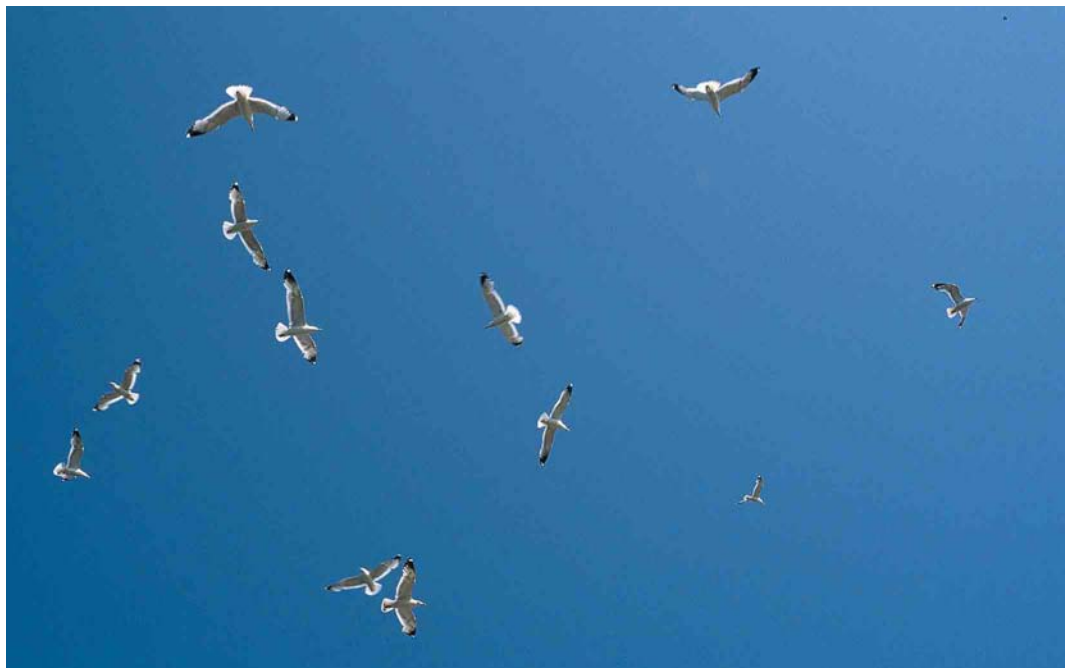
93 Mongolian Gulls / Mongoolse Meeuwen Larus (cachinnans) mongolicus , adults, Lake Baikal, Siberia, Russia, June 1992 (Pierre Yésou). Note contrast between pale grey underwing-coverts, darker grey band formed by bases of remiges and white (almost translucent) trailing edge to wing 94 Mongolian Gulls / Mongoolse Meeuwen Larus (cachinnans) mongolicus , adults, Lake Baikal, Siberia, Russia, June 1992 (Pierre Yésou). Note distinct white trailing edge to wing