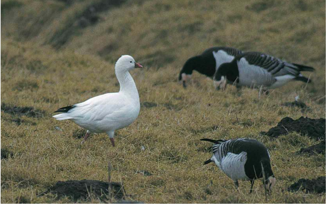
126 Ross' Gans / Ross's Goose Anser rossii , met Brandganzen / Barnacle Geese Branta leucopsis , Nieuwendijk, Zuid-Holland, 14 januari 2001 (Marten van Dijl)