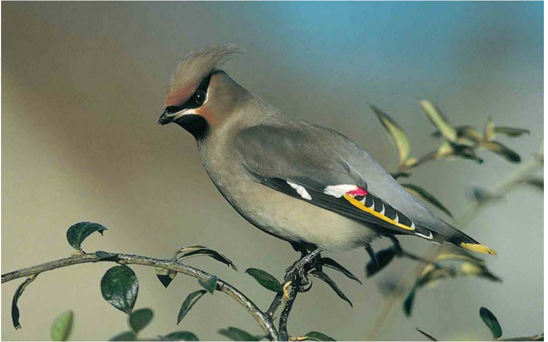
137 Pestvogel / Bohemian Waxwing Bombycilla garrulus , adult mannetje, Julianadorp, Noord-Holland, 3 januari 2001 (René Pop)