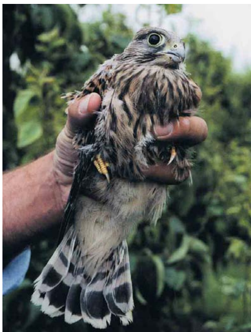
107 Common Kestrel / Torenvalk Falco tinnunculus , 27-day-old juvenile, Kapelle, Zeeland, Netherlands, 24 June 2000 (Niels de Schipper)

However, the accompanying photograph demonstrates that even this character is not always decisive. It depicts a 27-day-old juvenile Common Kestrel, ringed as one of four fledglings at Kapelle, Zeeland, the Netherlands, on 24 June 2000. The central claw on both feet is very pale,