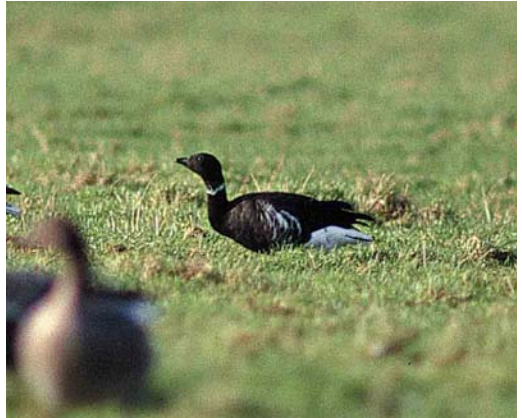
140 Zwarte Rotgans / Black Brant Branta nigricans , Uitkerkse Polders, West-Vlaanderen, 26 november 2000 (Peter Boesman) cf Dutch Birding 23: 57, 2001

eik, Limburg; Roisin, Hainaut (twee); Roksem (drie); Wetteren, Oost-Vlaanderen; en Zingem. Vanaf half februari werd er trek vastgesteld maar verschillende van de Oostvlaamse waarnemingen hebben betrekking op hetzelfde exemplaar. Op 10 februari vloog een Heilige Ibis Threskiornis aegyptius over Wuustwezel, Antwerpen. Een Rode Wouw Milvus milvus vloog op 8 januari over Kruike, Oost-Vlaanderen, en op 18 februari werd er één gezien te Eben, Liège. In januari werd geregeld een juveniele Zeearend Haliaeetus albicilla waargenomen in Het Zwin te Knokke. Er werden Ruigpootbuiszeters Buteo lagopus gezien te Oud-Heverlee, Vlaams-Brabant, op 14 januari en te Tienen, Vlaams-Brabant, op 20 februari. Reeds op 27 februari was er een waarneming van een Visarend Pandion haliaetus te Voeren, Limburg. Een Lannervalk Falco biarmicus van onbekende origine joeg op 14 januari te Poederlee, Antwerpen. Tussen 1 en 8 januari werden in Vlaanderen 83 overvliegende Kraanvogels Grus grus opgemerkt en op 13 januari vlogen er twee over Deerlijk, West-Vlaanderen; op 10 februari trokken er twee over Nivelles, Brabant-Wallon, en op 25 februari één over Galmaarden, Vlaams-Brabant, en zes over Wellen, Limburg. Op 18 januari liepen twee Kleine Strandlopers Calidris minuta in de Achterhaven van Zeebrugge. De eerste Grote Grijs Snip Limnodromus scolopaceus voor België, een adulte in winterkleed, verbleef van 16 tot 18 januari in Het Zwin te Knokke.