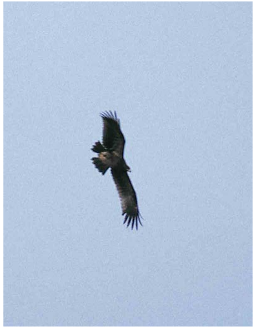
143-144 Bastaardarend / Greater Spotted Eagle Aquila clanga , juveniel, Alphen aan den Rijn, Zuid-Holland, 24 januari 2001 (Marten van Dijk)

gende Bastaardarend ontdekt, maar liefst de zesde waarneming van de soort sinds november 2000, wederom in het Lauwersmeergebied. Sietse Bernardus en Edwin de Weerd waren na een zoekactie voor een mogelijke – jawel – Bastaardarend bij Nieuwe Bildzijl, Friesland (die de volgende dag waarschijnlijk een Ruigpootbuiserd B lagopus bleek te zijn), op zoek naar wat ganzen in de Anjumerkolken, Friesland. Bij stom toeval ontdekten zij hier alsnog een Bastaardarend, wederom een juveniele. Deze vogel bleef tot in maart 2001 aanwezig in het Lauwersmeergebied, zowel aan de Groningse als de Friese kant, en is daarmee de langst verblijvende tot nu toe en bovendien de derde voor dit gebied.