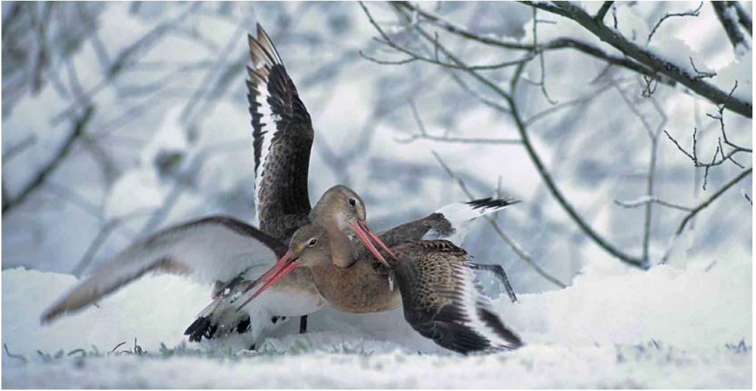
111 Black-tailed Godwits have a sinister side that, quite frankly, some people find scary