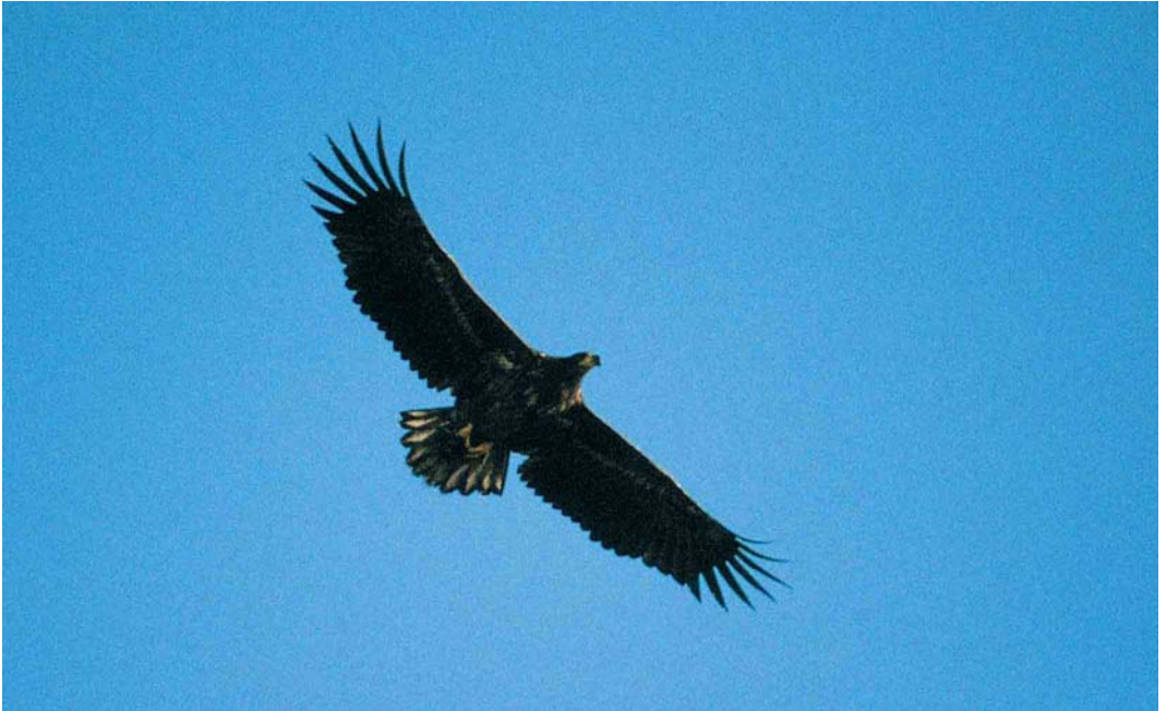
130 Zeearend / White-tailed Eagle Haliaeetus albicilla , juveniel, Goudplaat, Noord-Beveland, Zeeland, 13 januari 2001 (Corstiaan Beeke)