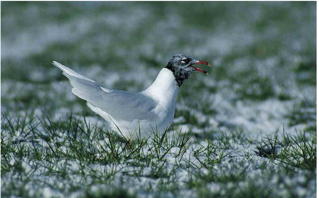
138 Zwartkopmeeuw / Mediterranean Gull Larus melanocephalus , adult ruiend van winter- naar zomerkleed, Tolsteeg, Utrecht, Utrecht, 24 februari 2001