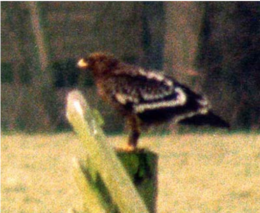
141 Bastaardarend / Greater Spotted Eagle Aquila clanga , juveniel, Anjum, Friesland, 25 januari 2001 (Huub Lanter)