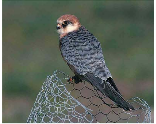
109 Red-footed Falcon / Roodpootvalk Falco vespertinus , first-summer female, Lesbos, Greece, 8 May 2000 ( Peter de Knijff ). Aged as first-summer by old and worn primaries and tertiaries, which are retained juvenile feathers. Dark streaking on crown and nape also indicative of this age 110 Red-footed Falcon / Roodpootvalk Falco vespertinus , adult female, Lesbos, Greece, 8 May 2000 ( Peter de Knijff )