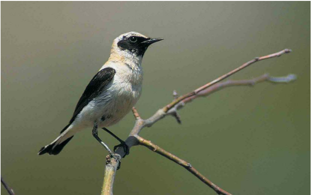
Mystery photograph IV (June)