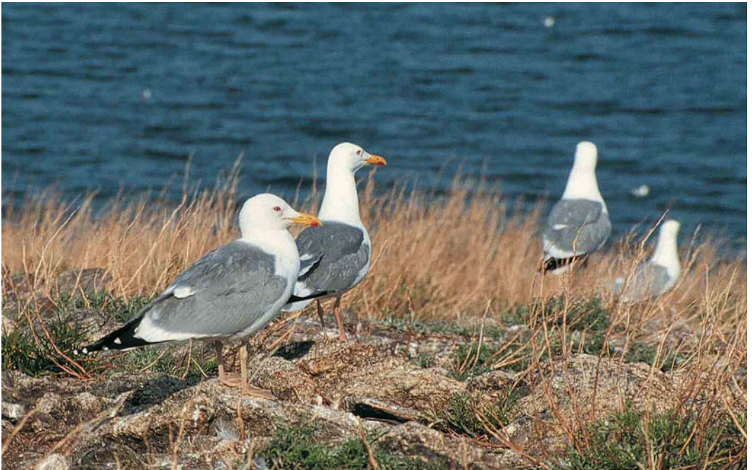
88 Mongolian Gulls / Mongoolse Meeuwen Larus (cachinnans) mongolicus , Maloye More, north-western Lake Baikal, Siberia, Russia, June 1992. Note that incidence of light influences perception of mantle colour