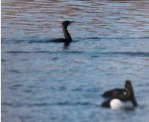
139 Dwergaalscholver / Pygmy Cormorant Microcarbo pygmeus , Warneton, Hainaut, 28 december 2000