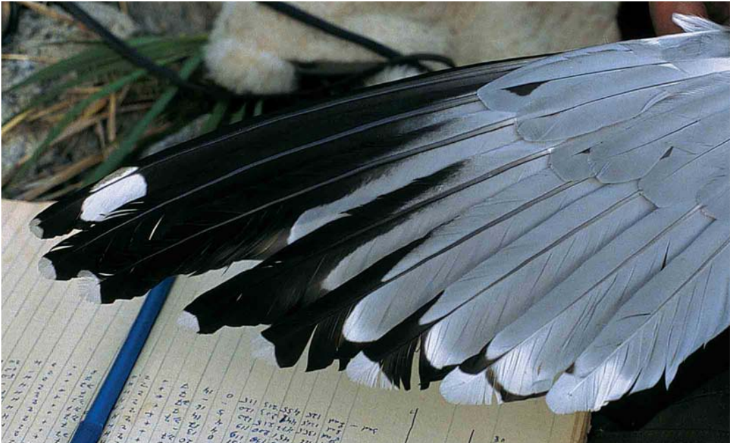
98 Mongolian Gull / Mongoolse Meeuw Larus (cachinnans) mongolicus , (sub)adult, upperwing, Lake Baikal, Siberia, Russia, June 1992. Wing-tip pattern shown by a minority of birds. White mirror on p9 is missing. Note black markings on outer greater coverts in this otherwise fully adult-plumaged breeding bird