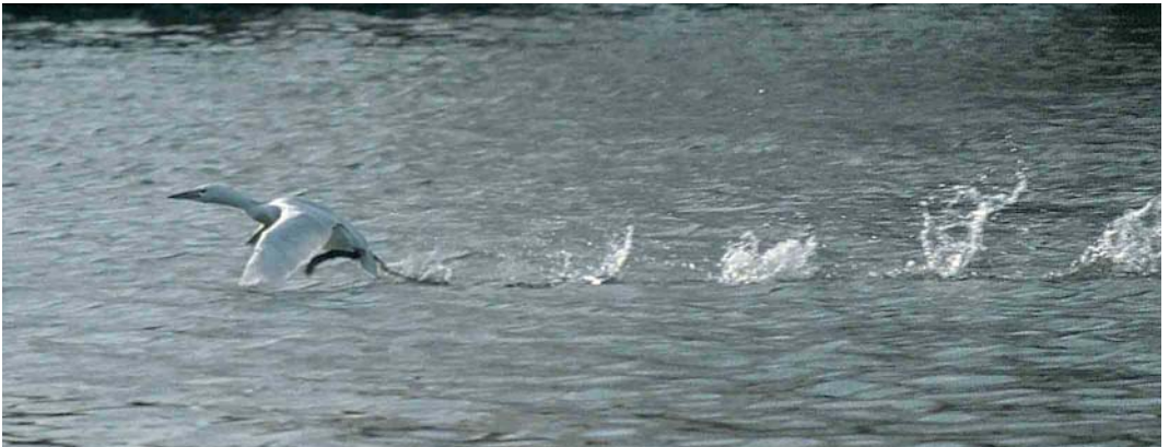
115 Giervalk / Gyr Falcon Falco rusticolus , Ouessant, Finistère, France, 4 March 2001 ( Marc Ameels ) 116 Steppe Grey Shrike / Steppeklapekster Lanius pallidirostris , Penisola Magnisi, Siracusa, Italy, January 2001 ( Andrea Corso ) 117 Probable hybrid Mallard x Red-crested Pochard / vermoedelijke hybride Wilde Eend x Krooneend Anas platyrhynchos x Netta rufina , Huningue, Haut-Rhin, France, 15 January 2001 ( Raffael Aye ). Note Mallard-like tail with much white; uniform brown head and body with paler head sides and dark-grey bill (but without pink) are reminiscent of Red-crested Pochard 118 Probable Taverner's Canada Goose / vermoedelijke Taverners Canadese Gans Branta hutchinsii taverneri , with Barnacle Geese / Brandganzen B leucopsis , Dunfanaghy, Donegal, Ireland, 25 February 2001 ( Chris Batty ) 119 Probable Black-throated Loon / vermoedelijke Parelduiker Gavia arctica , albino, Lauffen, Baden-Württemberg, Germany, December 2000 ( Christoph Randler )