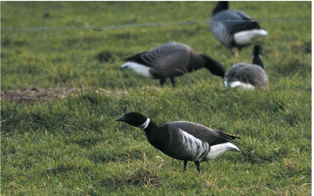
129 Zwarte Rotgans / Black Brant Branta nigricans , adult, met Rotganzen / Dark-bellied Brent Geese B. bernicla , Scharendijke, Zeeland, 7 januari 2001 ( Jan van Holten )