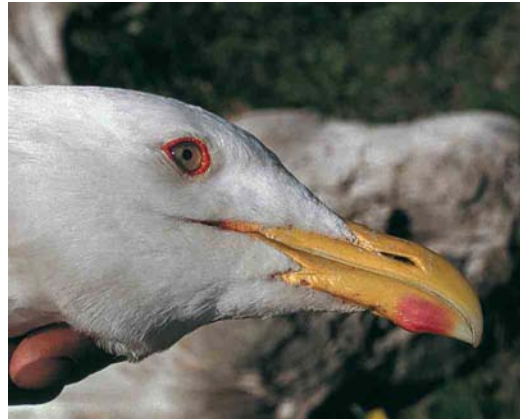
101 Mongolian Gull / Mongoolse Meeuw Larus (cachinnans) mongolicus , adult, Lake Baikal, Siberia, Russia, June 1992 (Pierre Yésou). Dark-eyed bird. Note that red gonydeal spot does not reach upper edge of lower mandible