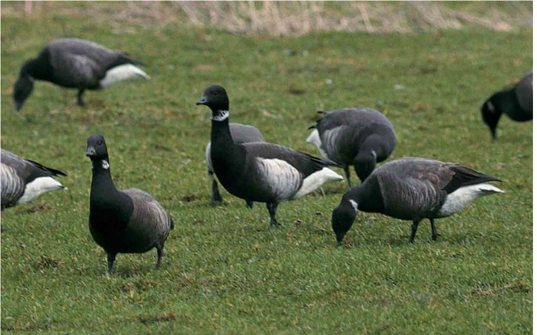
128 Zwarte Rotgans / Black Brant Branta nigricans , adult, met Rotganzen / Dark-bellied Brent Geese B. bernicla , Huisduinen, Noord-Holland, 21 februari 2001 ( Ruud E Brouwer )