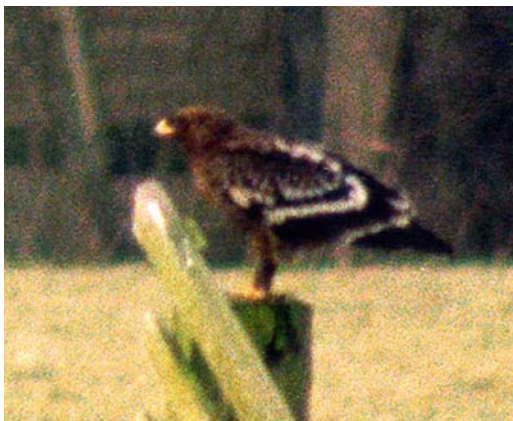
141 Bastaardarend / Greater Spotted Eagle Aquila clanga , juveniel, Anjum, Friesland, 25 januari 2001