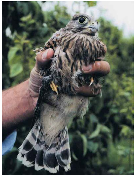
107 Common Kestrel / Torenvalk Falco tinnunculus , 27-day-old juvenile, Kapelle, Zeeland, Netherlands, 24 June 2000 (Niels de Schipper)

However, the accompanying photograph demonstrates that even this character is not always decisive. It depicts a 27-day-old juvenile Common Kestrel, ringed as one of four fledglings at Kapelle, Zeeland, the Netherlands, on 24 June 2000. The central claw on both feet is very pale,