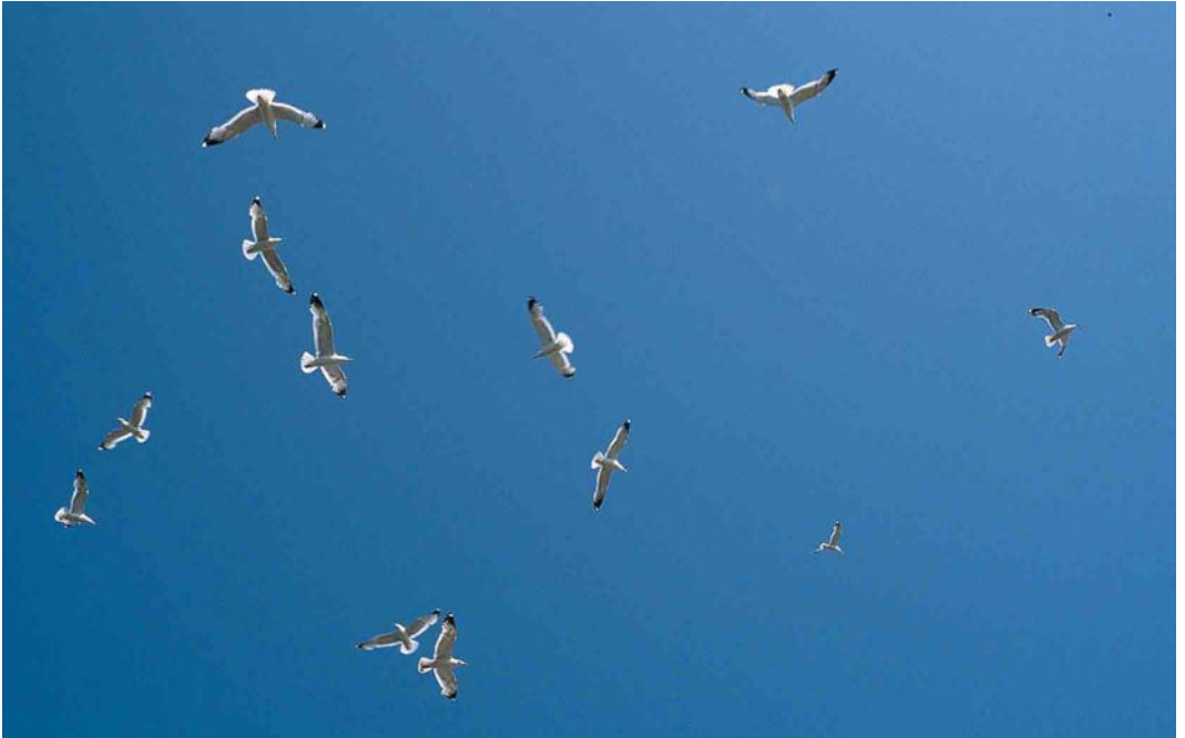
93 Mongolian Gulls / Mongoolse Meeuwen Larus (cachinnans) mongolicus , adults, Lake Baikal, Siberia, Russia, June 1992 (Pierre Yésou). Note contrast between pale grey underwing-coverts, darker grey band formed by bases of remiges and white (almost translucent) trailing edge to wing 94 Mongolian Gulls / Mongoolse Meeuwen Larus (cachinnans) mongolicus , adults, Lake Baikal, Siberia, Russia, June 1992 (Pierre Yésou). Note distinct white trailing edge to wing