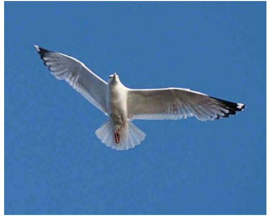
89-91 Mongolian Gull / Mongoolse Meeuw Larus (cachinnans) mongolicus , adult, Lake Baikal, Siberia, Russia, June 1992 ( Pierre Yésou ). Note distinct white trailing edge to wing 92 Mongolian Gull / Mongoolse Meeuw Larus (cachinnans) mongolicus , adult, Lake Baikal, Siberia, Russia, June 1992 ( Pierre Yésou ). Note contrast between pale grey coverts, darker grey band formed by bases of remiges and white (almost translucent) trailing edge to wing

of vegae and birds of Taimyr, mongolicus only shows poorly developed dark streaks on the head after the post-breeding moult (Dement'ev 1951). Birds still present at Lake Baikal in November show a virtually all-white head and neck (Sergey Pyzhianov pers comm).