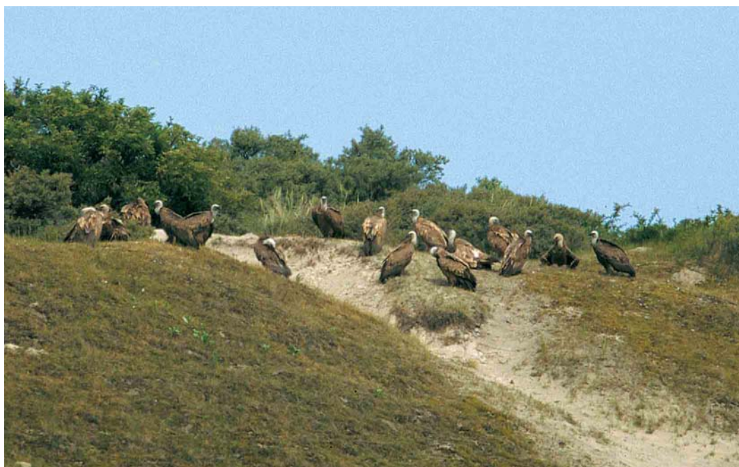
339 Eurasian Griffon Vultures / Vale Gieren Gyps fulvus , Westenschouwen, Zeeland, Netherlands, 6 July 2001 (Arie Ouwerkerk)