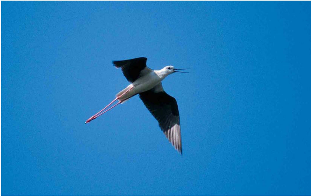
342 Steltkluut / Black-winged Stilt Himantopus himantopus , Stinkgat, Tholen, Zeeland, 26 juni 2001 (Marten van Dijl)