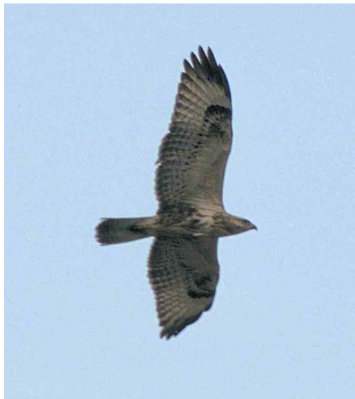
331 Arendbuizerd / Long-legged Buzzard Buteo rufinus rufinus , juveniel, Praamweg, Flevoland, 9 september 2000 (Roef Mulder)

Op donderdag 7 september gingen we wederom terug want door de gidsen groeide de onrust; op de achterkop hadden we namelijk een donker vlekje ontdekt dat in Jonsson (1997) niet wordt beschreven maar wél wordt getekend bij Arendbuizerd. Bij het vertrouwde veld vonden we al snel de inmiddels tot 'vermoedelijke Arendbuizerd' gepromoveerde vogel terug. Hij zat nu fraai belicht, rustig speurend naar voedsel, soms de nek wat rekkend en met een paar krachtige stappen een donkere prooi (muis of mol?) verschalkend. We konden de vogel vervolgens ongeveer een uur lang op c 70 m afstand met onze telescopen bestuderen bij vrijwel windstil weer en maakten een zo compleet mogelijke veldbeschrijving. Onze conclusie was nu dat het zeker een onvolwassen Arendbuizerd betrof. Onder de indruk en best opgewonden haastten we ons om de waarneming per gsm in te spreken op de Dutch Birding-vogellijn, waarna we onze vogelreis volgens schema vervolgden naar Gaasterland in Friesland. In de avond werden we door de beheerder van de vogellijn, Klaas Haas, gebeld voor nadere informatie en vatten we de genoteerde kenmerken kort samen.