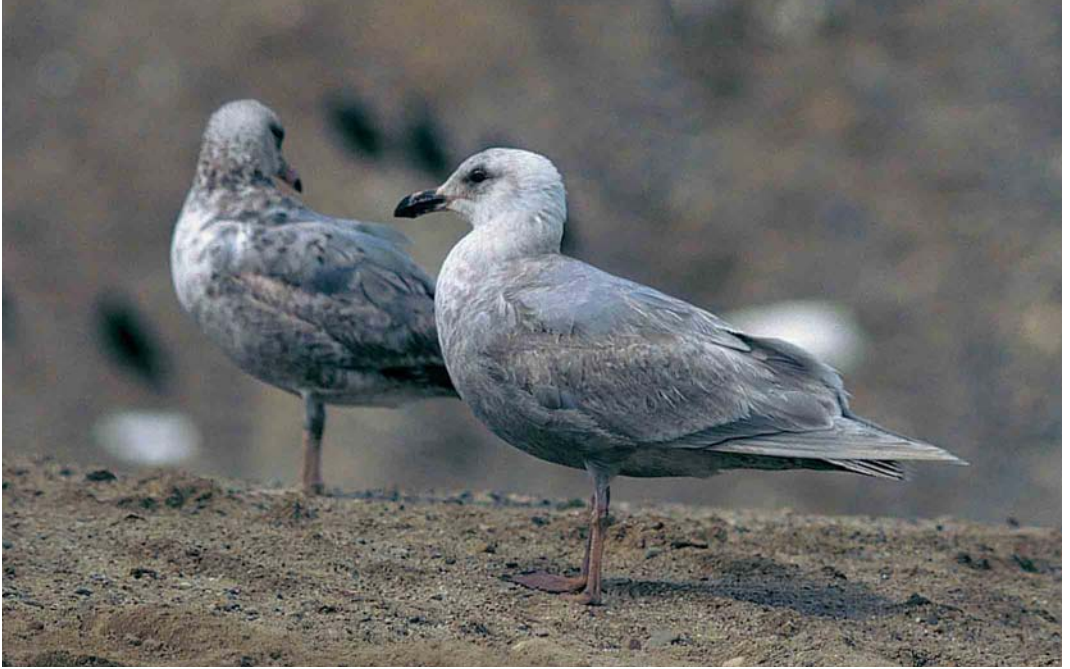
305 Glaucous-winged Gull / Beringmeeuw Larus glaucescens , second calendar-year, (right), with American Herring Gull / Amerikaanse Zilvermeeuw L. smithsonianus , subadult, Santa Barbara, California, USA, March 1982. Bird in second-winter plumage. Note overall plain-looking plumage and adult-type pale grey mantle-feathers. Head rather small and rounded and bill not very heavy, possibly indicating female