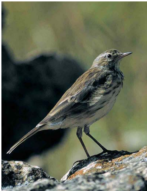
336-337 Water Pipit / Waterpieper Anthus spinoletta , Cirque de Troumouse, Hautes-Pyrénées, France, 9 September 1996

indication in which direction we should look for this bird's identity. The bird shows long and rather narrow tertials that cover the primaries completely; moreover, the longest tertial nearly reaches the tip of the uppertail-coverts. The absence of a primary projection in combination with long and rather narrow tertials points in the direction of the pipits Anthus . In addition, the