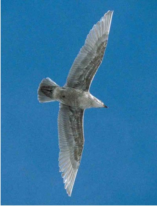
314 Glaucous-winged Gull / Beringmeeuw Larus glaucescens , third calendar-year, Nosappu Misaki, Hokkaido, Japan, 5 February 1999 (Jon R King). Pale underwing reminiscent of Glaucous Gull L hyperboreus is typical

the lowerbreast and belly, adding to the uniform appearance. The upperwing has the same colour and pattern as the upperparts; primaries and secondaries are pale brown-grey (often about the same colour as the tertials) with an indistinct dark subterminal tip and a pale (whitish) fringe. The tertials and greater wing-coverts have a solid-brown but not strongly contrasting centre and a rather narrow pale fringe. Quite often, there is some pale 'marbling' at the tips of these feathers. The underwing is pale brown-grey, streaked darker on the wing-coverts and axillaries. When perched, the underside of the folded wing-tip is largely pale. The bill is uniform black and the iris is dark. The legs and feet vary from brownish or rather dark pinkish to almost bright bubblegum-pink; this bright colour was, for instance, frequently seen in birds wintering in Japan (Klaus Malling Olsen in litt).