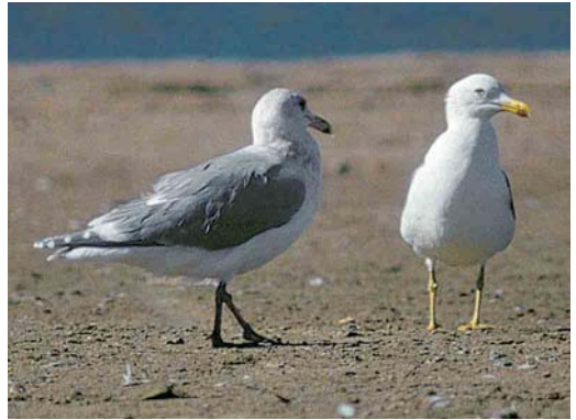
322-324 Glaucous-winged Gull / Beringmeeuw Larus glaucescens , adult winter, Essaouira, Morocco, 31 January 1995 (Theo Bakker/Cursorius) 325 Glaucous-winged Gull / Beringmeeuw Larus glaucescens , adult winter (left), with Yellow-legged Gull / Geelpootmeeuw L. michahellis , Essaouira, Morocco, 31 January 1995 (Theo Bakker/Cursorius)

UNDERPARTS White. No darker wash or markings on side of breast.