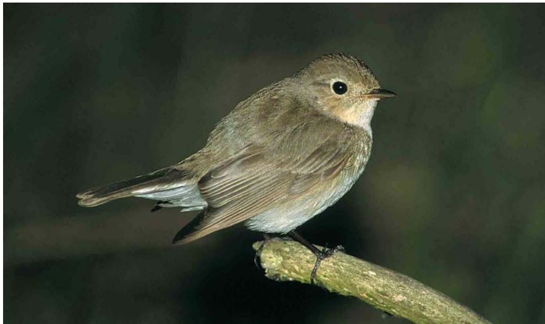
353 Kleine Vliegenvanger / Red-breasted Flycatcher Ficedula parva , Heist, West-Vlaanderen, 25 mei 2001 cf Dutch Birding 23: 240, 2001