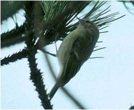
328 Hume's Leaf Warbler / Humes Bladkoning Phylloscopus humei , Wassenaar, Zuid-Holland, 17 December 1990 (Arnoud B van den Berg)

c 0.27 s. In figure 3, a call is shown that also has an upward inflection but this one is rather short, with a duration of c 0.23 s. The call in figure 4 is again somewhat shorter and is becoming more single-toned. The oscillogram, however, shows the disyllabic structure. It is very short, only c 0.15 s.