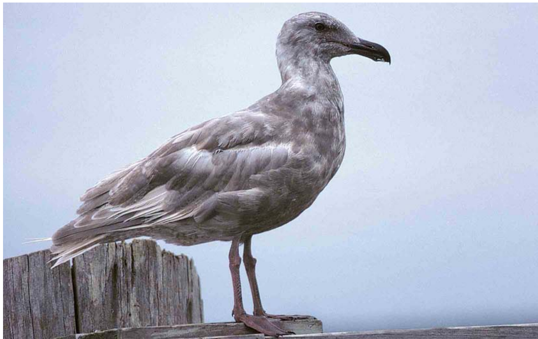
308 Glaucous-winged Gull / Beringmeeuw Larus glaucescens , second calendar-year, Westport, Washington, USA, 29 August 1986 (Arnoud B van den Berg). Note very abraded plumage, typical for many one year old birds in summer

Glaucous x European Herring Gull (plates 287-288) Many features typical of Glaucous-winged Gull could also be shown by Glaucous x European Herring Gull hybrids which are regular in Iceland – the situation in Iceland is clouded by the alleged presence of European Herring Gulls with much reduced melanism in the wing-tips (cf Snell 1991, 1993). However, such hybrids would differ from Glaucous-winged Gull by their pale iris (both parent species show a pale yellowish iris) and would probably show a slightly different, less drooping, bill shape. The overall shape would be less bulky than in Glaucous-winged Gull. The mantle colour of such a hybrid would probably be slightly paler than in Glaucous-winged Gull, especially in birds closer to Glaucous Gull in upperpart tone. Any hybrid would show upperparts intermediate in tone between ‘ argenteus ’ European Herring Gull (the type breeding in Iceland) and Glaucous Gull. Similarly, the primary pattern can be expected to be intermediate in some respects as well (for instance, dark markings more restricted, not reaching p5 or even p6). In winter plumage, the heavy brown streaking on head and neck (present in both parent species) will in most cases differ from the brownish