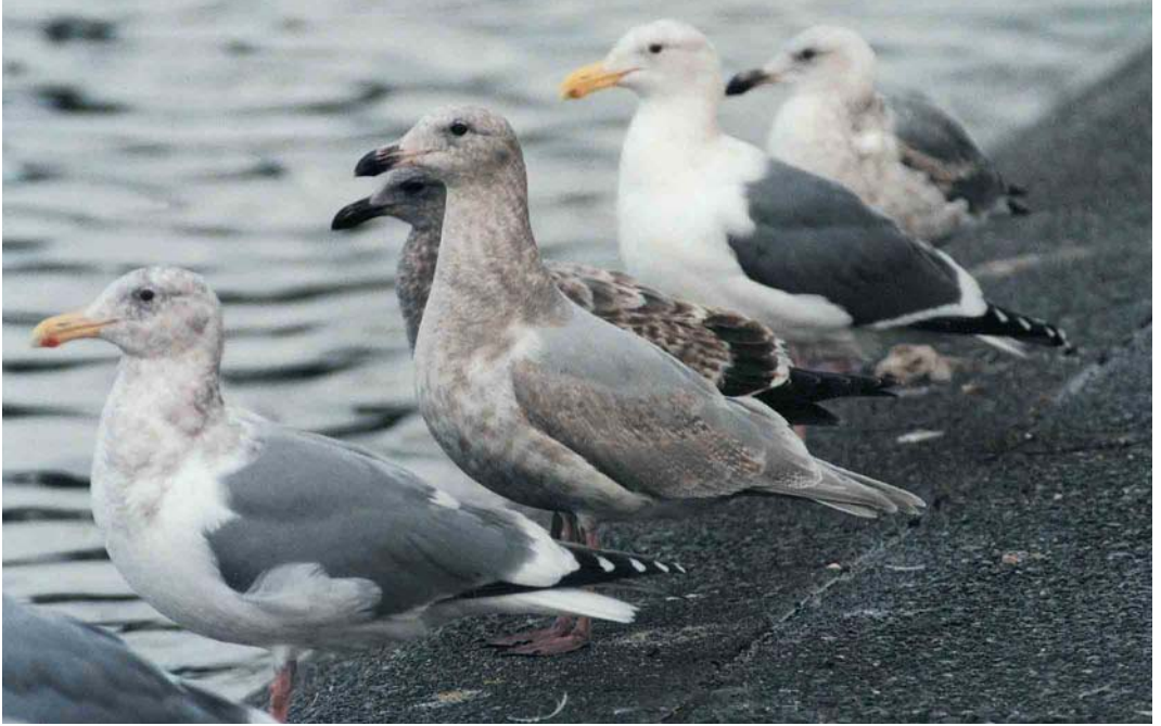
309 Glaucous-winged Gull / Beringmeeuw Larus glaucescens , third calendar-year (centre), with hybrid Glaucous-winged x Western Gull / Beringmeeuw x Californische Meeuw L. glaucescens x occidentalis , adult (left) and Western Gulls (second calendar-year, behind, adult, right, and third calendar-year, far right), Petaluma, Sonoma County, California, USA, 12 January 1998. Note intermediate grey upperparts and dark grey (not black) primaries of hybrid

Palaearctic records (on El Hierro, Canary Islands) concerned a bird presumed to be in third-winter plumage. Structural features are very much comparable at all ages and may therefore be studied in immatures as well to learn the distinctive characters of Glaucous-winged Gull of any age. The text below summarizes the main characters of immature plumages from juvenile to third-summer plumage, and is based on Harrison (1983), Snow & Perrins (1998) and Sibley (2000). The accompanying photographs illustrate most plumage stages of pure Glaucous-winged Gulls and several hybrid-types which may cause confusion. The principal identification points are discussed in the captions.