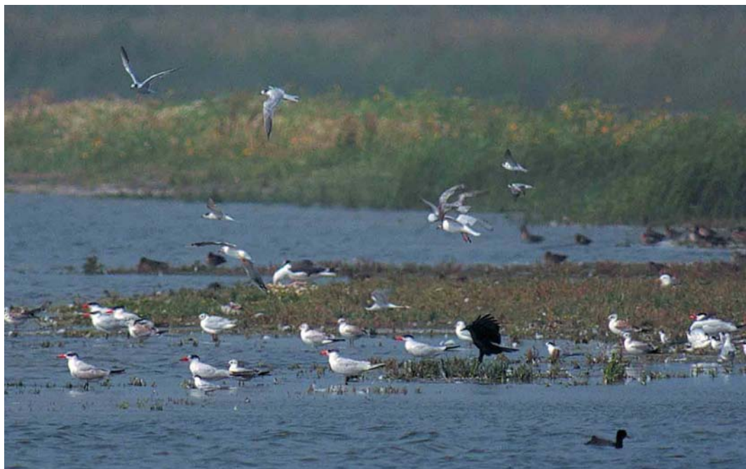
351 Reuzensterns / Caspian Terns Sterna caspia , Makkumerzuidwaard, Friesland, augustus 2001