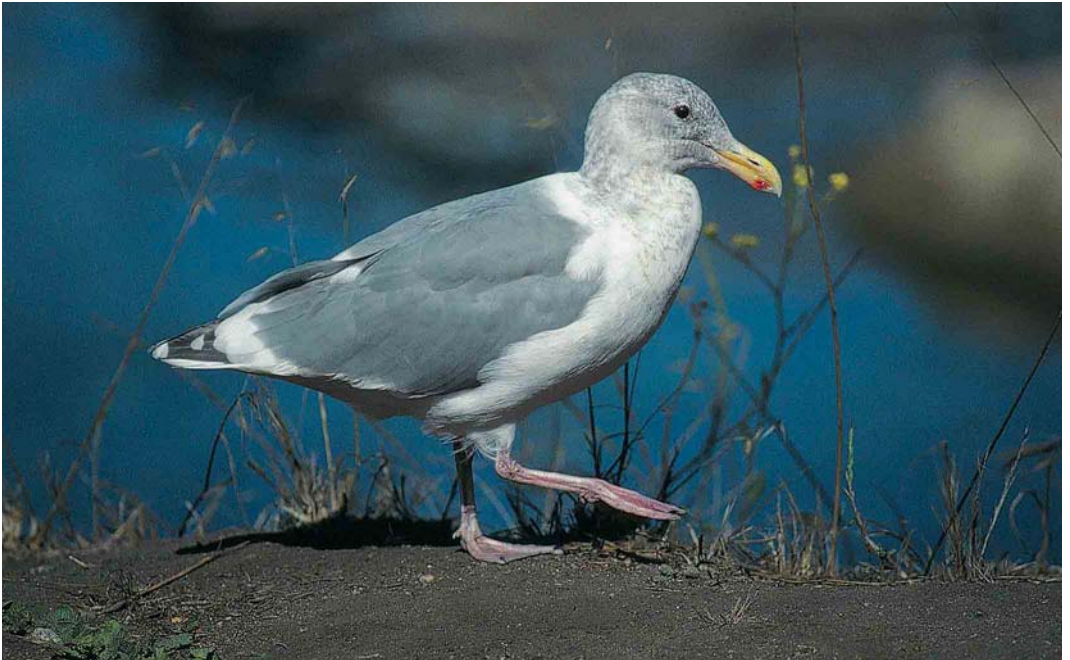
285 Glaucous-winged Gull / Beringmeeuw Larus glaucescens , adult, Vancouver Island, British Columbia, Canada, September 1998. Note small dark eye, typical scalings on head, neck and breast and strong, deep pink legs. Outer primaries are missing