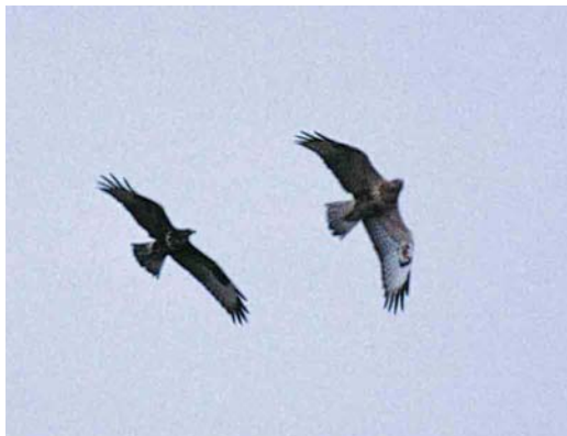
333 Arendbuizerd / Long-legged Buzzard Buteo rufinus rufinus , juveniel (rechts), met Buizerd / Common Buzzard Buteo buteo buteo , Praamweg, Flevoland, 9 september 2000

BOVENVLEUGEL P1-5 donkerbruin met lichte bandering en donkere achterrand. P6-10 met lichte basis en donkere top, in vlucht zichtbaar als lichte vlek aan basis. Armpennen uniform donkerbruin met smalle lichte top. Tertiaals donkerbruin. Kleine dekveren kaneelbruin, middelste dekveren kaneelbruin met lichte zoom waardoor bonte indruk ontstaat. Grote dekveren donkerbruin met smalle lichte zoom, in zit donkere vleugelbaan vormend met smalle lichte streep, in vlucht zichtbaar als donkere baan; deze donkere baan doorlopend tot op basis van grote handdekveren en alula op voorrand van vleugel. Alula donkerbruin.