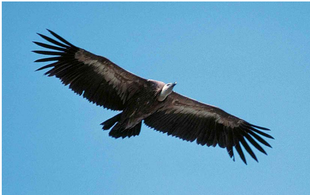
338 Eurasian Griffon Vulture / Vale Gier Gyps fulvus , Westenschouwen, Zeeland, Netherlands, 5 July 2001