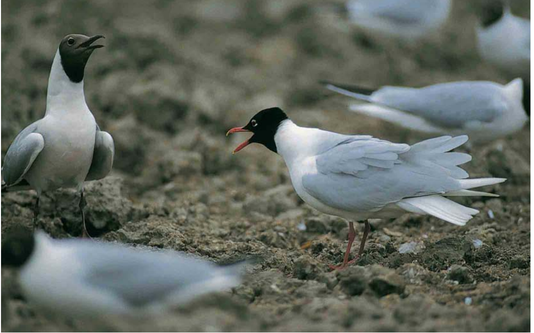
352 Zwartkopmeeuw / Mediterranean Gull Larus melanocephalus , adult, met Kokmeeuwen / Black-headed Gulls L. ridibundus , Oude Tonge, Zeeland, juni 2001 (Marten van Dijl)

waargenomen op de Maasvlakte. Buidelmezen Remiz pendulinus bleven schaars met slechts meldingen van vier locaties. De Huiskraaien Corvus splendens van Hoek van Holland, Zuid-Holland, worden daar nog regelmatig gezien. Een verlaat overlijdensbericht betreft de jarenlang aanwezige vogel van Renesse, Zeeland, die daar afgelopen voorjaar dood werd gevonden. Een adulte Roze Spreeuw Sturnus roseus werd op 3 juli