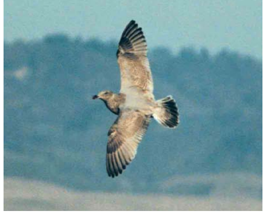
315 Hybrid Glaucous-winged x Western Gull / Beringmeeuw x Californische Meeuw Larus glaucescens x occidentalis , second calendar-year, Point Reyes, Marin County, California, USA, 12 November 1996. Most of plumage is closer to Western Gull but note pale mantle and scapulars more close to Glaucous-winged Gull

Overall, juvenile Glaucous-winged Gull resembles juvenile Thayer's Gull but most are easily distinguished by obvious differences in size and structure. Thayer's is smaller and neater,