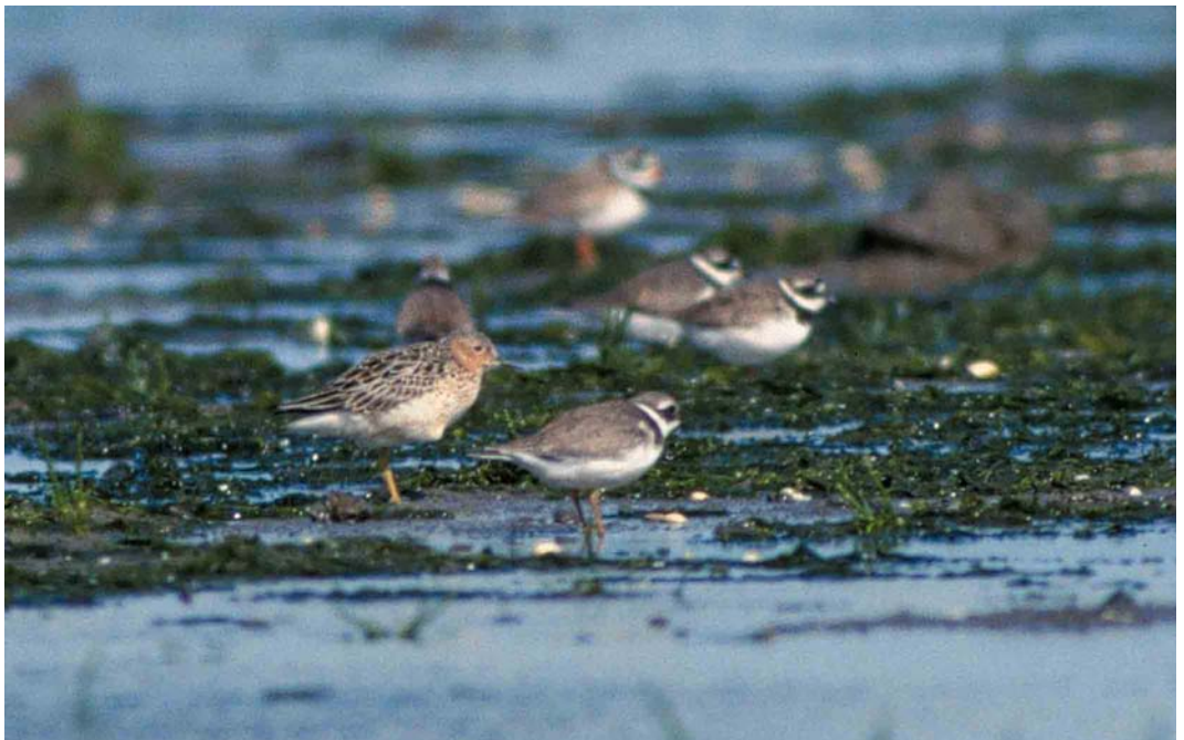
343 Blonde Ruiters / Buff-breasted Sandpiper Tryngites subruficollis , adult, met Bontbekplevieren / Common Ringed Plovers Charadrius hiaticula , Eemshaven, Groningen, 10 augustus 2001