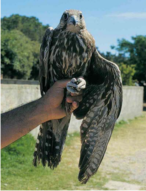
340 Saker Falcon / Sakervalk Falco cherrug , immature, found exhausted in May 2001 and kept in care until July 2001, Sardinia, Italy, 21 June 2001 (Marcello Grusso & Rossana Rossi)

CORMORANTS TO FLAMINGOS The Pygmy Cormorant Microcarbo pygmeus at Wollmatinger Ried, Baden-Württemberg, Germany, remained to late July. On 5 August, one was reported at Spytkowice, Poland. A Great White Pelican Pelecanus onocrotalus was seen in Burgenland, Austria, on 6 June. An adult was seen from 9 June to 1 July in Niedersachsen, Germany, and then toured Brandenburg, Germany, on 12-20 July. An immature was seen near Tömörkánt, Hungary, on 29 July. In France, one turned up at Gruissan, Aude, on 29 August. A remarkable (escape?) record were the five Pink-backed Pelicans P. rufescens photographed on 10 September near Rimini in north-eastern Italy. The fourth or fifth Western Reef Egret Egretta gularis this year for Italy was observed at Lago San Giuliano, Matera, Basilicata, on 7 July. Another was at Desembocadura del Río Guadalhorce, Málaga, Spain, from at least 27 July to 15 August. In France, one was seen at Puy-Sainte-Reparate, Bouches-du-Rhône, France, on 29 July. The Intermediate Egret E. intermedius present from 30 May at Vasche di Maccarese, Roma, Italy, remained until at least 23 August (cf Dutch Birding 23: 224, plate 248, 2001). The second for the United Arab Emirates (UAE) remained in fields near the Dubai sewage works from 25 June to at least 27 July. A possible record roosting flock of c 300 Glossy Ibises Plegadis falcinellus was at Brazo del Este, Sevilla, on 12 August. For the first