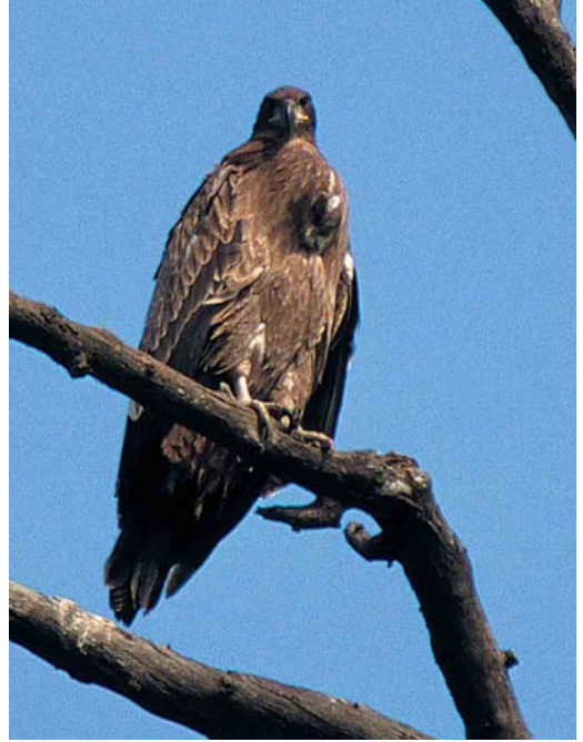
Mystery photograph X (April)

Birding 23: 36, 2001) carefully and identify the birds in the photographs. Solutions can be sent in three different ways: