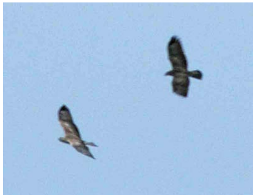
332 Arendbuizerd / Long-legged Buzzard Buteo rufinus rufinus , juveniel (links), met Buizerd / Common Buzzard Buteo buteo buteo , Praamweg, Flevoland, 9 september 2000

Aquila chrysaetos herinnerend vanwege uitstekende kop, lange staart en S-vormige achterrand van vleugel. Vleugels in lichte V gehouden waarbij knik zichtbaar tussen hand en arm; hand werd daarbij meer horizontaal gehouden. 12 staartpennen. P8 (handpennen van binnen naar buiten genummerd) en p9 langst, > p7 > p6 > p10 > p5.