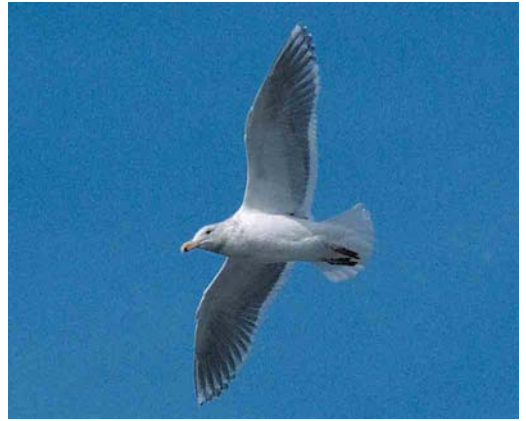
286 Glaucous-winged Gull / Beringmeeuw Larus glaucescens , adult, Nosappu Misaki, Hokkaido, Japan, 5 February 1999 (Jon R King). Note extensive white tongue on primaries up to p9 which can be feature of hybrids

Typical Glaucous-winged Gulls are rather large and bulky, with a heavy bill, marked gonydeal angle, heavy head, thick body and short primary and wing projections. The wings are rather broad and slightly more rounded than in most Palearctic large gulls while the outer primaries are rather more curved. In addition, the secondaries are relatively longer than in many other Palearctic large gulls (except Western Gull), resulting in a broad, often rather shortish-looking wing. Hence, when perched, the folded wing often looks broad, with the secondaries and/or the bases to the outer primaries often well visible (sometimes the full bases to as many as four or five outer primaries can easily be seen), and the secondaries often project beyond the greater wing-coverts. Two or three primary-tips extend beyond the tail. Palearctic large gulls normally show a slimmer folded-wing structure (cf Garner & McGeehan 1998). Note however that any Palearctic large gull may, at times, adopt a posture in which it reveals more of its secondaries and/or primary-bases than usual. Nevertheless, this is normally just a temporary function of wing