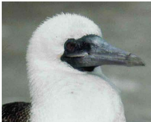
334 Peruvian Booby / Humboldtgent Sula variegata, adult, Callao, Lima, Peru, 31 December 1997