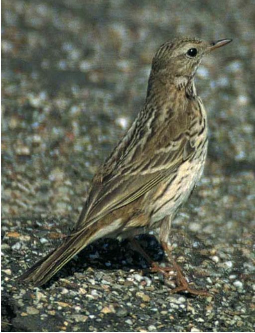
Mystery photograph IX (May)