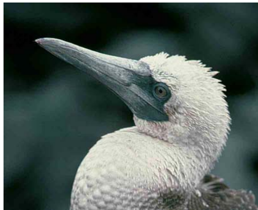
335 Peruvian Booby / Humboldtgent Sula variegata , juvenile, Galapagos Islands, autumn 1983 (Mark van Beirs)

books wrongly describe and/or even wrongly depict the iris colour of Peruvian Booby: Heinzel & Tuck (1980: not described but depicted as yellowish-white), Harrison (1983: not described but depicted as yellowish-white), Harrison (1985: 'iris pale yellow' and depicted as such), Harrison (1987: 'iris pale yellow' and depicted as such), del Hoyo et al (1992: not described but depicted as yellowish-white with a slight orange tinge in the upper rim) and Enticott & Tipling (1997: 'iris pale yellow') – to name just a few. Nota bene in Harrison (1987), the red iris is just visible on photograph 307. As Blue-footed and Peruvian Boobies are fairly similar in plumage, they could perhaps be misidentified even at close range if the feet (bright blue in Blue-footed, blackish in Peruvian) are not visible, for instance when sitting on the nest. In juvenile Blue-footed, the 'eyes are brown, sometimes paler and more greyish' (Nelson 1978), while in juvenile Peruvian