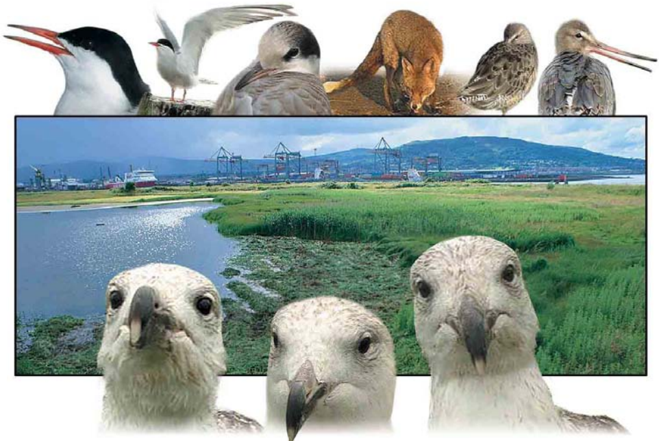
FIGURE 1 Above: Common Terns, Red Fox, Long-billed Dowitcher and Black-tailed Godwit; below: Great Black-backed Gulls; main picture: Harbour Lagoon

a dog with a bone. Several canes were carried off by a vixen and given to cubs as a toy to chew on. So much for worries that the lagoon's wildlife would be camera-shy. Greylag Geese and Mute Swans fall asleep in front of the lens and block the view; Jackdaws have used the hood as an umbrella; and, when the equipment was moved on to a nearby island to film breeding Common Terns, one pair decided to nest among the cables trailing on the ground. Until the chicks hatched, the camera could not rotate more than 90 degrees for fear of dislodging the eggs.