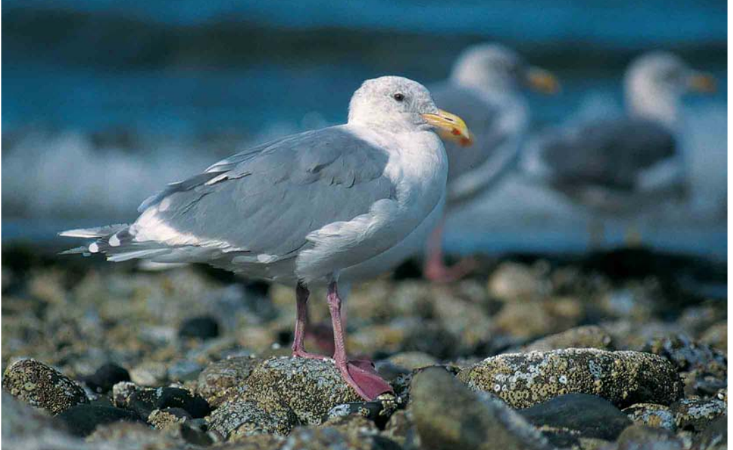
284 Glaucous-winged Gull / Beringmeeuw Larus glaucescens , adult, Monterey, California, USA, 10 October 1991 (René Pop). Note small dark eye and long, slightly drooping, bill