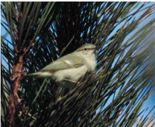
330 Hume's Leaf Warbler / Humes Bladkoning Phylloscopus humei , Zwartewaal, Zuid-Holland, 7 January 2000 (Arthur Geilvoet)

Monosyllabic calls (figures 5-7) In figure 5, the call is shown of a bird that confused a lot of observers. Its quality is almost like the common contact call of (nominate subspecies) Northern Chiffchaff. At the time of observation (1990), nothing was documented about such aberrant calls for humei . This bird was – as far as I know –