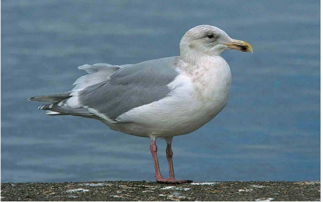
318 Glaucous-winged Gull / Beringmeeuw Larus glaucescens , probably fifth calendar-year, Petaluma, Sonoma County, California, USA, 5 March 1999. As adult but with reduced white in primaries and with large black bill-markings

319 Presumed hybrid Glaucous-winged x Western Gull / vermoedelijke hybride Beringmeeuw x Californische Meeuw Larus glaucescens x occidentalis , third calendar-year, Portland, Oregon, USA, October 1991. Note very dark grey primary-tips and dark mantle, probably too dark for Glaucous-winged Gull; extensive scaling on head and breast and dark bill indicative of Glaucous-winged parentage. Small white tips on primaries, dull pinkish legs and dark bill point towards third-winter plumage; adult would show more white in wing, as well as yellow bill and brighter legs