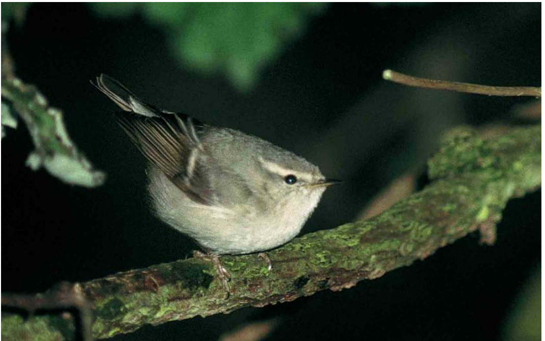
327 Hume's Leaf Warbler / Humes Bladkoning Phylloscopus humei , De Blocq van Kuffeler, Flevoland, 30 December 1990