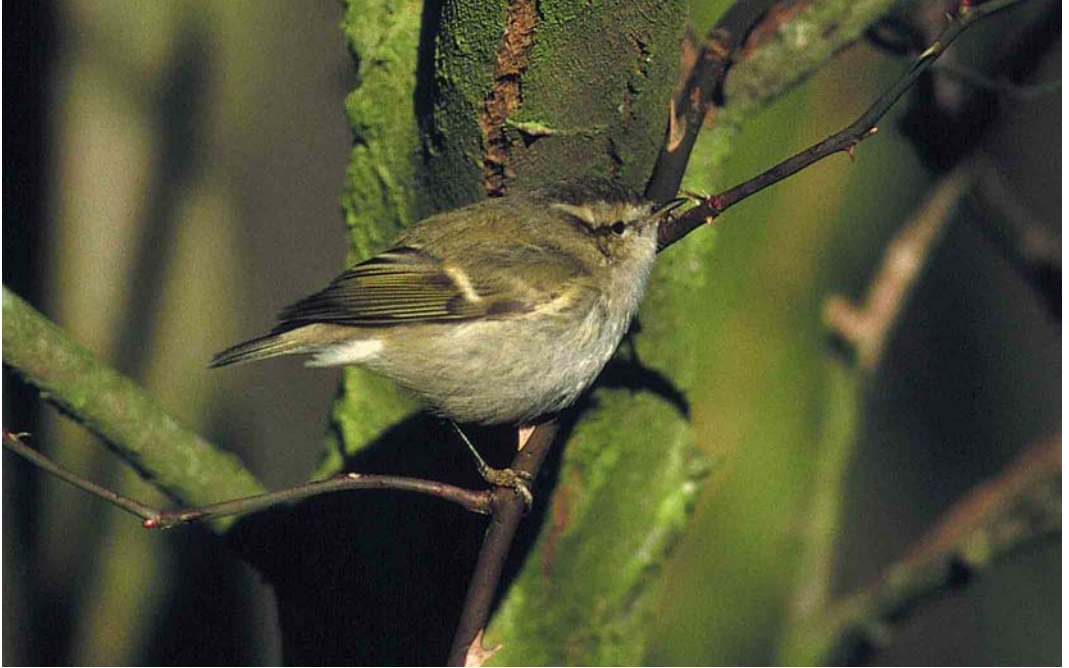
326 Hume's Leaf Warbler / Humes Bladkoning Phylloscopus humei , Uithof, Den Haag, Zuid-Holland, 29 December 1995 (Peter van Rij)