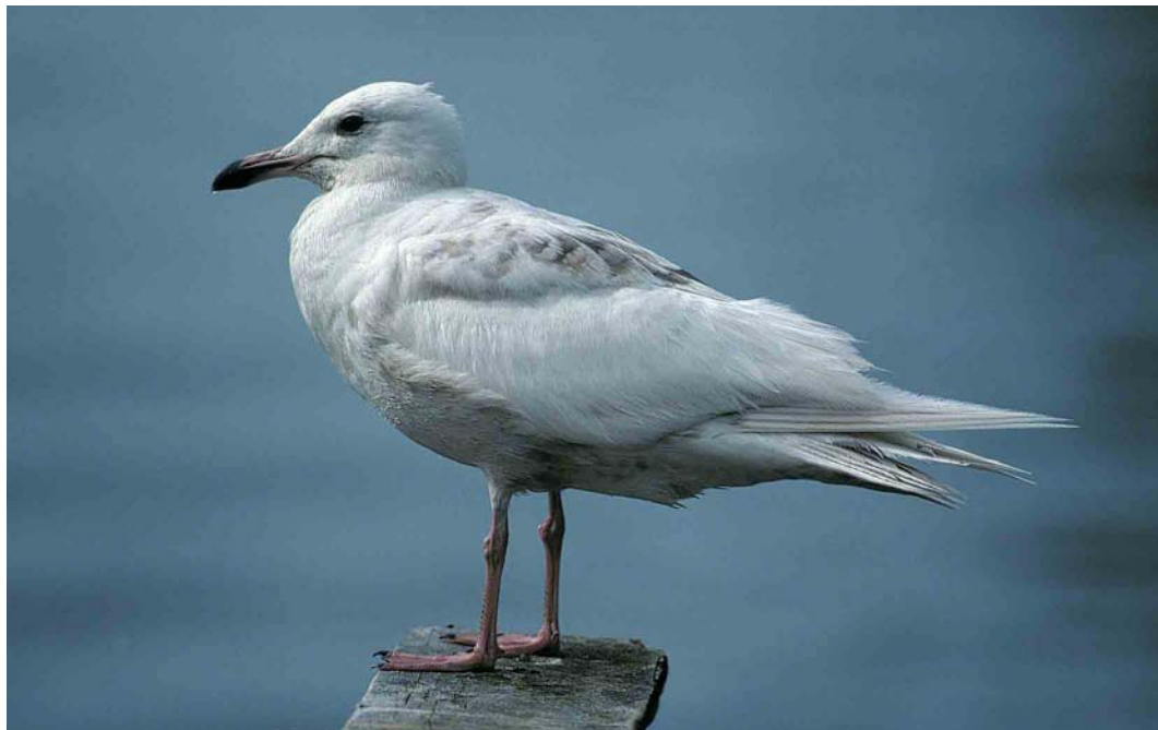
320 mystery gull / raadselmeeuw Larus , immature, Telegraph Cove, Vancouver, British Columbia, Canada, July 1994 (René Pop). Very difficult bird, presumably in second-summer plumage. Extremely pale plumage, including all-white wing tips, indicate Glaucous Gull or Kumlien's/Thayer's Gull L. glaucooides kumlieni/thayeri , or leucistic plumage of these or other gull species. Pale plumage and structural features could indicate Glaucous x American Herring Gull hybrid L. hyperboreus x smithsonianus ; rounded head, rather slender bill and long wings fit American Herring Gull better than Glaucous. Strongly marked mantle feathers do not fit Glaucous or Kumlien's

bevindt zich 'hoog' in de kop. De poten zijn bruin-roze tot diep roze. De kleur van de bovendelen en vleugel is middelgrijs en de handpentekening is grijs met wit, vrijwel gelijk in grijs tint aan de bovendelen en rest van de vleugel. Hierdoor houdt het patroon op de vleugeltop het midden tussen de 'witvleugelige' burgemeesters en de zwart-wit tekening van veel andere grote meeuwen (herinnerend aan Kumliens Meeuw L. glaucooides kumlieni ). In winterkleed vertoont Beringmeeuw een karakteristiek patroon van grijsbruine 'golflijntjes' op de kop, hals en (soms) zijborst, als afdrucken van een duim. Deze tekening verschilt van de bruine lengtestreping die veel andere grote meeuwensoorten in de winter vertonen en is diagnostisch voor Beringmeeuw en komt ook vaak voor bij hybriden van Beringmeeuw met andere soorten.