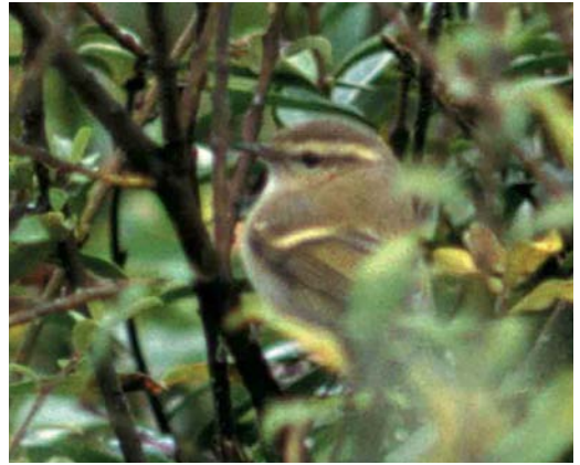
329 Hume's Leaf Warbler / Humes Bladkoning Phylloscopus humei , Katwijk aan Zee, Zuid-Holland, 8 November 1999

not heard calling otherwise. This particular bird showed itself very well, however, so there was in the end little doubt about its identity as a humei (plate 327). The duration of the call is only 0.17 s.