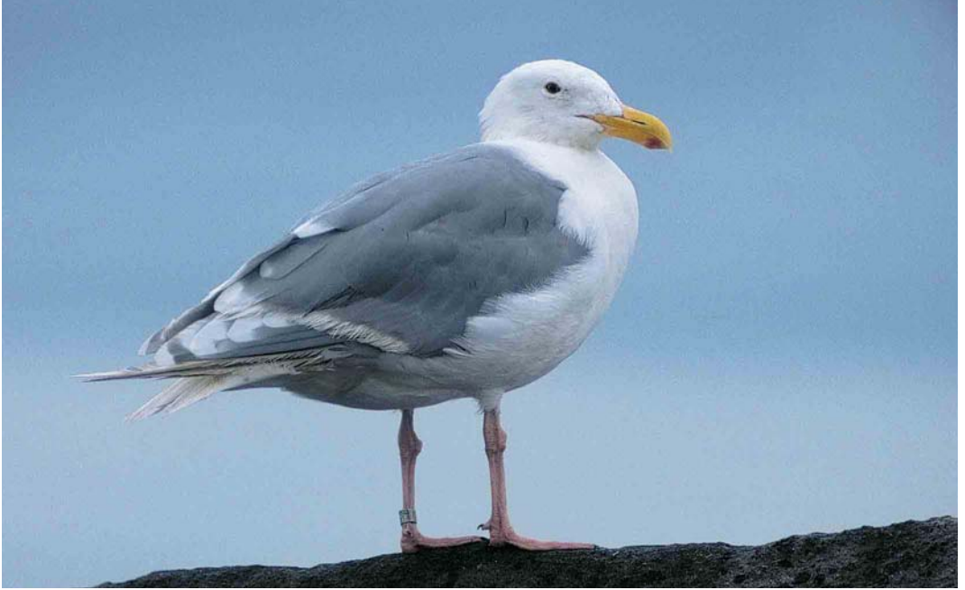
280 Glaucous-winged Gull / Beringmeeuw Larus glaucescens , adult, Westport, Washington, USA, 29 August 1986 (Arnoud B van den Berg). Bird showing typical head shape with small, dark eye high in the head and strong bill. Inner primaries are new, outer two primaries are old and very worn

other species – though aberrant examples of their species may occasionally cause trouble – as the separation of ‘pure’ Glaucous-winged Gull from ‘look-alike’ American West Coast gull hybrids, especially Glaucous-winged x Western Gull L. occidentalis hybrids (Bell 1996) and Glaucous-winged x American Herring Gull L. smithsonianus hybrids (Merilees 1974, Patten & Weisbrod 1974, Howell & Corben 2000). Such hybrids are perhaps even less likely to occur in the Western Palearctic than Glaucous-winged Gull but they are migratory and have a significant vagrancy potential. Glaucous-winged x Western Gull hybrids are possibly the most likely, since they are common both in British Columbia in summer and in California in winter, and they therefore migrate over quite long distances. Some populations in Washington, USA, consist mostly of hybrids (Sibley 2000). Glaucous-winged Gull also hybridizes with Slaty-backed Gull L. schistisagus on the Korjak shore of Kamchatka and hybrids occur in winter in Japan (Firsova & Levada 1982, cf King & Carey 1999). Hybridization occurs with Glaucous Gull L. hyperboreus (of the subspecies L. h. barrovianus ) along the eastern Bering Sea coast of Alaska where