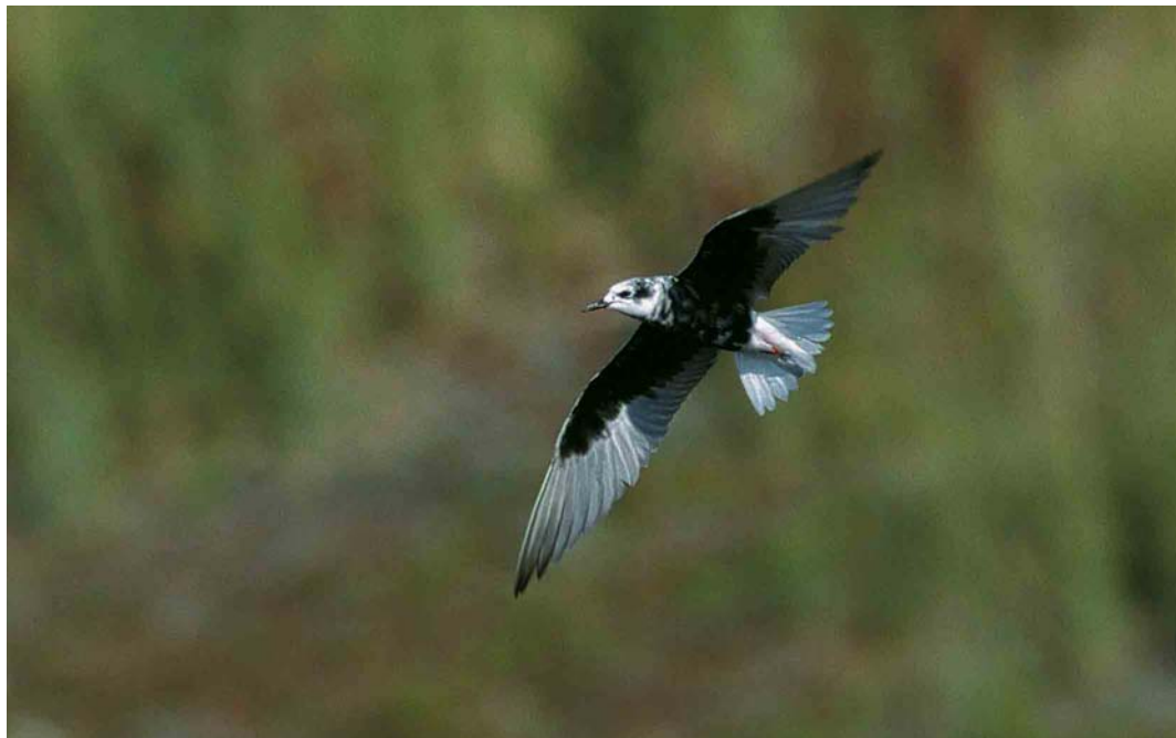
350 Witvleugelstern / White-winged Tern Chlidonias leucopterus , adult ruiend van zomer- naar winterkleed, Den Oever, Noord-Holland, 5 augustus 2001 (Jan Stok)