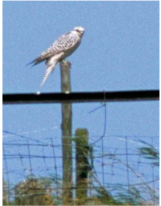
354 Vermoedelijke Giervalk / presumed Gyr Falcon Falco rusticolus , onvolwassen, Lauwersmeer, Groningen, 9 september 2001 (Eric Koops)

Aangetekend moet worden dat een waarneming van een wilde Giervalk eind augustus uitzonderlijk vroeg zou zijn. In Groot-Brittannië beginnen de najaarswaarnemingen rond half september met lage aantallen tot half november; daarna nemen de waarnemingen toe en houden aan tot eind april, met een kleine piek eind maart. Van de c 250 Britse gevallen was er tot nu toe maar één in augustus. BERT CORTÉ, WERY HEGGE & ENNO B EBELS