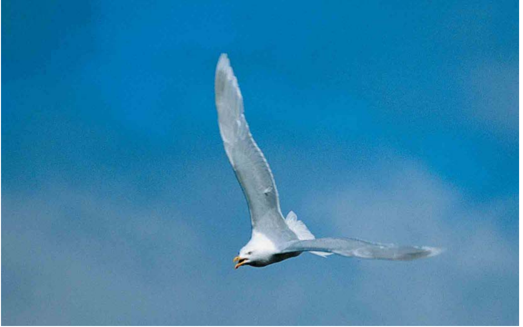
287 Presumed hybrid Glaucous x European Herring Gull / vermoedelijke hybride Grote Burgemeester x Zilvermeeuw Larus hyperboreus x argentatus , adult, probably male, Kálfatjörn, Vatnsleysuströnd, south-western Iceland, June 1999 (Gunnar Þór Hallgrímsson). This bird was paired with normal European Herring Gull and was probably a male as it was larger than its mate. Voice was identical with that of European Herring Gull; Glaucous Gulls have quite different calls. High degree of variation occurs in coloration of primaries and most presumed hybrids in south-western Iceland are very much like European Herring Gull in size and structure (Gunnar Þór Hallgrímsson in litt). Pure Glaucous Gull would be expected to show different structure, paler grey upperparts and more white in primary-tips

the same grey colour but the outer five to seven primaries (usually six) have a slightly darker grey pattern, increasing in extent outwards. P10 (the outermost primary) is largely medium-grey with a white mirror. P9 also may have a subterminal white mirror and, rarely, a small white mirror may be present on p8 (cf Grant 1986, Klaus Malling Olsen in litt). The white subterminal spots on the outer primaries ('pearl drops' or 'string of pearls') are often not very conspicuous – although they can be more obvious from below, in good light. These whitish tongue-tips are usually present on p5-9 but sometimes only on p5-8 or even p5-7. The medium-grey pattern is most visible on the distal halves of the outer primaries, becoming very diffuse on the basal halves of p8-10. It is often difficult to judge the exact extent of medium-grey markings basally on these primaries (especially in the field) since the colour is so similar to the remainder of the