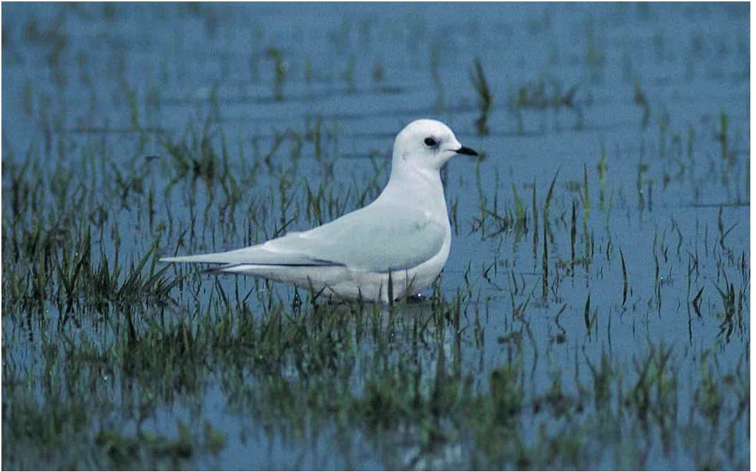
172 Ross's Gull / Ross' Meeuw Rhodostethia rosea , adult, Leuchtenbuch, Bayern, Germany, 27 March 2001 (Markus Roemhild)