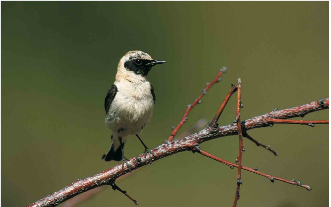
169 Western Black-eared Wheatear / Westelijke Blonde Tapuit Oenanthe hispanica , adult male, Algarve, Portugal, 2 June 1998. Same bird as original mystery bird. Note orange-buff tinge on nape and crown. Black on head extends narrowly over bill base unlike in most Western Black-eared Wheatears, but does not reach far down over throat as in Eastern Black-eared Wheatear O. melanoleuca and shows more rounded rear border

between Western Black-eared Oenanthe hispanica and Eastern Black-eared Wheatear O. melanoleuca , formerly treated as two subspecies of a single species (cf Dutch Birding 20: 22-32, 1998). These two species are very similar and show only subtle differences in general coloration and, in males, shape of the black face patch. The mystery bird is a male of the black-throated form, which occurs in both species (but is more common in Eastern).