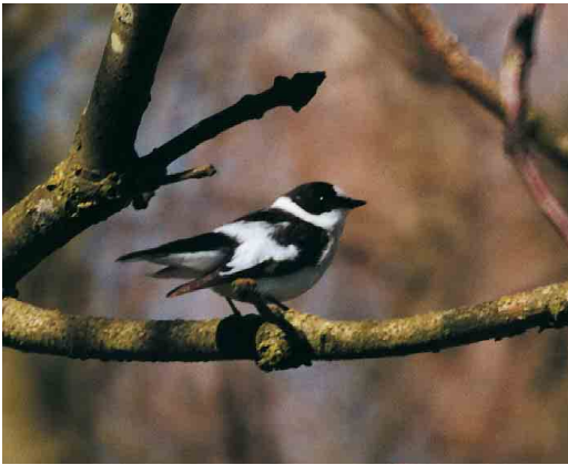
196 Withalsvliegenvanger / Collared Flycatcher Ficedula albicollis , eerste-zomer mannetje, Lies, Terschelling, Friesland, 6 mei 2001 (Johan van der Louw)

is het van belang om verdacht te zijn op hybriden met Bonte Vliegenvanger F hypoleuca (die zich bijvoorbeeld 'verraden' door een onderbroken halsband en een minder duidelijke stuitvlek) en Bonte Vliegenvangers van de ondersoorten F h iberiae en F h speculigera uit respectievelijk Centraal-Spanje en Noordwest-Afrika die in veel kenmerken meer overkomt vertonen met Withalsvliegenvanger dan met Bonte. Zo hebben deze ondersoorten – misschien gaat het ook wel om een aparte soort – een grote witte handpenvlek, een grote witte voorhoofdsvlek, een lichtere stuitvlek en soms een vrijwel volledige witte halsband! De vogel van Terschelling vertoonde – net als die van Vlieland, Friesland, in mei 1996 – enig wit op de buitenste staartpen. Meestal is de staart bij Withalsvliegenvanger helemaal zwart, terwijl Bonte en met name Balkanvliegenvanger F semitorquata (veel) meer wit in de buitenste staartpen(nen) vertonen. Enig wit op de buitenvlag van de buitenste staartpen of zelfs op meer penen is echter bij Withalsvliegenvanger niet ongebruikelijk.