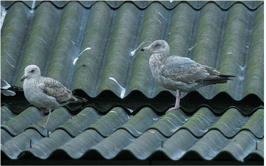
185 American Herring Gull / Amerikaanse Zilvermeeuw Larus smithsonianus , second-winter, Douro river, Portugal, 30 March 2001