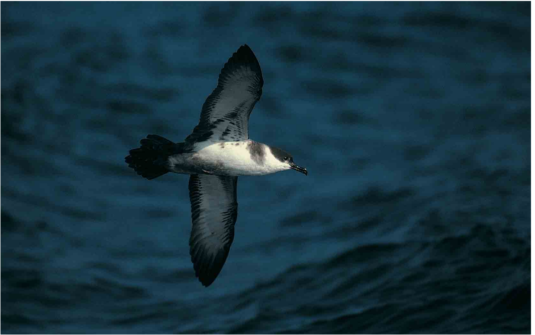
154 Great Shearwater / Grote Pijlstormvogel Puffinus gravis , off south-western Ireland, September 1991 (Anthony McGeehan)