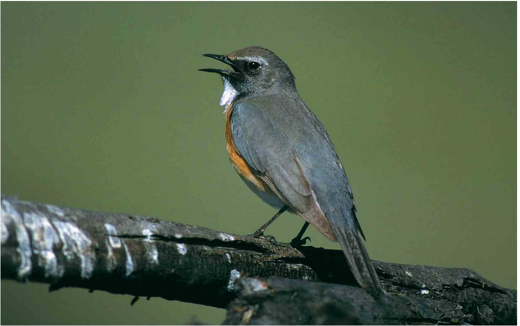
187 White-throated Robin / Perzische Roodborst Irania gutturalis , male, Lesbos, Greece, 11 May 2001

at Khor Kalba on 27 March. On 22 March, an adult Lesser Crested Tern S bengalensis wearing an Italian ring was seen at Viareggio, Toscana, Italy. On Lesbos, one was seen on 4-6 May. If accepted, an adult Roseate Tern reported here on 23 March will be the fourth for Italy. In Israel, up to four White-cheeked Terns S repressa were seen at North Beach, Eilat, between 3 April and 6 May.