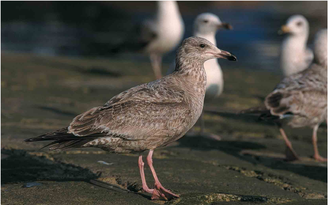
186 American Herring Gull / Amerikaanse Zilvermeeuw Larus smithsonianus , juvenile, Matosinhos, Portugal, 1 April 2001