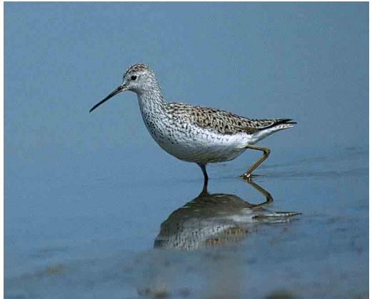
195 Poelruiter / Marsh Sandpiper Tringa stagnatilis , Longchamps, Namur, 22 april 2001 (Antoine Joris)

HOPPEN TOT GORZEN Op 17 april verbleef een Hop Upupa epops op Blokkersdijk, Antwerpen, en op 27 april werd er één opgemerkt bij De Panne. De eerste Draaihals Jynx torquilla werd op 28 april gezien bij Antwerpen. Duinpiepers Anthus campestris werden