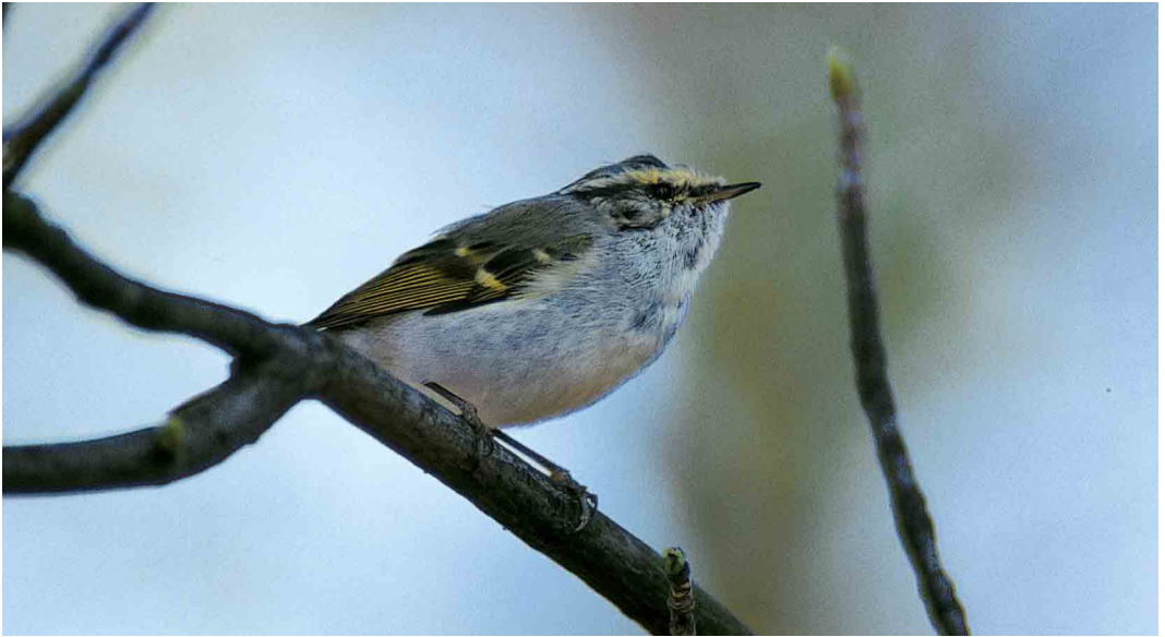
194 Pallas' Boszanger / Pallas's Leaf Warbler Phylloscopus proregulus , Vlaardingen, Zuid-Holland, 2 april 2001