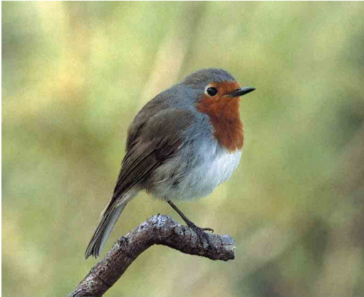
166 Tenerife Robin / Teneriferoodborst Erithacus superbis , Genoves, Tenerife, Canary Islands, February 1998. Note dark throat and breast