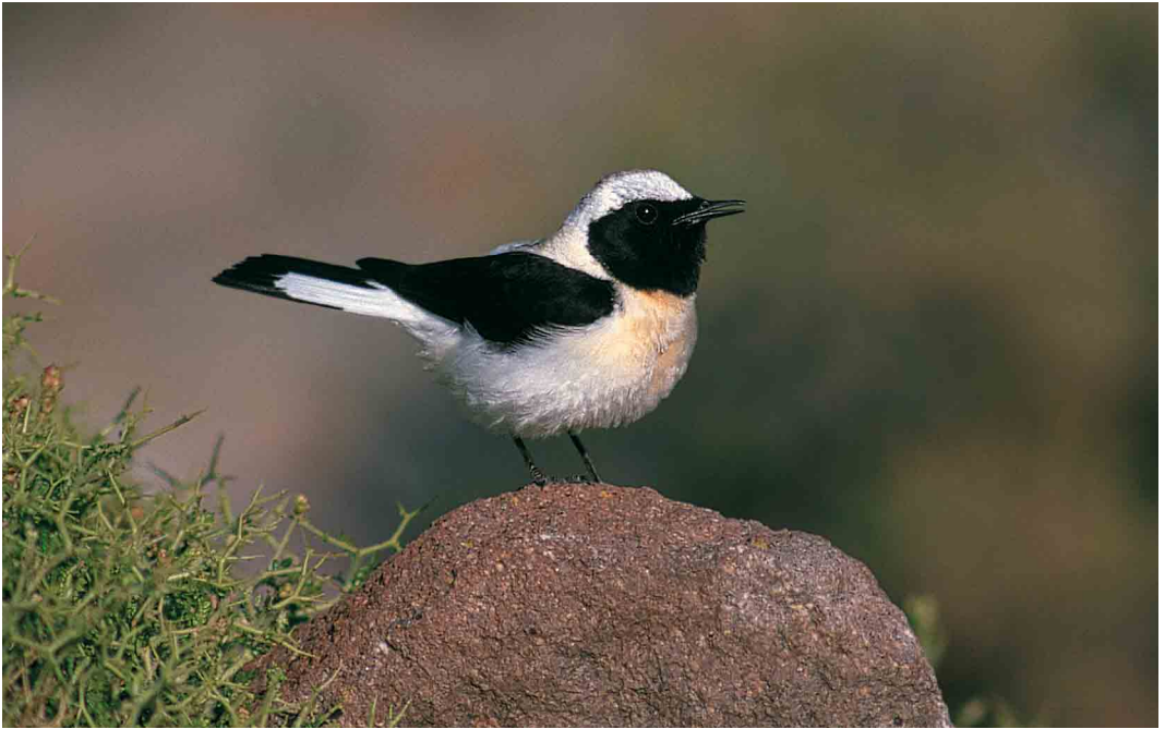
170 Eastern Black-eared Wheatear / Oostelijke Blonde Tapuit Oenanthe melanoleuca , adult male, Lesbos, Greece, 1 May 2001 ( René Pop ). Note very extensive black throat patch, reaching far down and including lower throat, and typically squarely bordered at rear. Black extending distinctly over bill base and, in this individual, also well above eye. Only weak buffish tinge to mantle 171 Western Black-eared Wheatear / Westelijke Blonde Tapuit Oenanthe hispanica , male, Oued Massa, Morocco, 16 April 1997 ( Arnoud B van den Berg ). Black does not extend over bill base. Note typical bright orange-buff coloration of this early spring bird (becoming more whitish in late spring and summer)