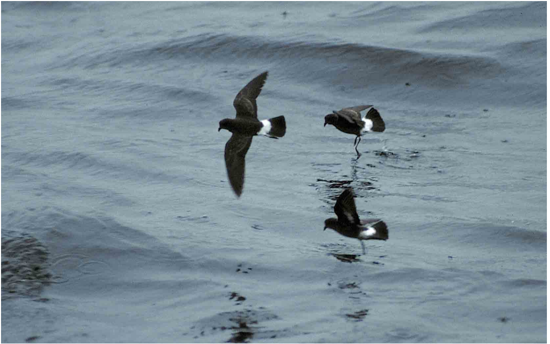
146 European Storm-petrels / Stormvogeltjes Hydrobates pelagicus , off south-western Ireland, August 1985 (Anthony McGeehan)