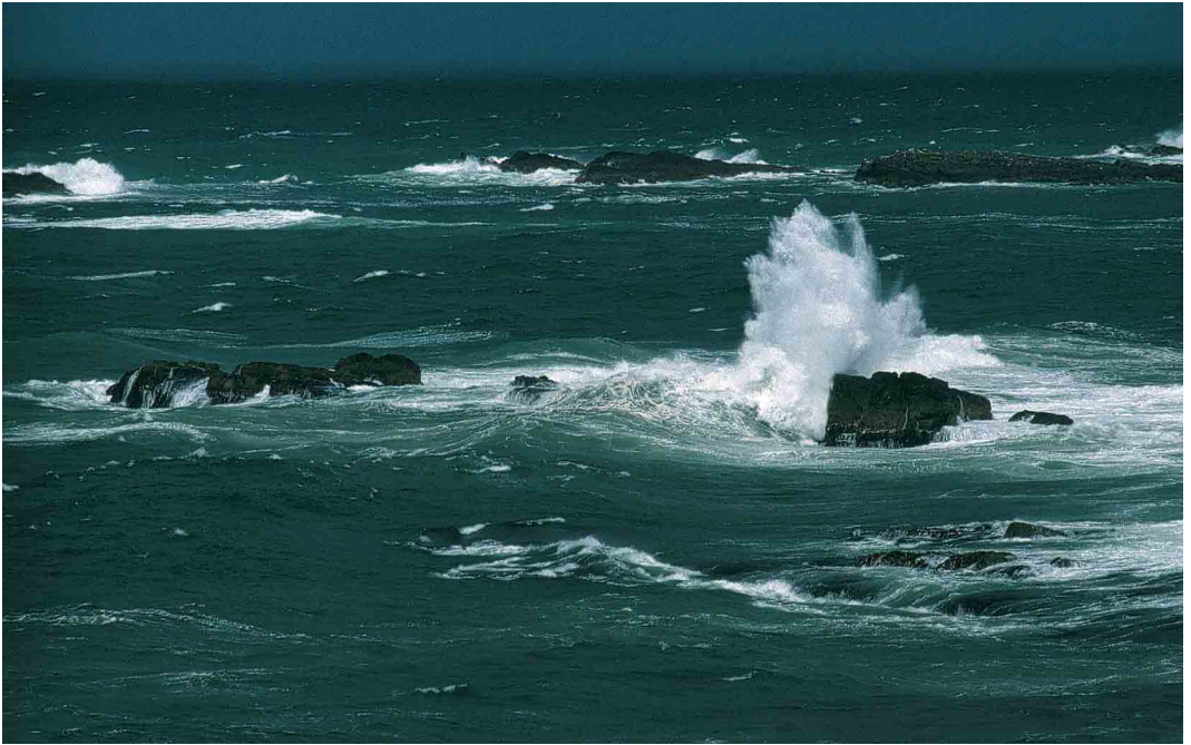
151 Ideal seawatching weather – squally showers and blustery onshore winds – at Ramore Head, Antrim, Northern Ireland, September 1992 (Anthony McGeehan)

Once you know the species, it can be surprisingly straightforward to identify. Unlike European Storm-petrel and Leach's Storm-petrel, Wilson's usually fly strongly and glide with a fixed-wing, level flight-path even in strong winds. When they pause to foot-patter, they use a remarkably vigorous 'puppet on a string' action with long legs kicking off the sea surface and making the bird almost bounce.