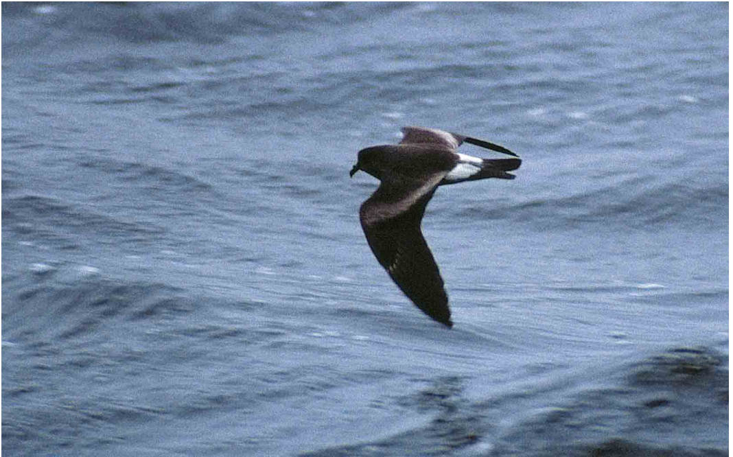
147 Leach's Storm-petrel / Vaal Stormvogeltje Oceanodroma leucorhoa , Newfoundland Grand Banks, North Atlantic Ocean, September 1997 (Bruce Mactavish)