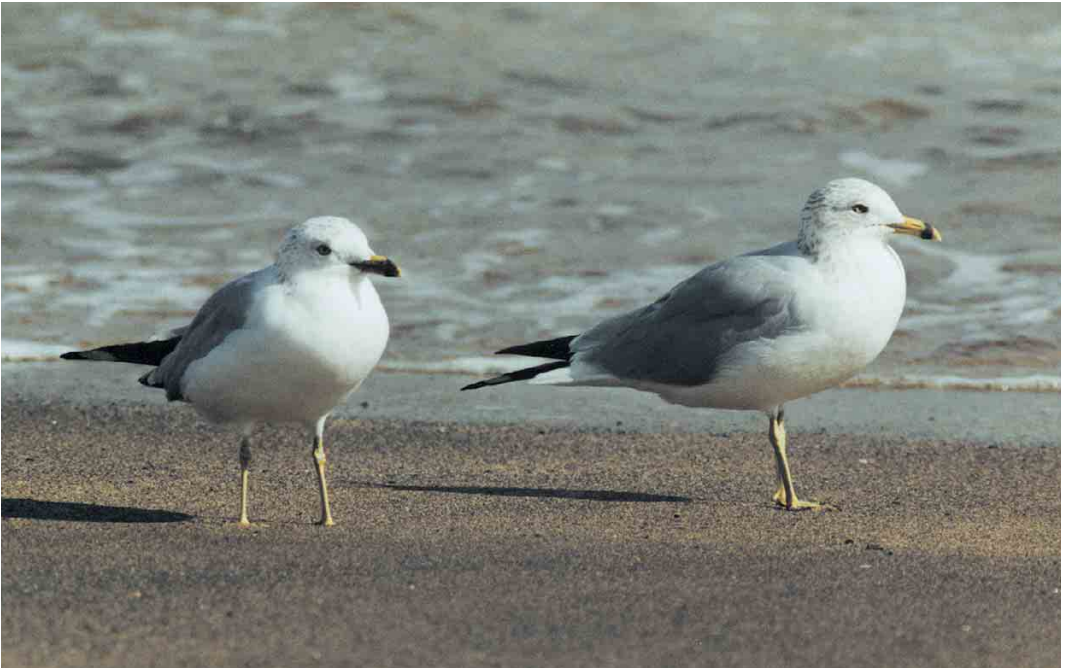
183 Ring-billed Gulls / Ringsnavelmeeuwen Larus delawarensis , Praia da Vitoria, Terceira, Azores, 10 March 2001 (Mark Bolton)