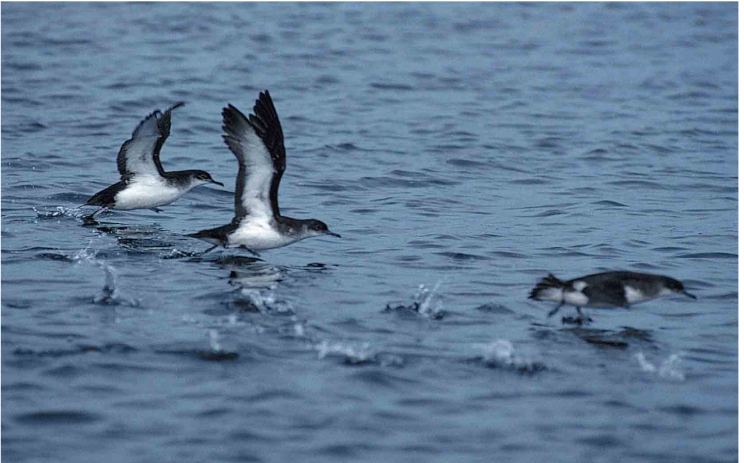
155 Manx Shearwaters / Noordse Pijlstormvogels Puffinus puffinus , Irish Sea, August 1996