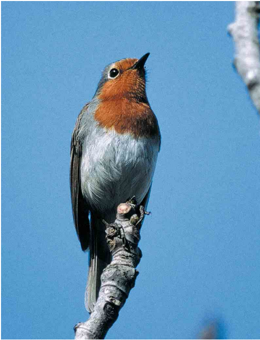
164 Tenerife Robin / Teneriferoodborst Erithacus superbus on its song post, Tenerife, Canary Islands, February 1987