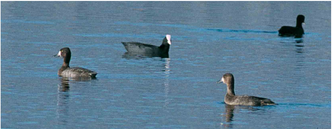
174 Tawny Eagle / Savannearend Aquila rapax , Timirist, Banc d'Arguin, Mauretania, 8 April 2001 ( Kris De Rouck ) 175 Tawny Eagle / Savannearend Aquila rapax , Urim, Israel, 23 March 2001 ( Jan Bisschop ) 176 Black-winged Stilts / Steltkluten Himantopus himantopus , Lages do Pico, Azores, 8 April 2001 ( Mark Bolton ) 177 Long-billed Dowitcher / Grote Grijze Snip Limnodromus scolopaceus , winter plumage, with Ruff / Kempphaan Philomachus pugnax , Dhofar Sun Farms, Oman, 10 March 2001 ( Eric Koops ) 178 Lesser Scaups / Kleine Toppers Aythya affinis , Roquito del Fraile, Tenerife, Canary Islands, 21 November 2000 ( Harry J Lehto )