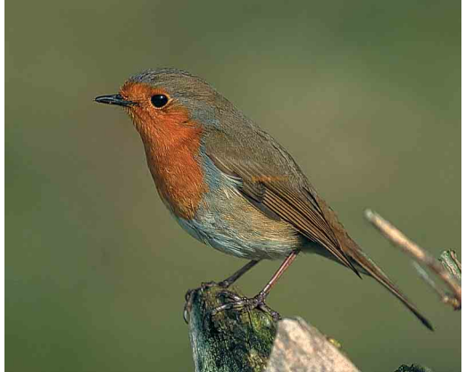
167 European Robin / Roodborst Erithacus rubecula , Kobbeduinen, Schiermonnikoog, Friesland, Netherlands, 27 March 1998

had not been preceded by songs of superbus as done by Stock & Bergmann (1988).