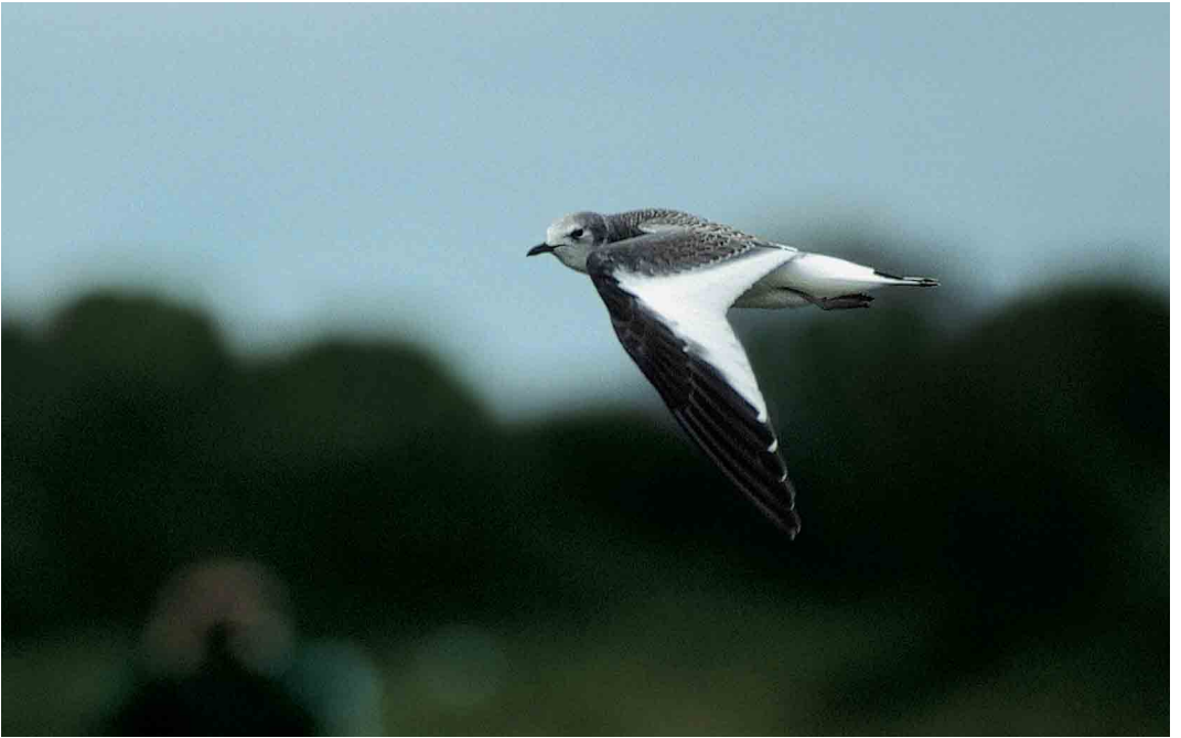
156 Sabine's Gull / Vorkstaartmeeuw Larus sabini , juvenile, Cork, Ireland, September 1984 (Anthony McGeehan)