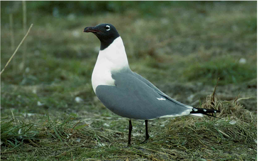
184 Laughing Gull / Lachmeeuw Larus atricilla , Zwillbrocker Venn, Nordrhein-Westfalen, Germany, 11 April 2001 (Martin Gottschling)