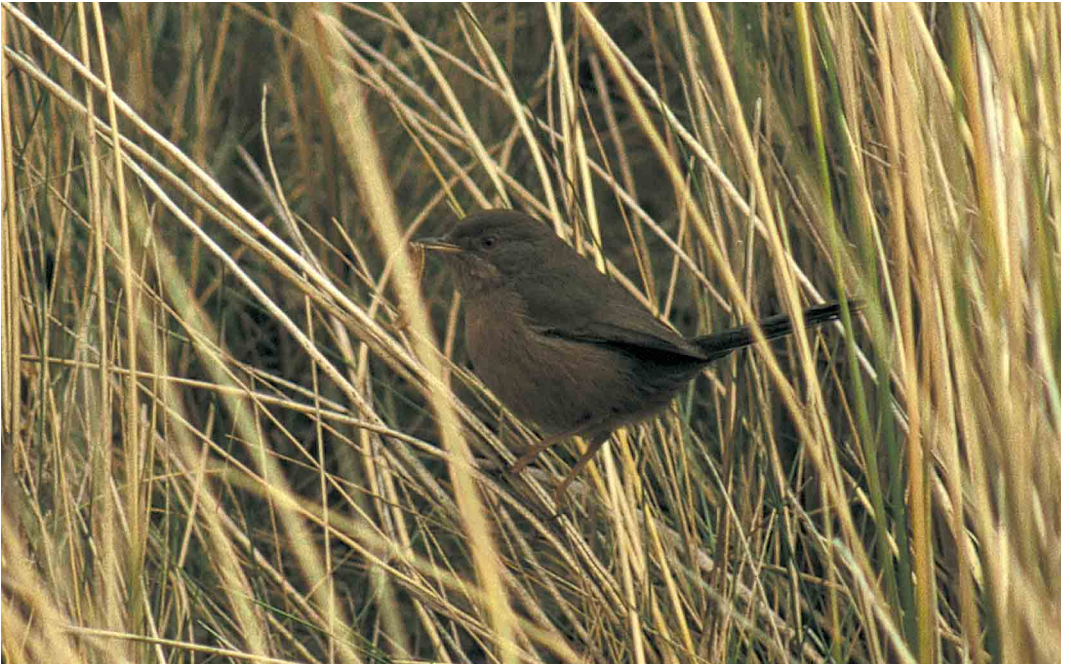
189 Provençaalse Grasmus / Dartford Warbler Sylvia undata , Maasvlakte, Zuid-Holland, 24 maart 2001 (Harm Niesen)