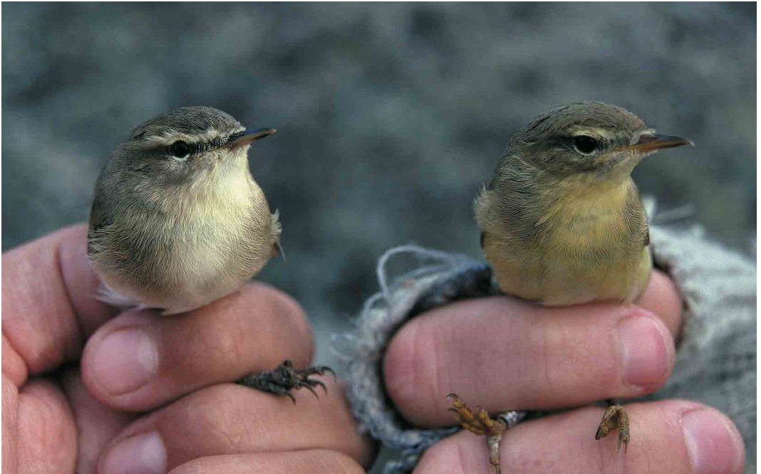
Mystery birds V (left) and VI (right) (September)

Taking all these (very subtle) features of the mystery bird into consideration, the balance tips in favour of Western Black-eared Wheatear. Fortunately, this identification is confirmed by the location of the bird, as it was photographed in the Algarve, Portugal, on 2 June 1998 by Ray Tipper. Another photograph of the same bird