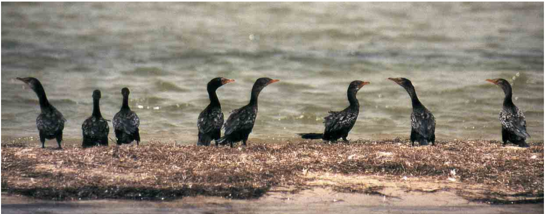
179 Leucistic Common Crane / leucistische Kraanvogel Grus grus , Lac du Der-Chantecoq, Marne, France, 28 December 2000 (Carl Derks) 180 Siberian Crane / Siberische Witte Kraanvogel Grus leucogeranus , with Hooded Cranes / Monnikskraanvogels G monacha , Arasaki, Kyushu, Japan, 7 February 2001 (Max Berlijn) 181 Demoiselle Cranes / Jufferkraanvogels Anthropoides virgo , K20, Eilat, Israel, 26 March 2001 (Nils van Duivendijk) 182 Long-tailed Cormorants / Afrikaanse Dwergaalscholwers Microcarbo africanus , Tidra Island, Banc d'Arguin, Mauretania, 8 April 2001 (Kris De Rouck)