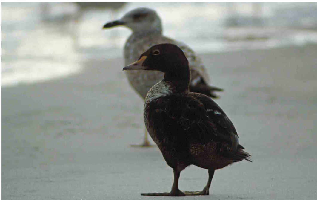
173 King Eider / Koningseider Somateria spectabilis , second-year male, Laxe, A Coruña, Galicia, Spain, 22 December 2000 (Edmundo Fraga)