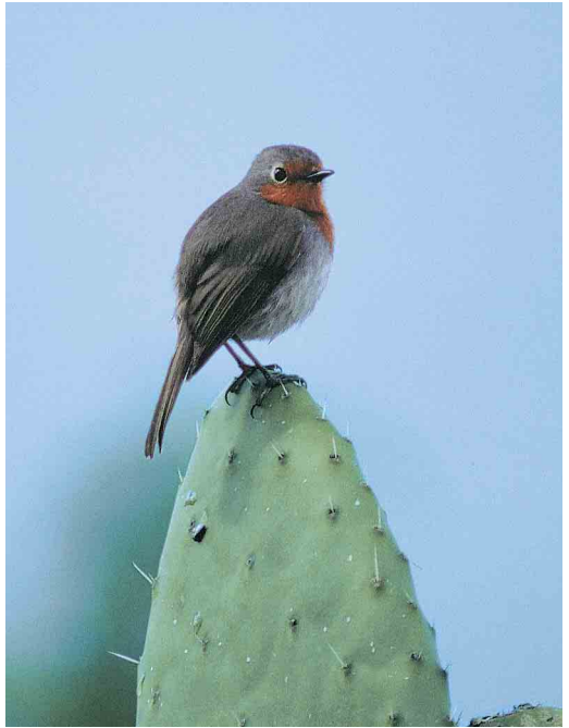
165 Tenerife Robin / Teneriferoodborst Erithacus superbus on Opuntia cactus, Tenerife, Canary Islands, February 1998

( n=91 ), constituting a highly significant difference. High-pitched elements of just less than 8 kHz occur more frequent in superbus than in rubecula . In superbus , the strophe usually begins with one or two short very high notes followed by a lower motif, which is usually repeated a number of times, or a trill, or a combination of these. In rubecula , the contrast between high and low material is also a striking feature of the song, but the general pattern of high units near the start, followed by lower material is more often than not repeated in the course of the much longer strophe, so that there is often a return to high units in the middle of the strophe (Magnus Robb in litt) It is unknown whether female superbus sings. Female rubecula does so, at least during territory establishment in autumn (Lack 1939, Hoelzel 1986).