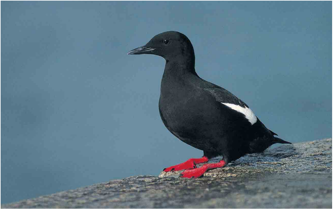
152 Black Guillemot / Zwarte Zeekoet Cephus grylle , Bangor, Down, Northern Ireland, June 1982 (Anthony McGeehan)