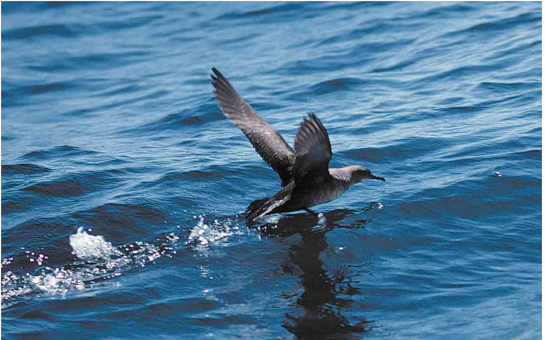
153 Balearic Shearwater / Vale Pijlstormvogel Puffinus mauretanicus , Catalunya, Spain, April 1996 (Anthony McGeehan)