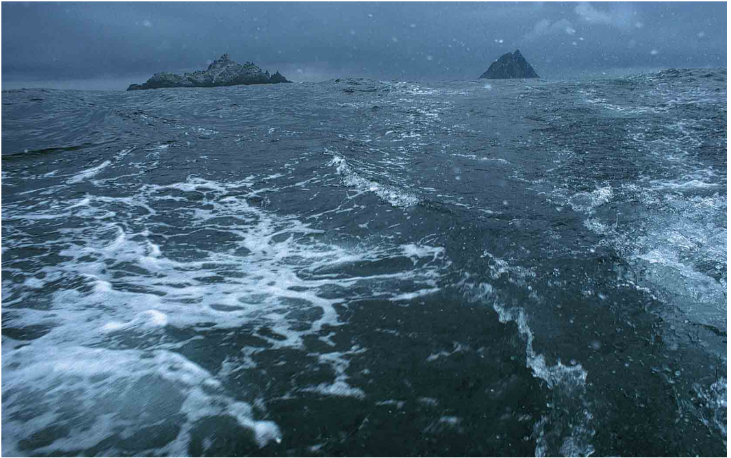
158 Skellig Islands, Kerry, Ireland. Located 10 km offshore, both islands have impressive concentrations of seabirds. Boat trips are available to Great Skellig (right) and both Manx Shearwaters Puffinus puffinus and European Storm-petrels Hydrobates pelagicus are reliably seen during the crossing (Anthony McGeehan)

possible) and the Great Skellig (Skellig Michael) has splendid monastic ruins and many breeding Atlantic Puffins Fratercula arctica and other very approachable seabirds. European Storm-petrels breed abundantly but only come ashore at night – after the day trips leave! Numerous boat trips cross from seaside villages on the Kerry coast and European Storm-petrels can be seen en route to the islands between May and late August. It is possible to book a boat trip on the internet (using ‘skelligs boat trips’ as a word search).