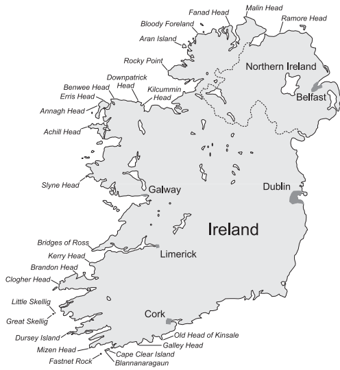
FIGURE 1 Seawatching sites in Ireland

much superior west coast sites and is only worth visiting in 'classic' north-westerly conditions. The best seawatch spot is beside a concrete life-belt stand reached by following the obvious coastal path around the headland.