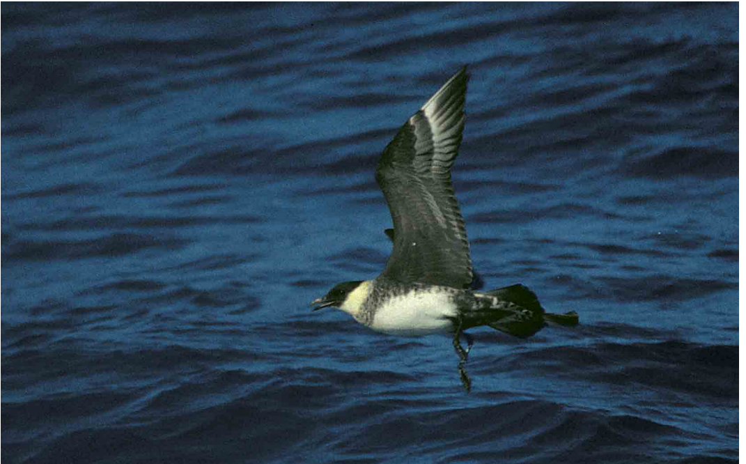
157 Pomarine Jaeger / Middelste Jager Stercorarius pomarinus , adult, off western Ireland, July 1993 (Anthony McGeehan)