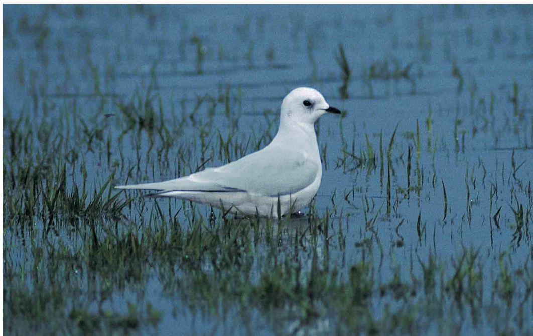
172 Ross's Gull / Ross' Meeuw Rhodostethia rosea , adult, Leuchtenbuch, Bayern, Germany, 27 March 2001