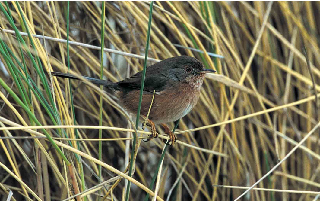
188 Provençaalse Grasmus / Dartford Warbler Sylvia undata , Maasvlakte, Zuid-Holland, 25 maart 2001 (Jan van Holten)