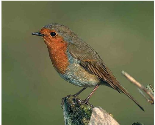
167 European Robin / Roodborst Erithacus rubecula , Kobbeduinen, Schiermonnikoog, Friesland, Netherlands, 27 March 1998

had not been preceded by songs of superbus as done by Stock & Bergmann (1988).