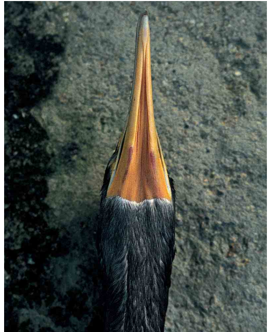
160-161 Double-crested Cormorant / Geoorde Aalscholver Hypoleucos auritus , Ouessant, Finistère, France, 8 October 2000 (Alain De Broyer)

of many ecosystems, especially that of the Great Lakes. Today, the population is at historic highs, in large part due to the presence of ample food in their summer and winter ranges, federal and state protection, and reduced contaminant levels. The Interior population of Cormorants, which includes the Great Lakes region, is the fastest growing of the six major North American cormorant breeding populations. During 1970-91, in the Great Lake region of the USA and Canada, the number of Double-crested Cormorant nests increased from 89 to 38 000, an average annual increase of 29%. For the contiguous USA as a whole, the breeding population increased at an average rate of 6.1% per year during 1966-94, and now stands at c 372 000 breeding pairs. Using estimates of one to four non-breeding birds per breeding pair yields an estimated total population of between one and two million birds (cf Katzenberger & Tollefson 1999).